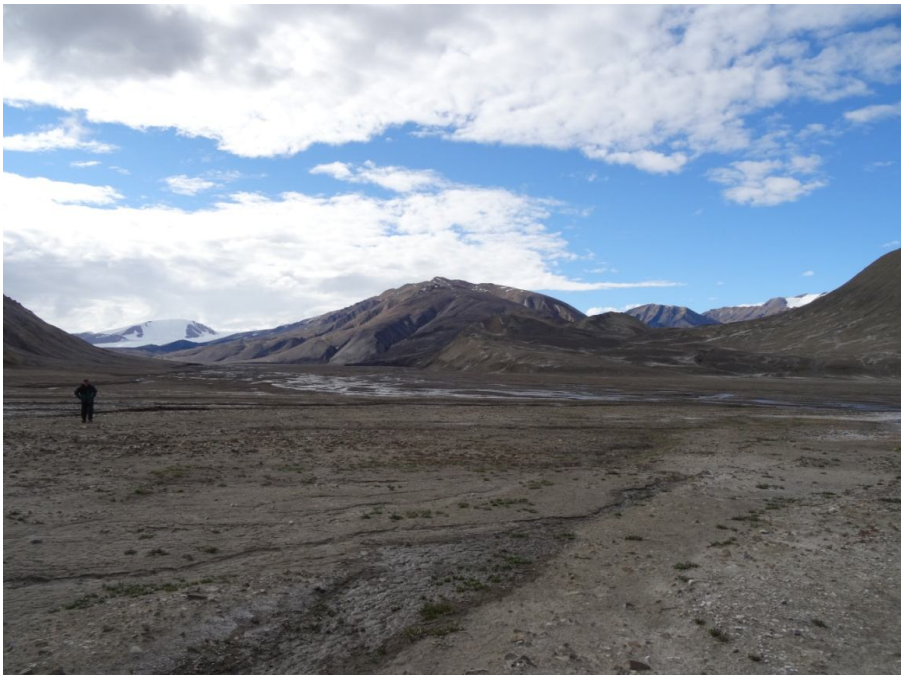
Figure 3 view away from camp