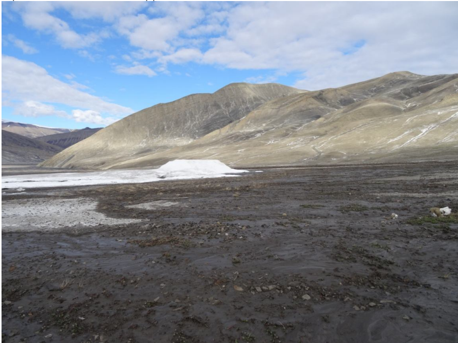
Figure 1. Location of camp coordinates