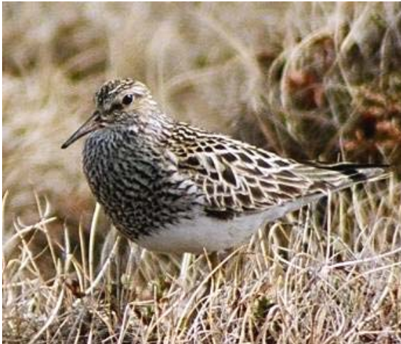
Photo 1 – Male Pectoral Sandpiper. The most common shorebird on the surveys.