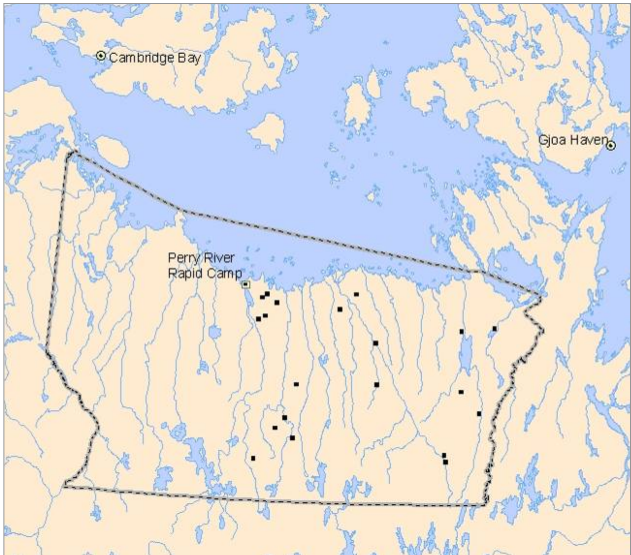
Map 1 – Map of Arctic Shorebird Monitoring Program 2006 study area in Queen Maud Gulf Migratory Bird Sanctuary showing camp and survey plot locations.