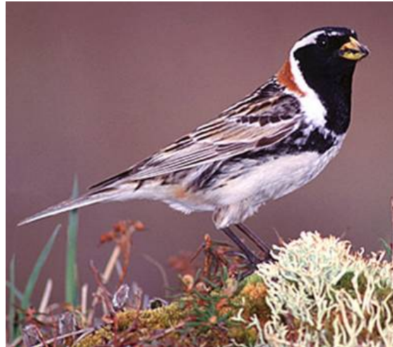
Photo 2 – Male Lapland Longspur. The most common bird seen during the surveys.