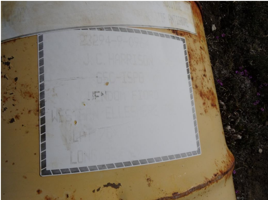
Figure 2 Labels on 4 drums of helicopter fuel