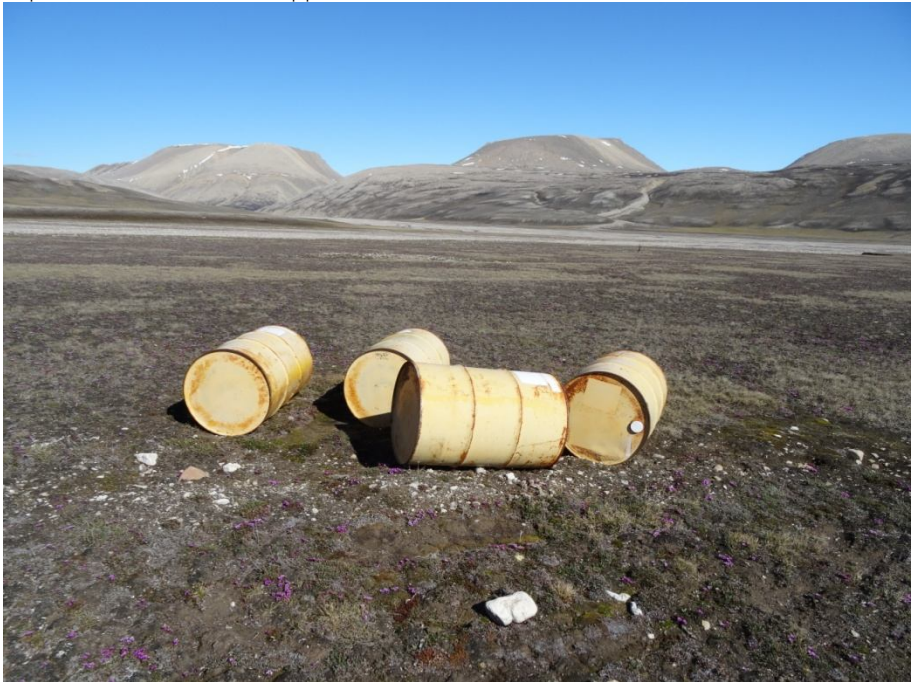
Figure 3 Drums as found on site