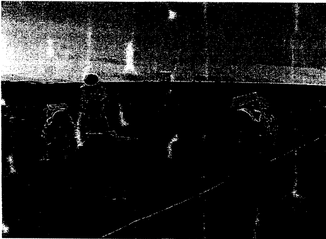
Figure 1: EVA crew member K. Quinn hits the sledge hammer under the rain during the second EVA on 12 July, while V. Pletser operates the SAS under monitoring of K. Zubrin; the Mars Habitat is visible in the background.