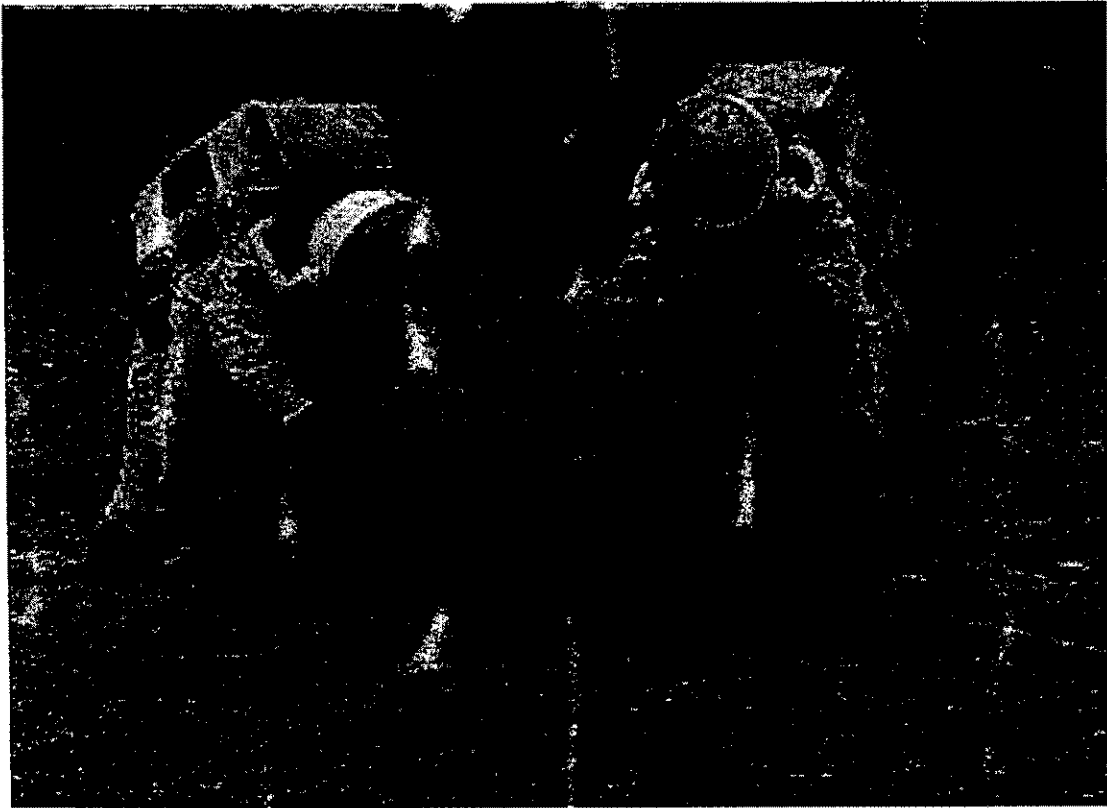
Figure 3: EVA crew members R. Zubrin and V. Pletser pushing the instrumentation trailer out of the mud in the Haughton crater during the fifth EVA of 16 July.