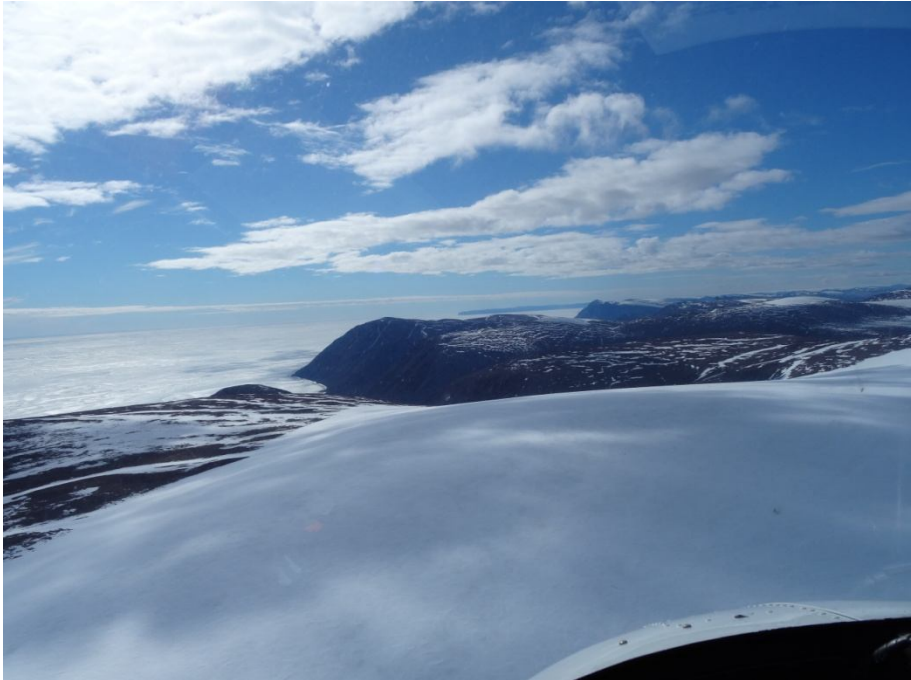
Figure 1 July 6 2014 Top facing south of the Grise Fiord Glacier North of Grise Fiord