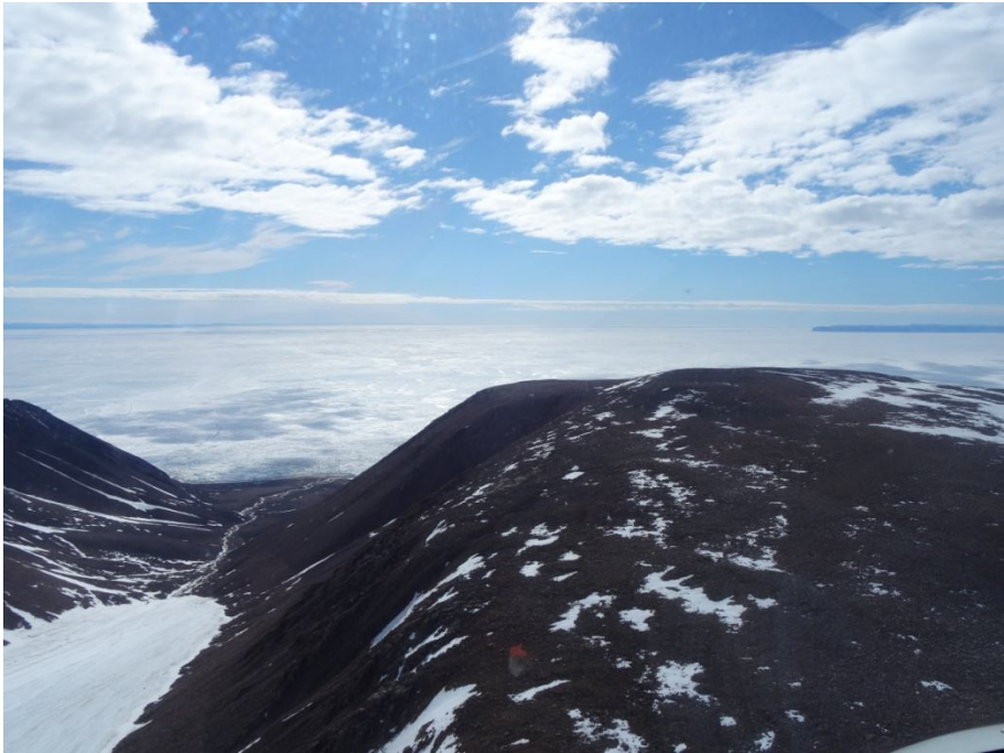
Figure 2 July 6 2014 Glacial extent in valley west of the Community