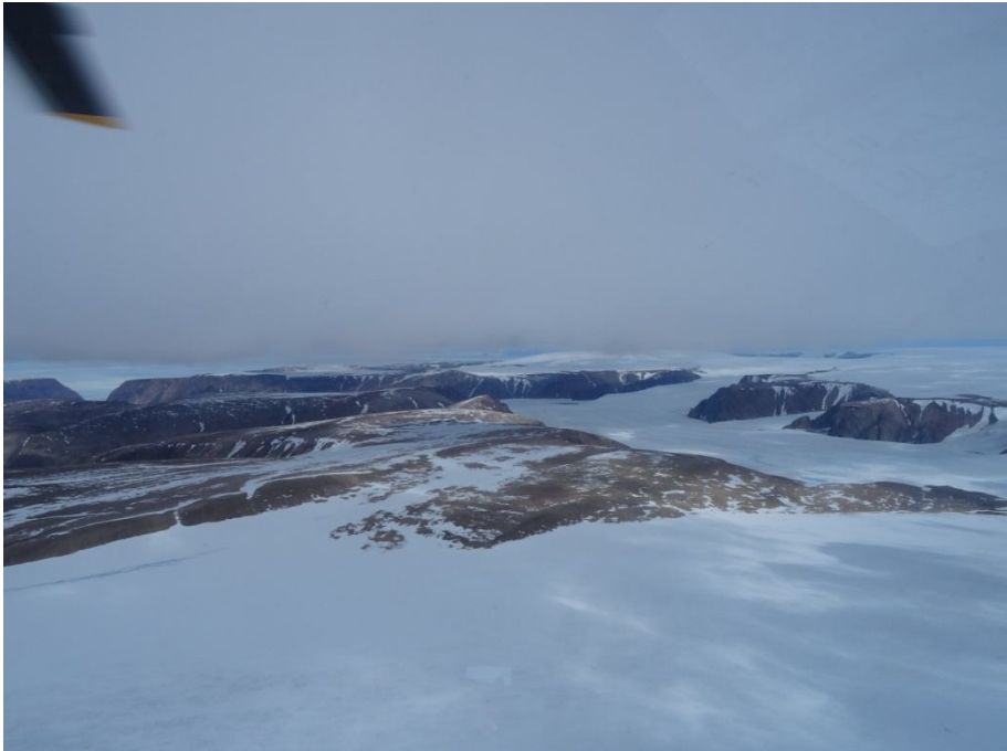
Figure 4 July 9th, Poor weather on Devon Ice Cap. Too dangerous to continue