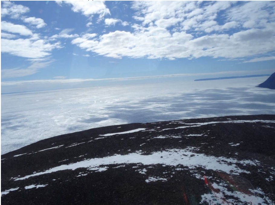
Figure 3 Location Listed in 3BC-MBA License for the Grise Fiord Glacier