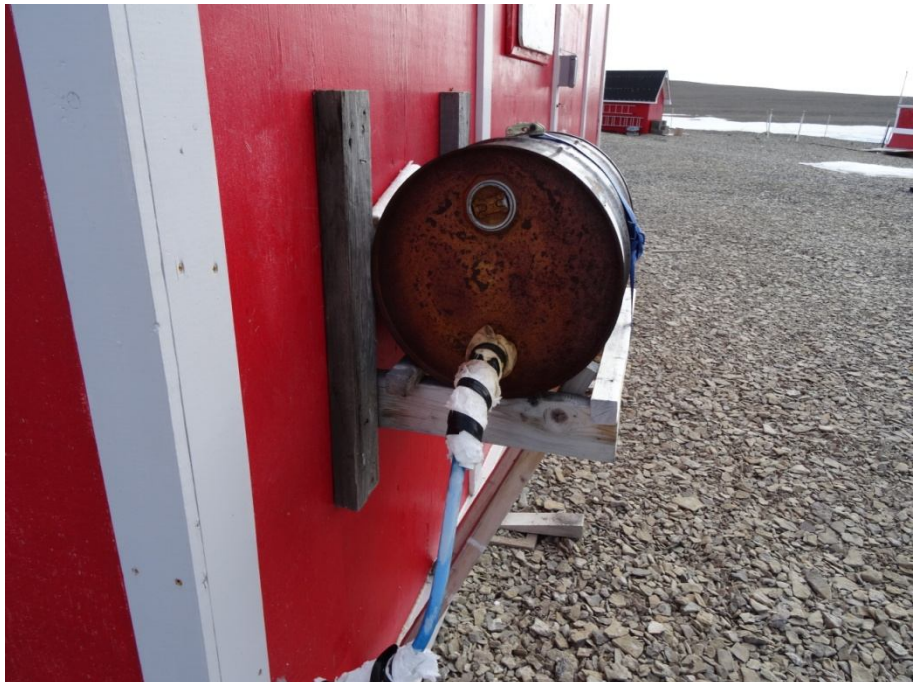
Figure 10 Fuel tank outside one of the buildings. Joints are wrapped