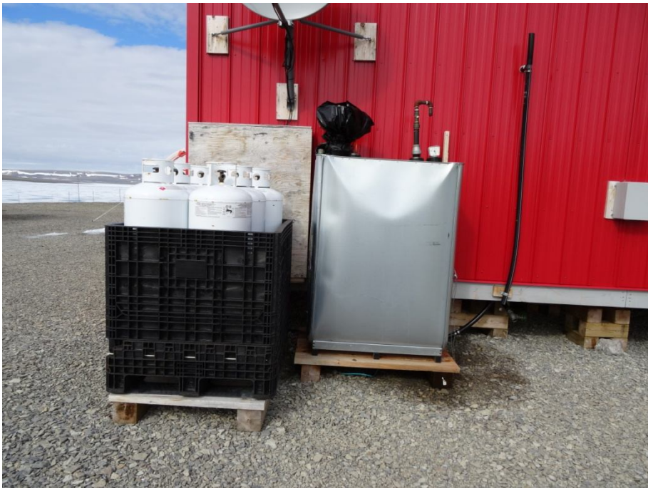
Figure 4 Fuel tank behind main building