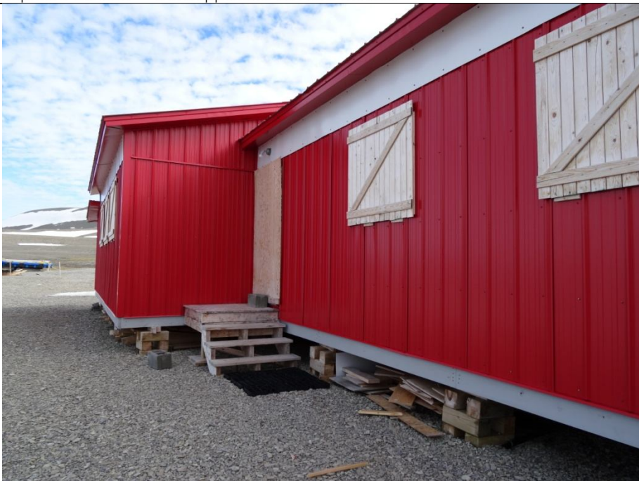
Figure 2 Main hall or mess building