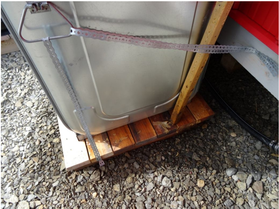
Figure 6 Tank secured to building using metal round ,, note fuel staining