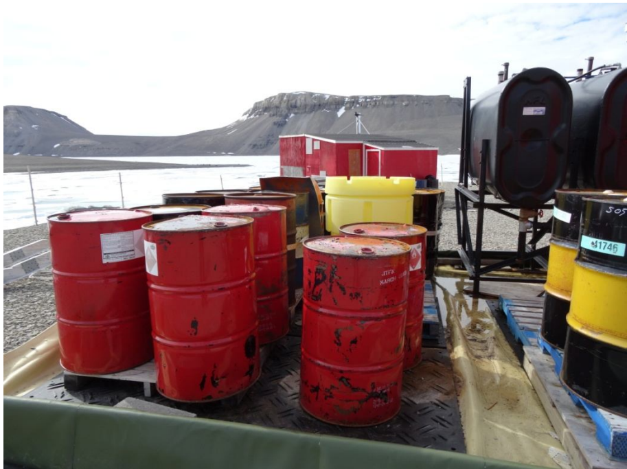
Figure 9 Secondary containment