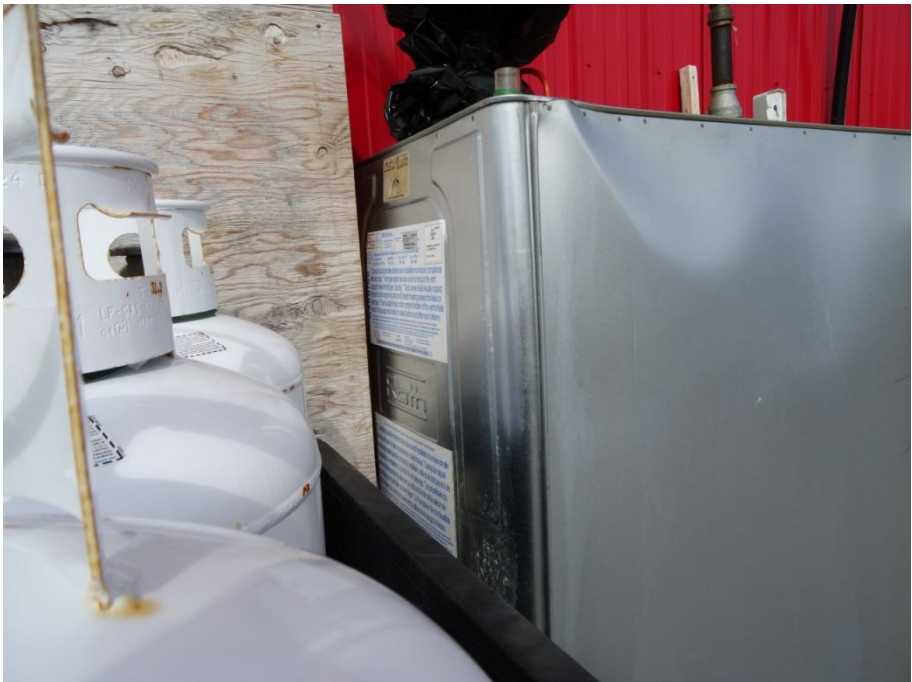
Figure 7 Buckling at opposite end