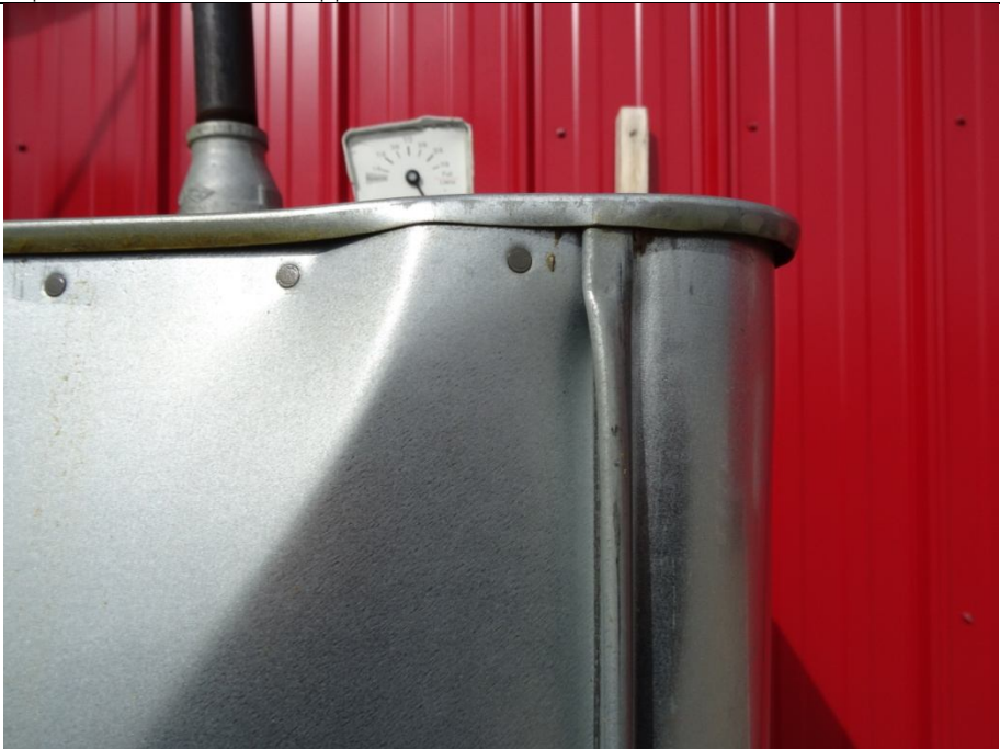
Figure 5 Fuel tank note buckled top Note rivets not welds