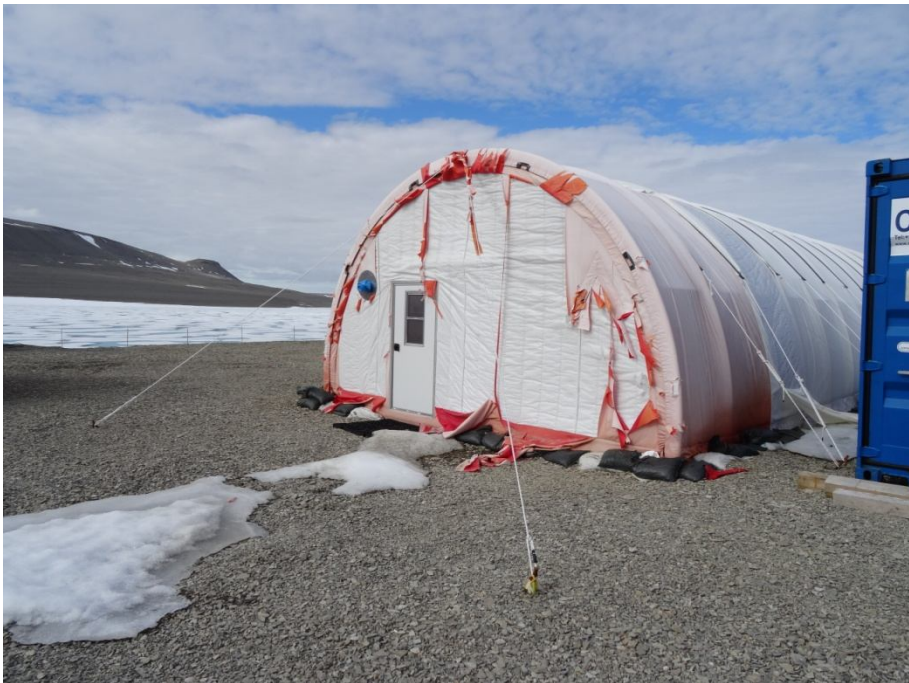
Figure 3 Weather-haven type structure -storage