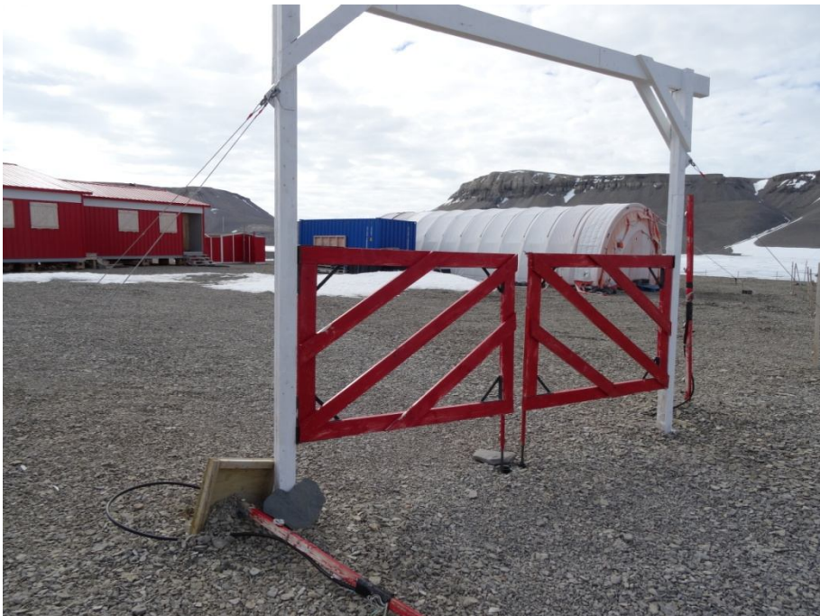
Figure 1Main gate at facility