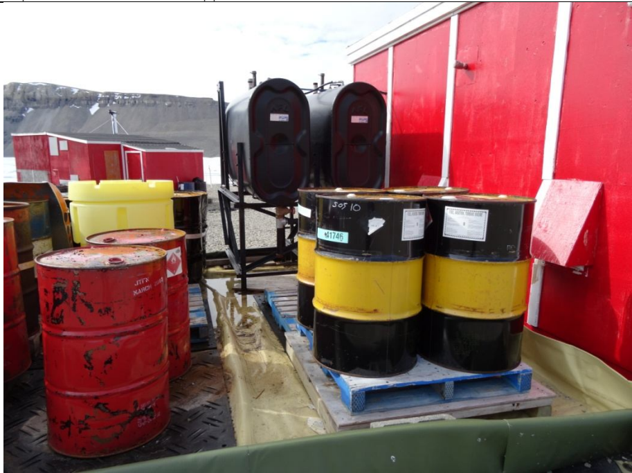
Figure 8 Fuel storage in secondary containment