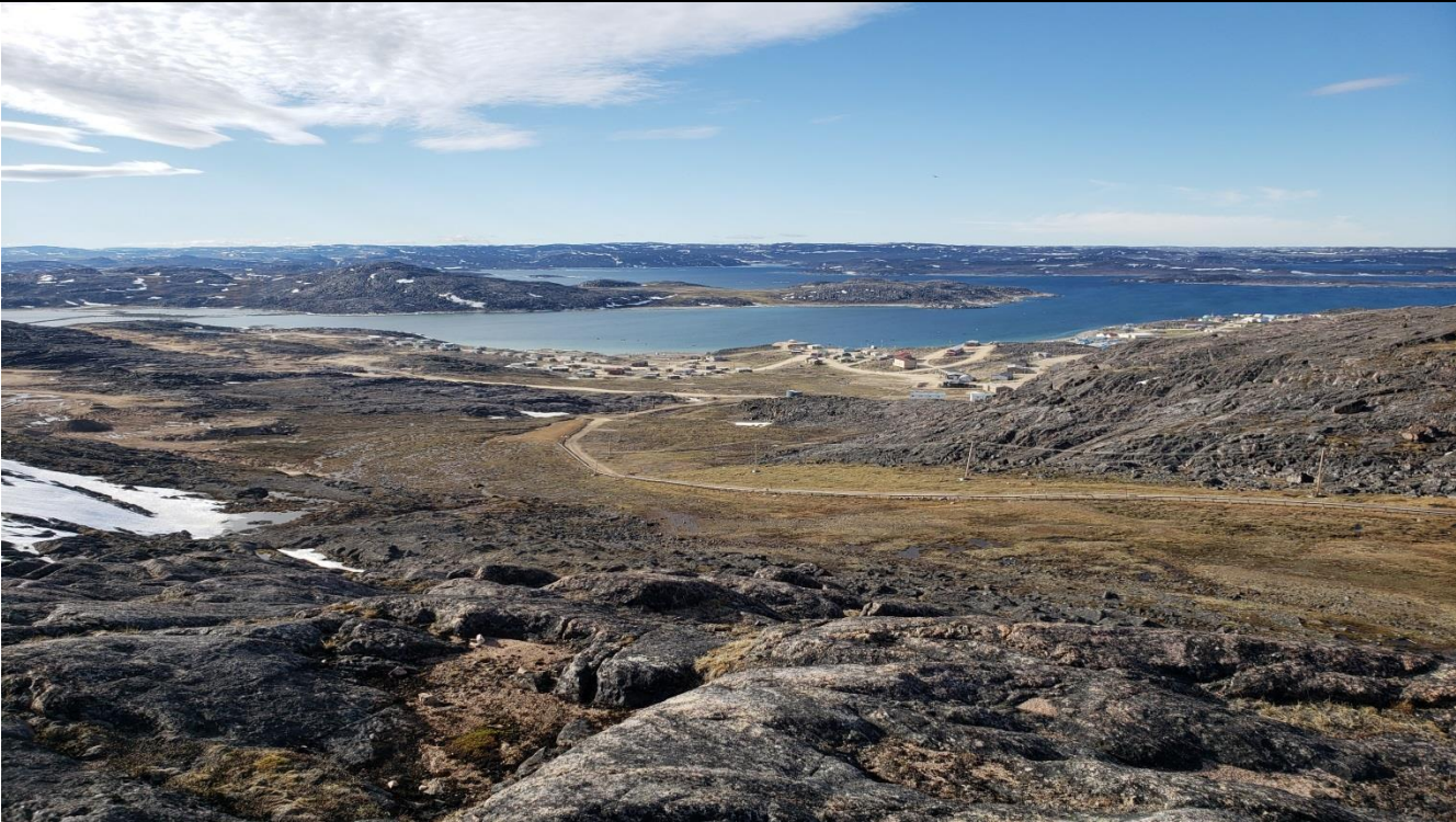
Description: Pipe Line from water source to water treatment plant. No concerns