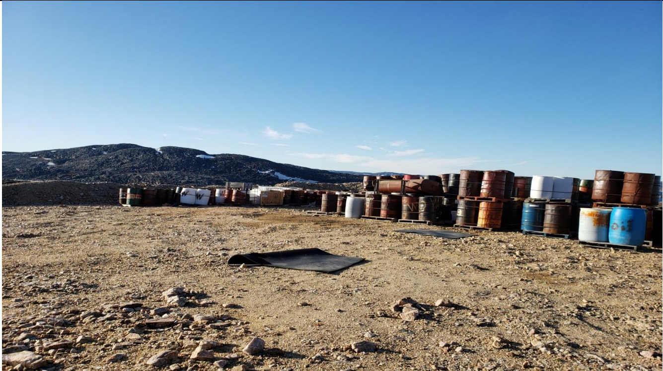
Description: 3 walled, non-engineered berm for storage of drums of hazardous waste.