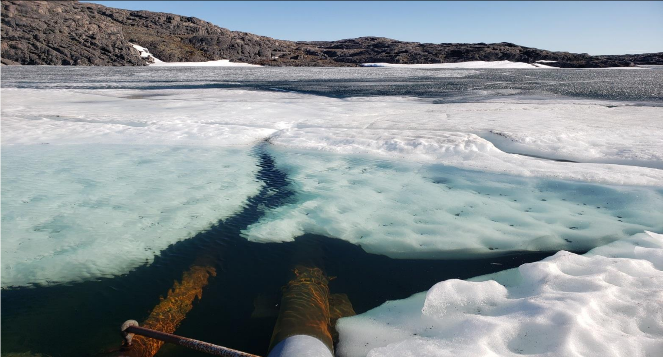
Description: Tee Lake: 2x water withdrawal pipes