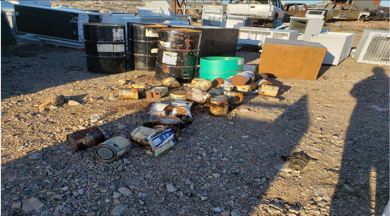
Description: old paint cans litter the the ground of the solid waste facility