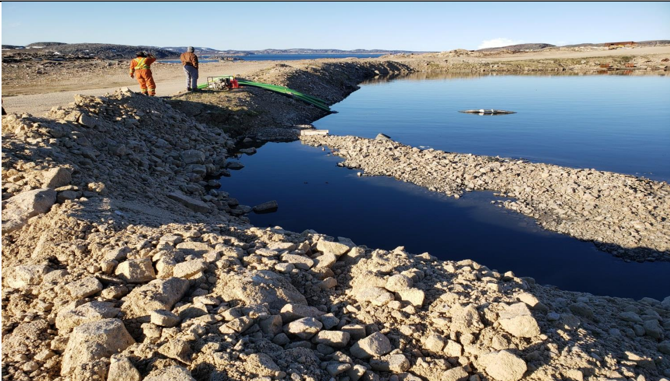
Description: Walls of the emergency sewage lagoon was repaired, and 1 metre freeboard is maintained.