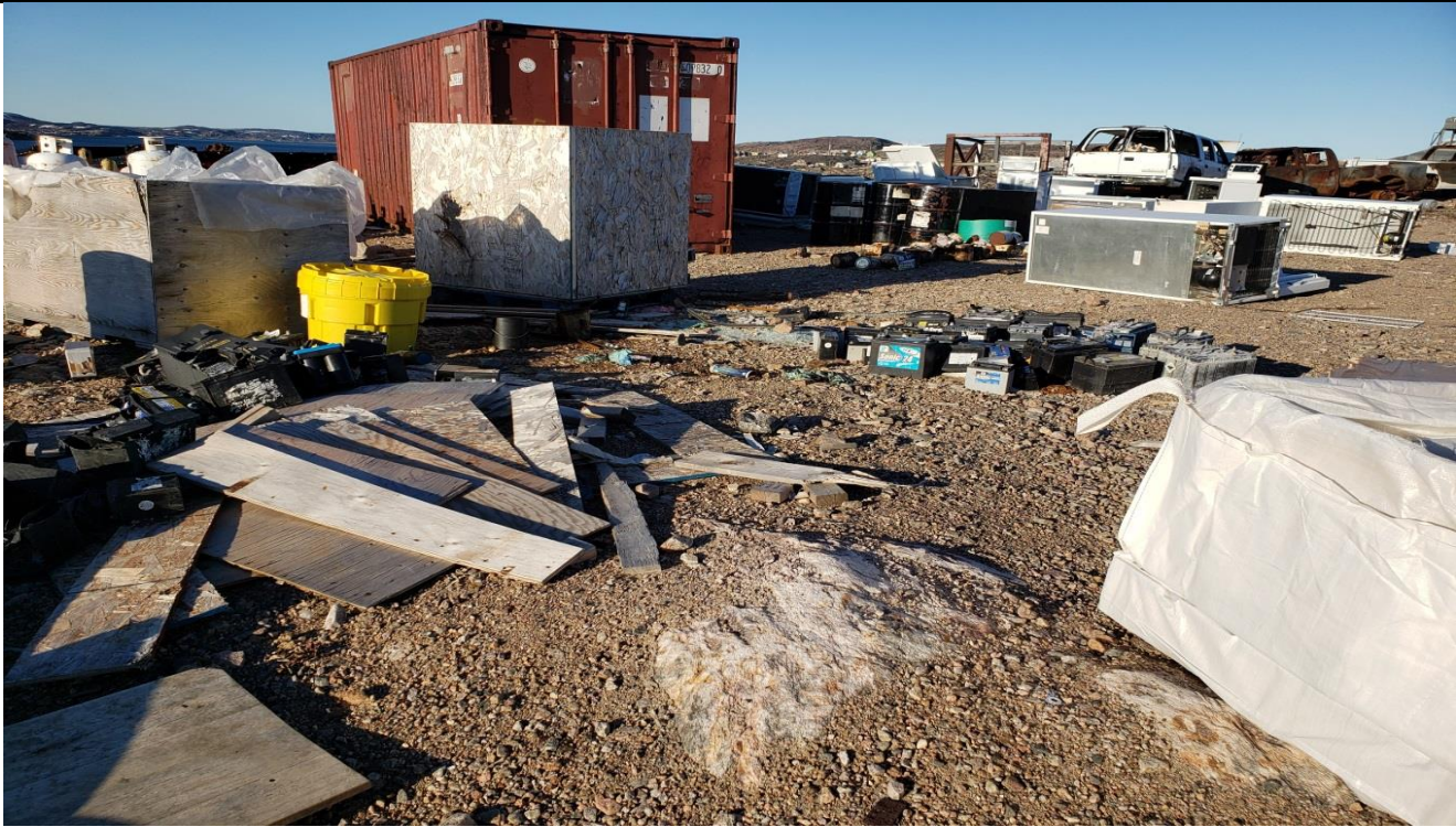
Description: some hazardous waste stored outside, exposed the outside elements. Batteries exposed to the outside elements