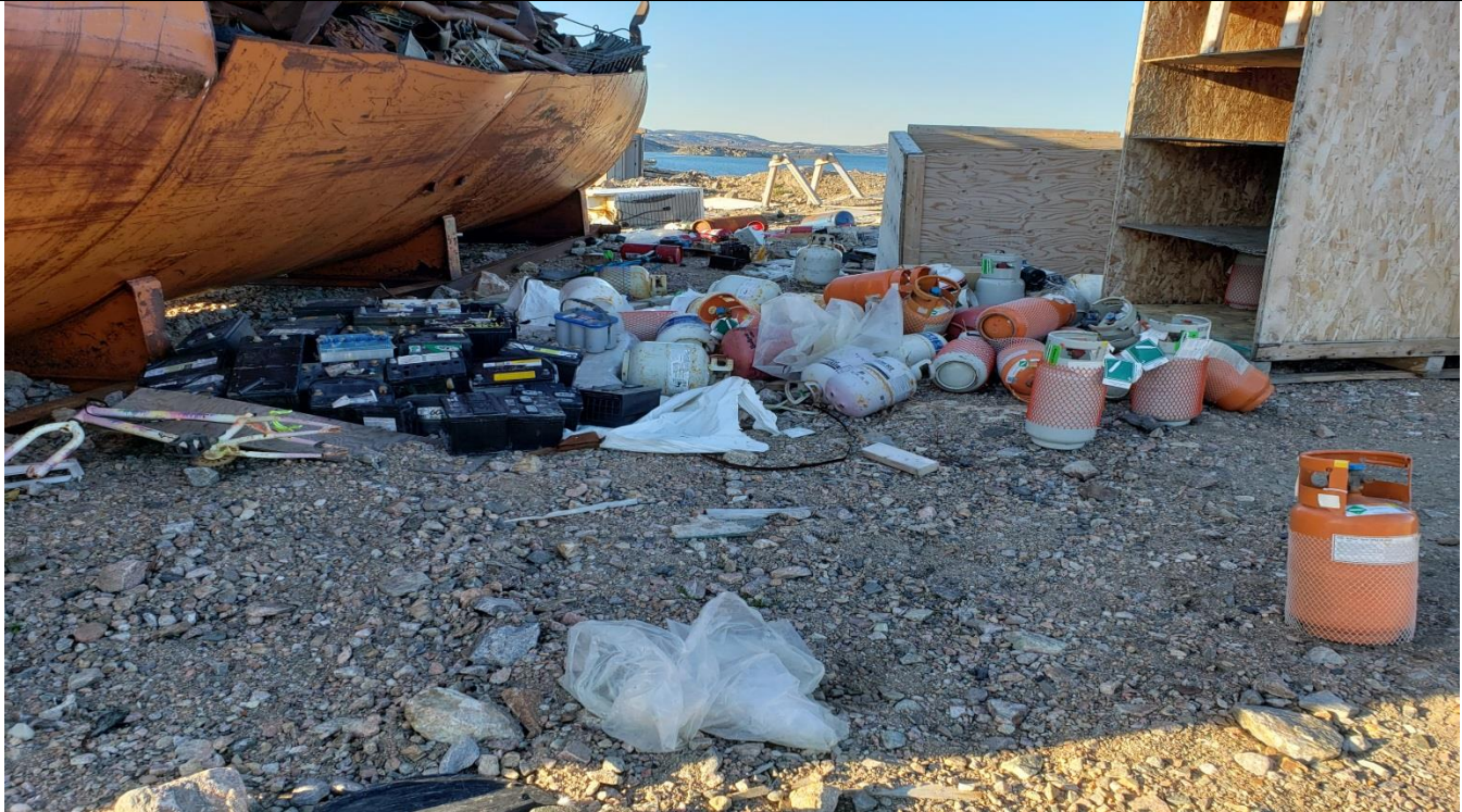
Description: Hazardous waste batteries exposed to the outside elements