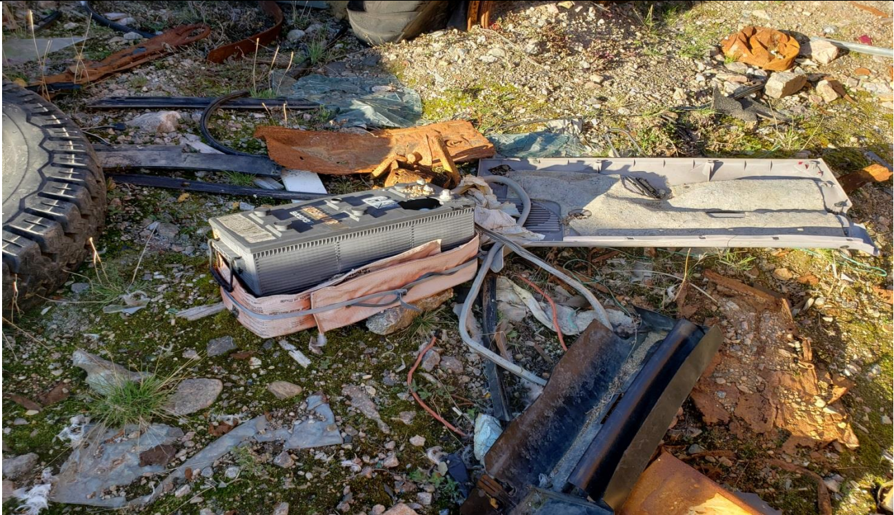
Description: A battery found in the solid waste facility.