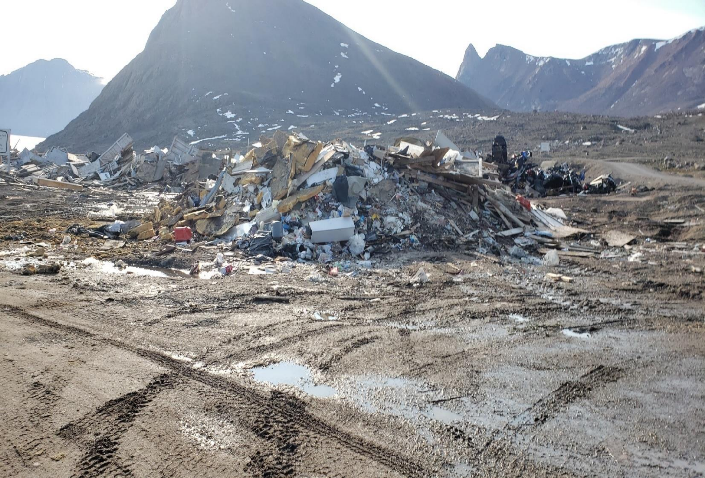
Description: Pile of waste. Bulk woods, mixed with Styrofoam, bulk metals, petroleum carrying jerry cans, and domestic waste. Surface water observed.