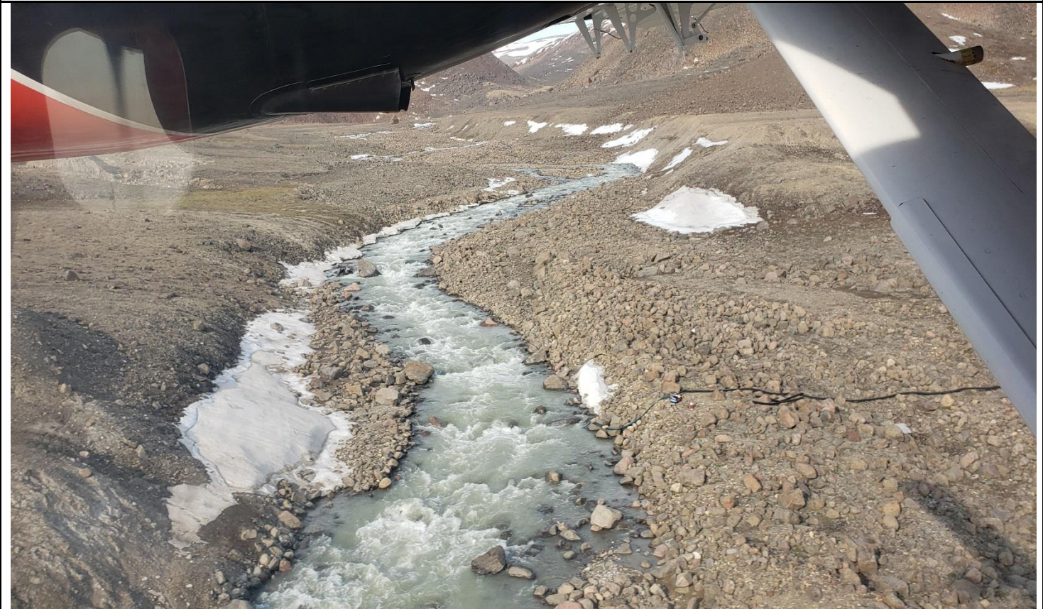
Description: Secondary Water Withdrawal from Airport River. Water pumps and hoses observed in place. Hose goes from Water pump to Water Reservoir.