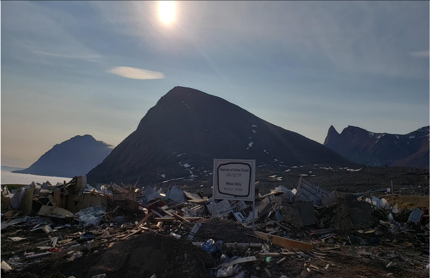
Description: Bulk woods section of the solid waste facility