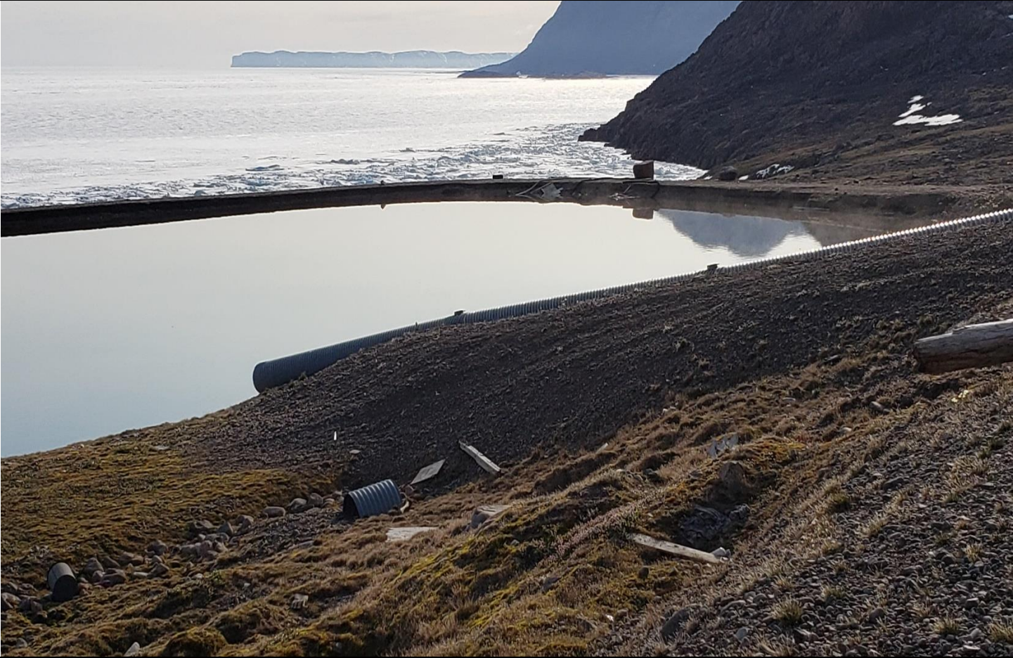
Description: bulk metal within the sewage lagoon