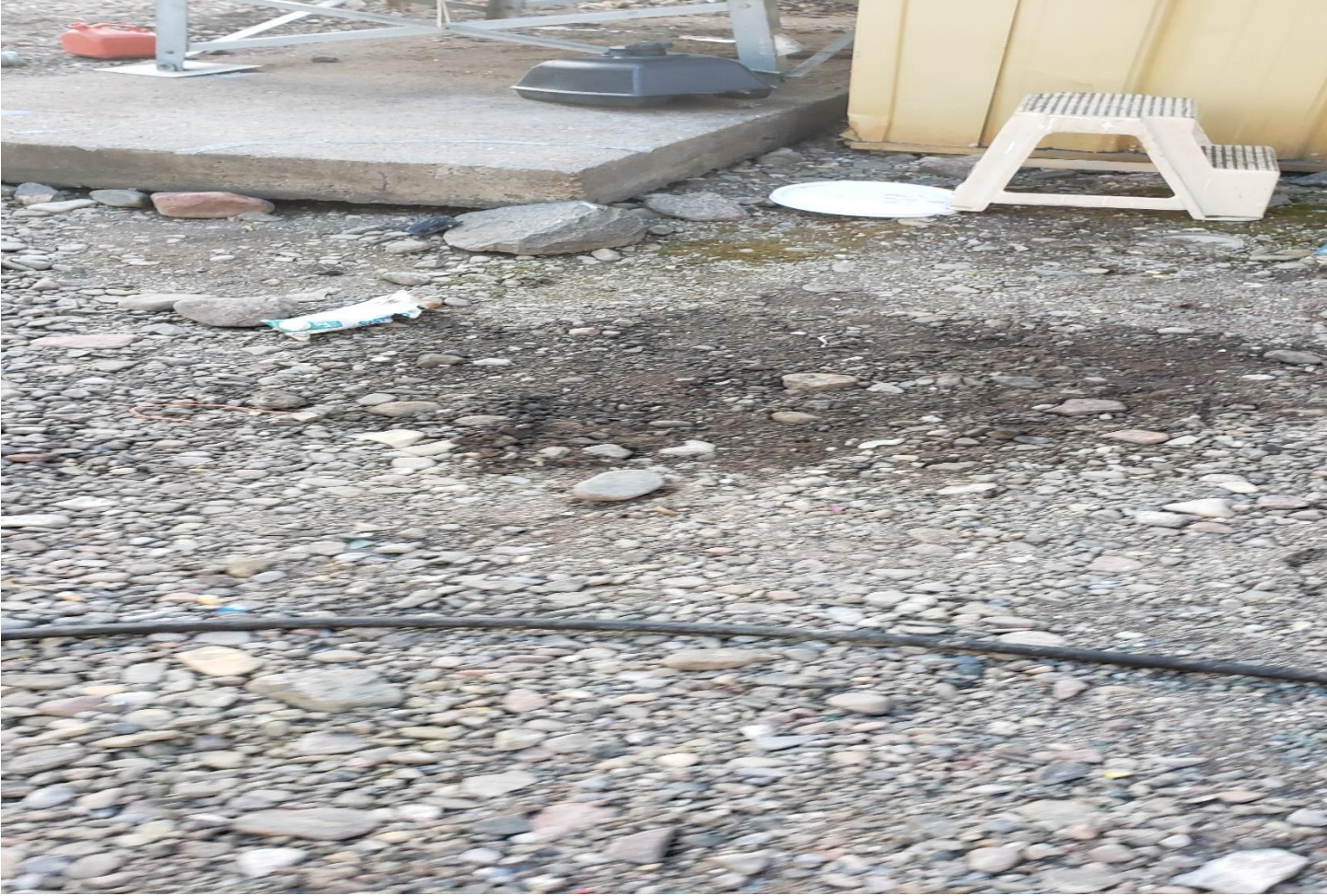
Description: spill observed behind building adjacent to storage tank construction.