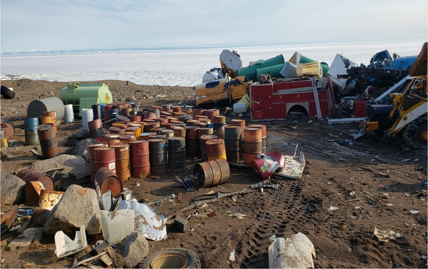
Description: Bulk Metal waste. Waste drums not in secondary containment.