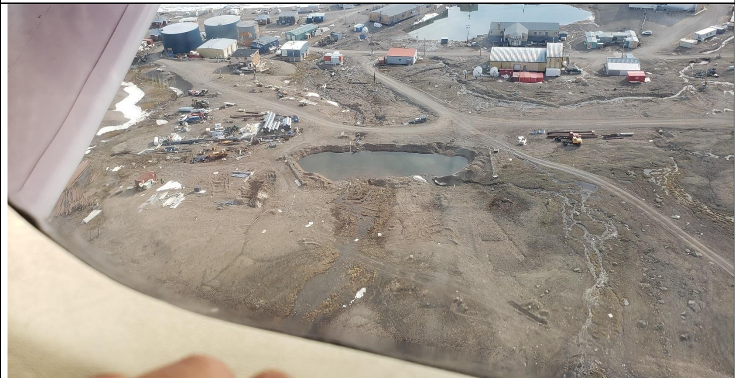
Description: Water Source, Non-Engineered water reservoir. Water Treatment Plant, and Water Storage Tanks top left of photo.