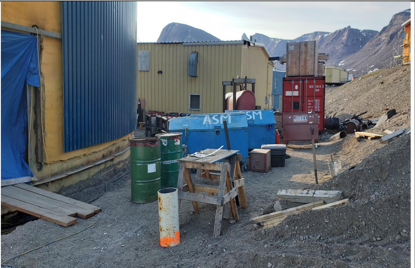
Description: Outside the Storage Tank, Storage Tank under repairs.