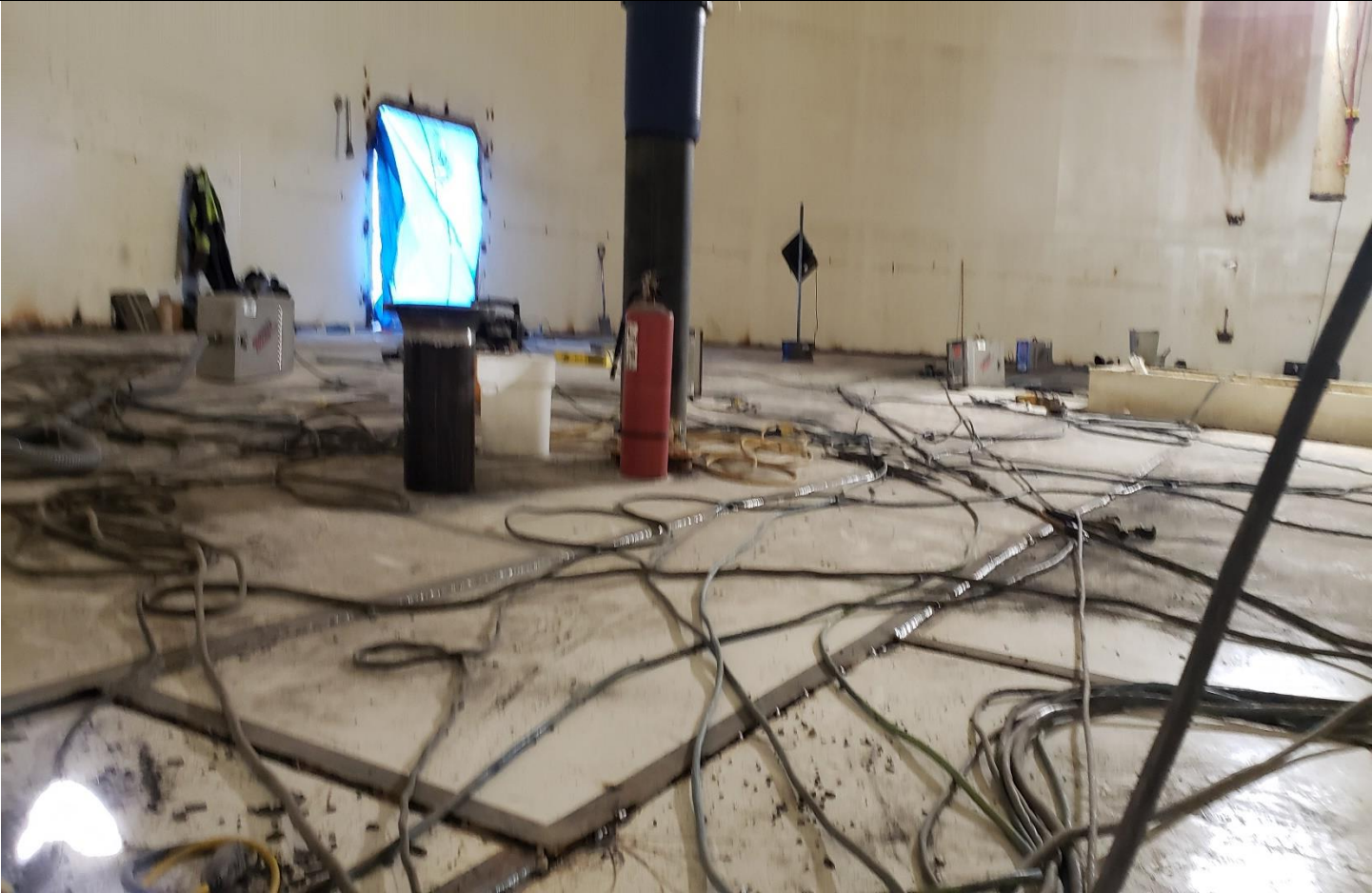
Description: Inside the Water Storage Tank. Storage Tank under repairs.