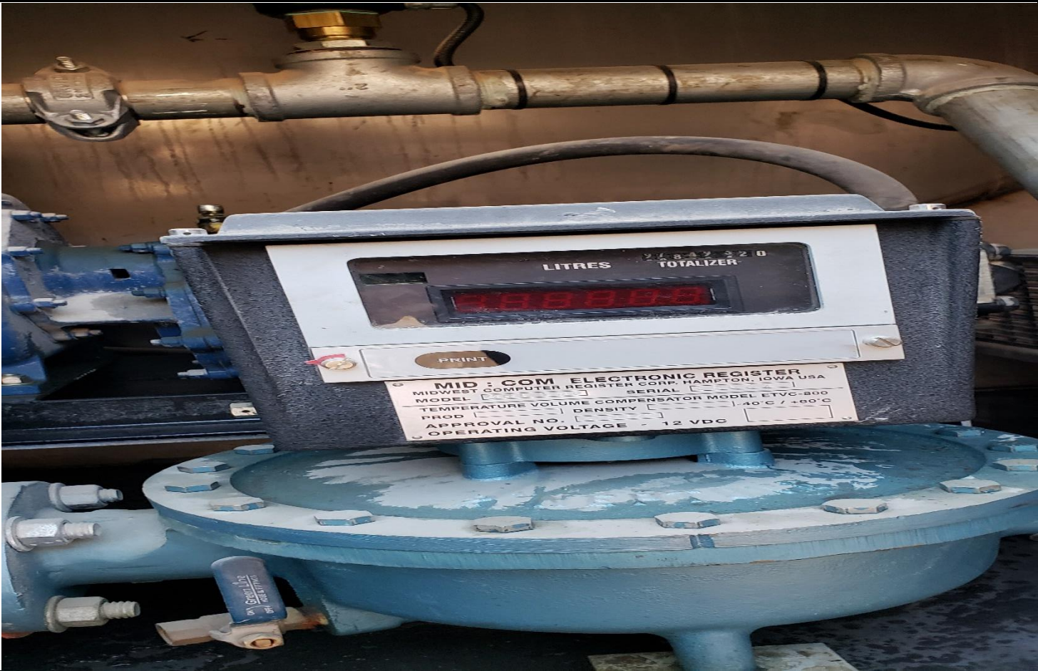
Description: Water Meter on the Water Delivery Truck.. Totalizer reads