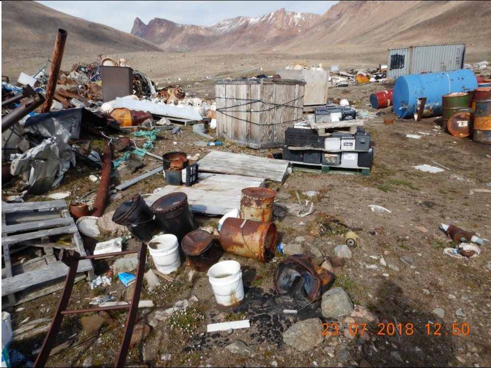
Description: Hazardous Waste Batteries exposed to the elements within the Solid Waste Facility