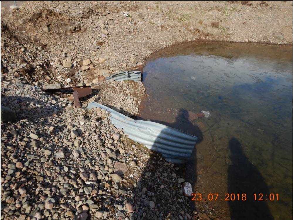
Description: Intake Pipe within water reservoir with fish mesh screen