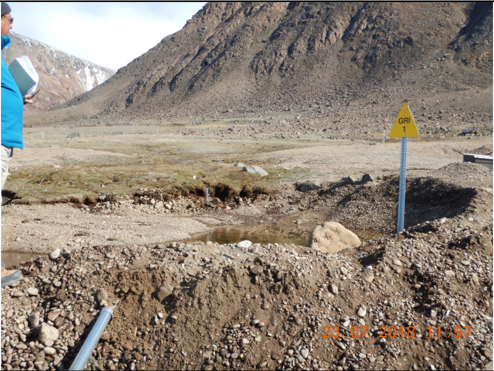
Description: Yellow Triangle Sign titled GRI 1 monitoring station – Water runs down the mountain in the background, and fills up ditch.