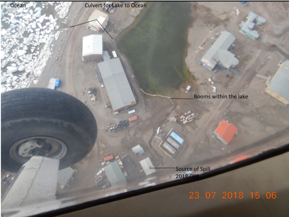
Description: Aerial Photograph of the spill site for Spill Report 2018-088