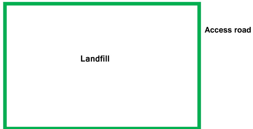
Fig-1: Grise Fiord Water Licensed facilities