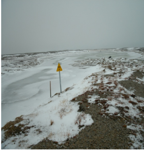
Monitoring station #2 Summer time, it will posted at dump site.