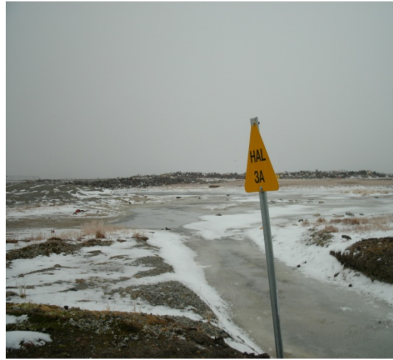
considering this represents #4. Wrongly written 3A. It can be corrected this summer.