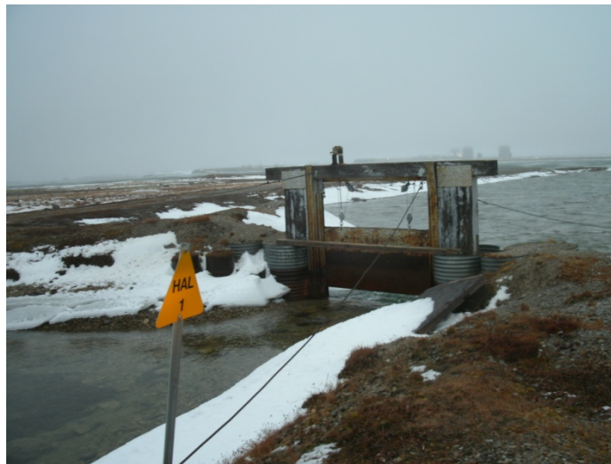
Monitoring #1 ( this is not required here)

Sewage truck does not carry any flow recorder. Therefore (HALL-3 for #1 and 2) is estimated equal to HALL-1.