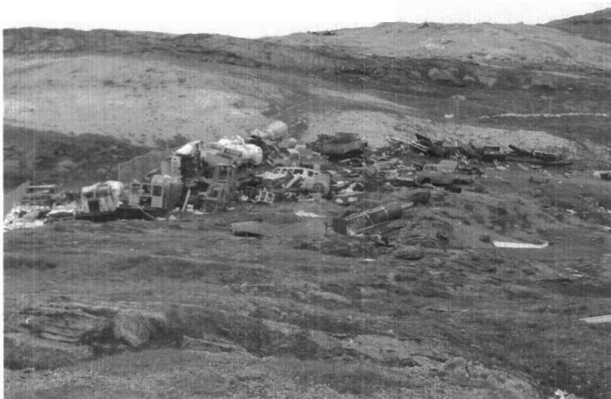
Photo 10. Metal dump area at Solid Waste Disposal Facility.