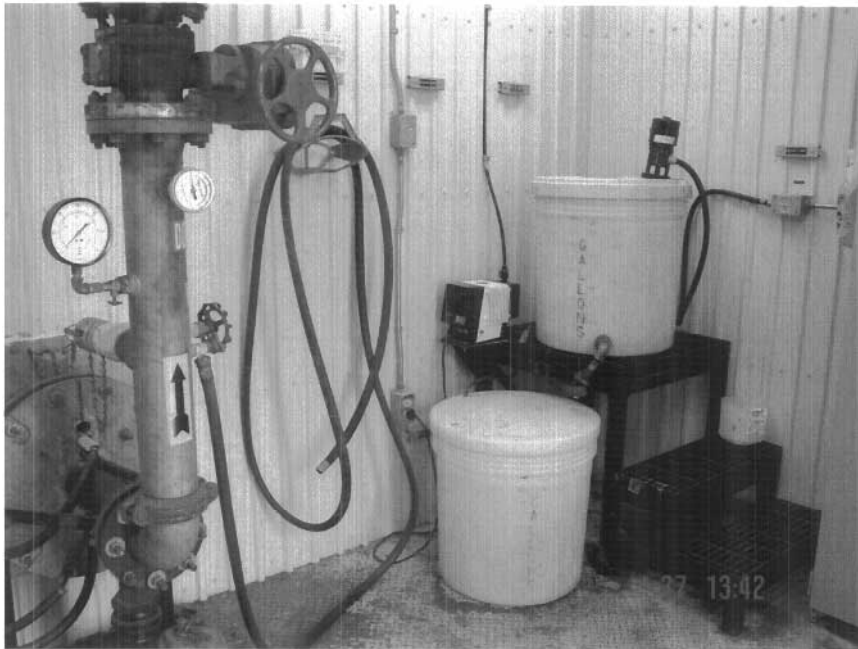
Photo 3. Chlorination system at Water Intake Facility.