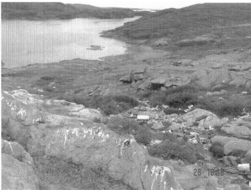
Photo 15. Path of sewage flow to ocean.