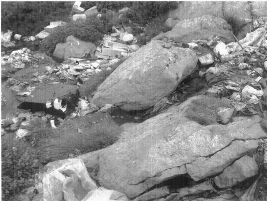
Photo 14. Sewage discharge path, a large amount of garbage is transported by sewage flow, sewage effluent sample N 62.5026.5 W 69.5228.0.