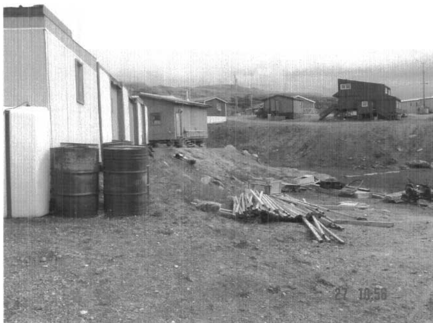
Photo 22. Waste oil at Kimmirut Housing Corporation, stored to close to water at back of building.