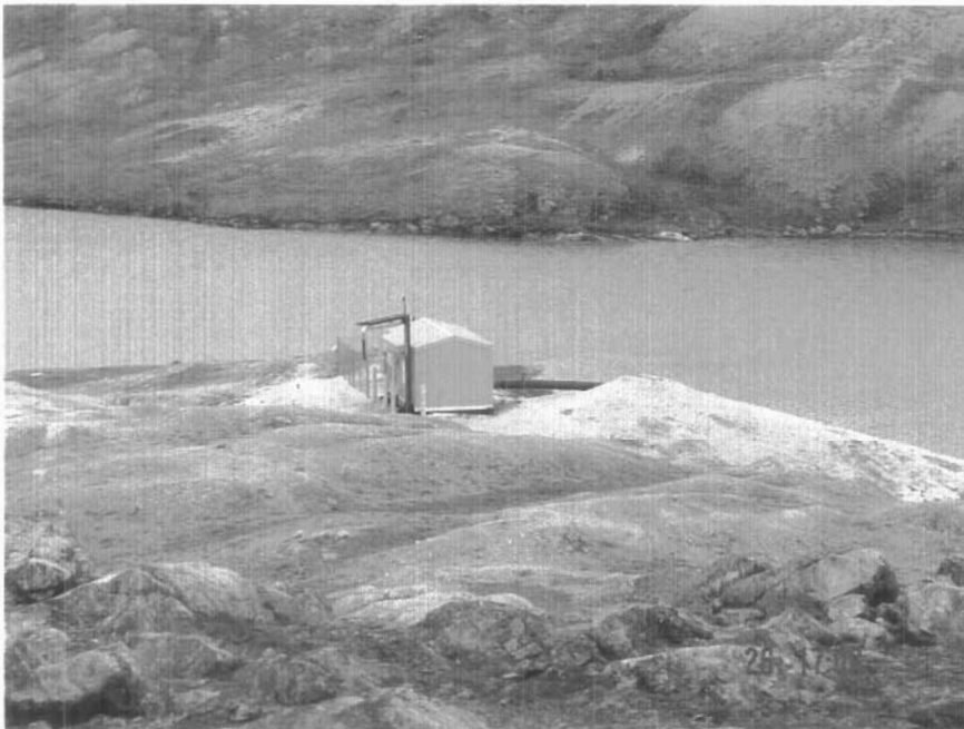
Photo 2. Fundo Lake Water Intake Facility.