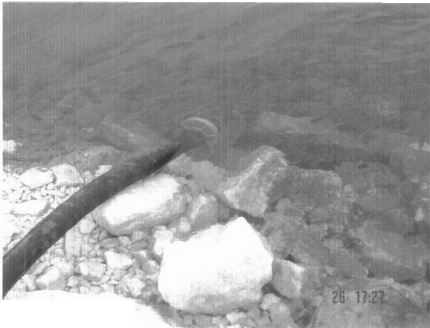
Photo 7. Auxiliary truck fill station intake pipe.