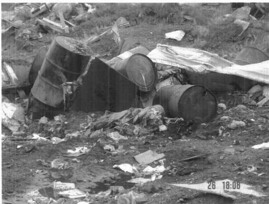
Photo 16. Contaminated soil observed at waste oil storage area.