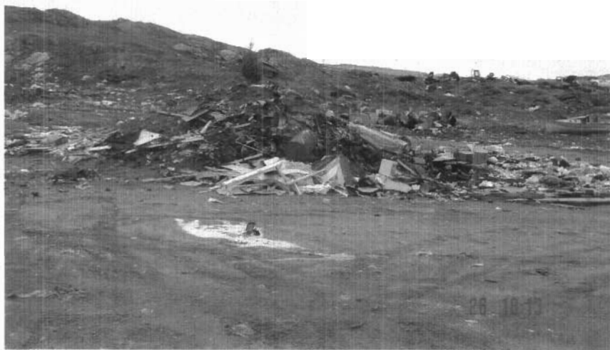
Photo 17. Tipping face at Solid Waste Disposal Facility.