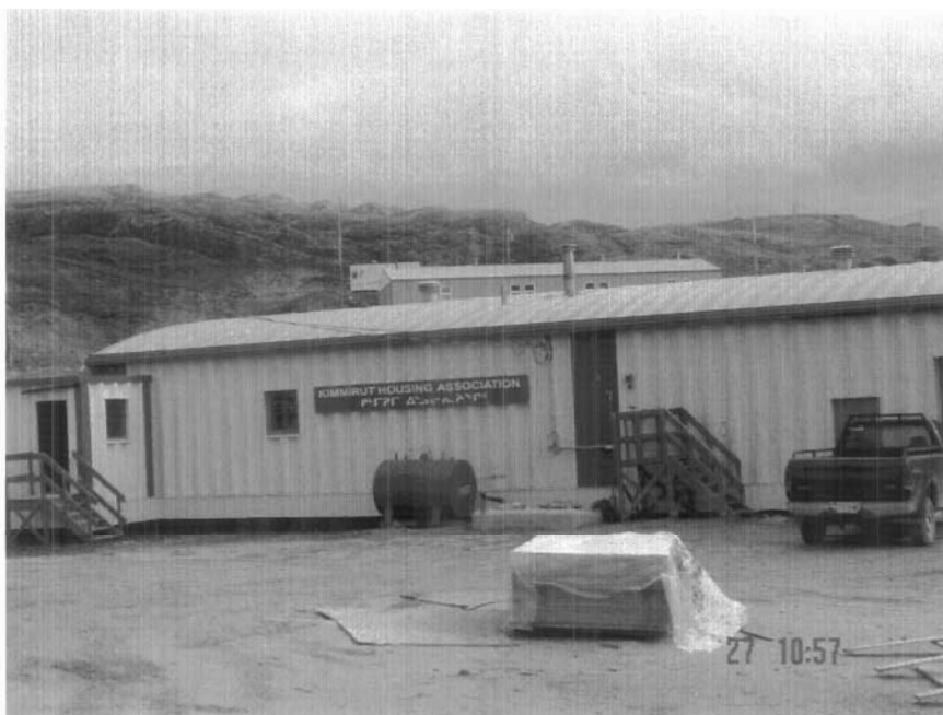
Photo 21. Kimmirut Housing Corporation office in Kimmirut.