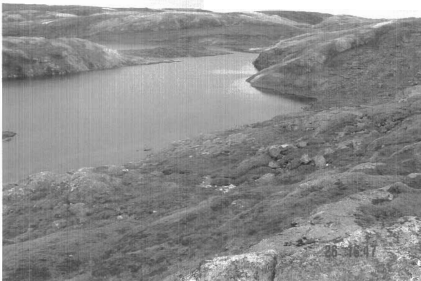
Photo 1. Garbage observed within 100 metres of the Water intake.