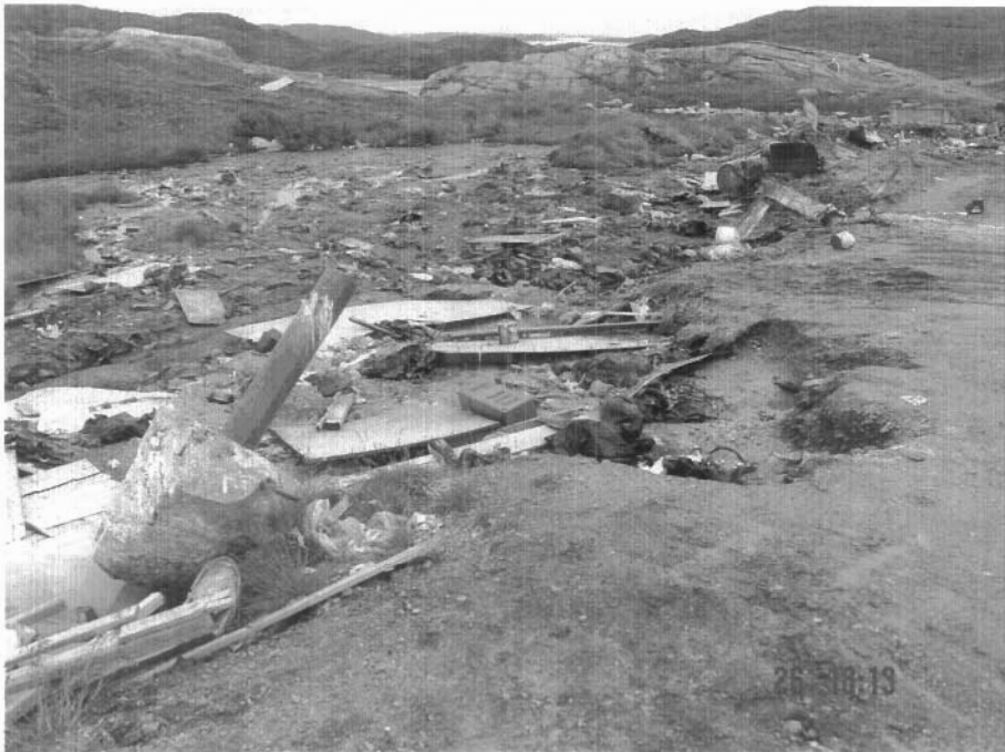
Photo 13. Sewage truck discharge station, old honey bags in photo centre.