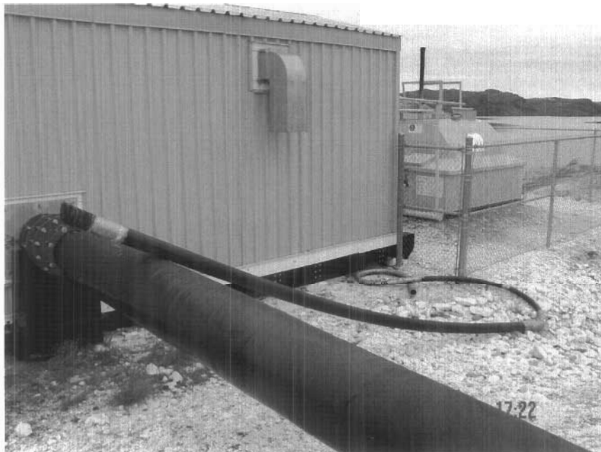
Photo 6. Water Intake Facility intake line and auxiliary intake line at back of Intake Facility.