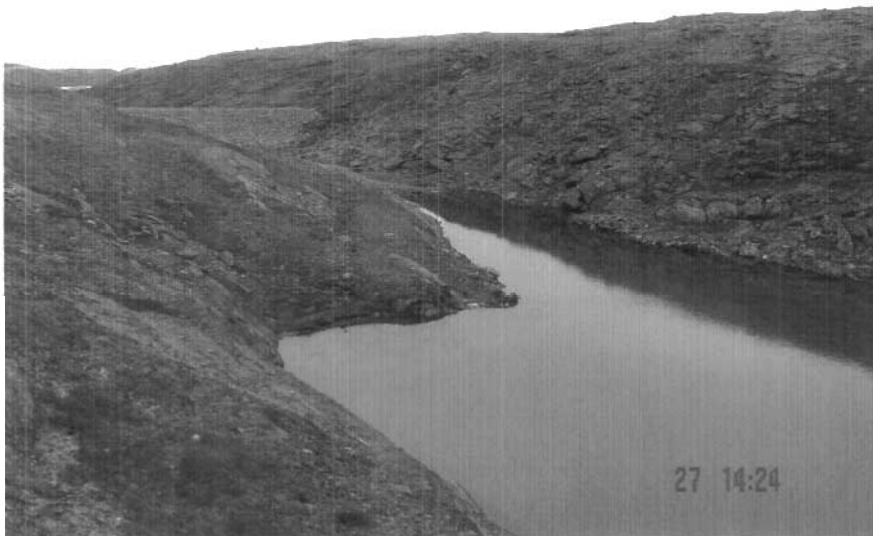
Photo 20. New Sewage Lagoon, not currently in use, retention berm at photo left.