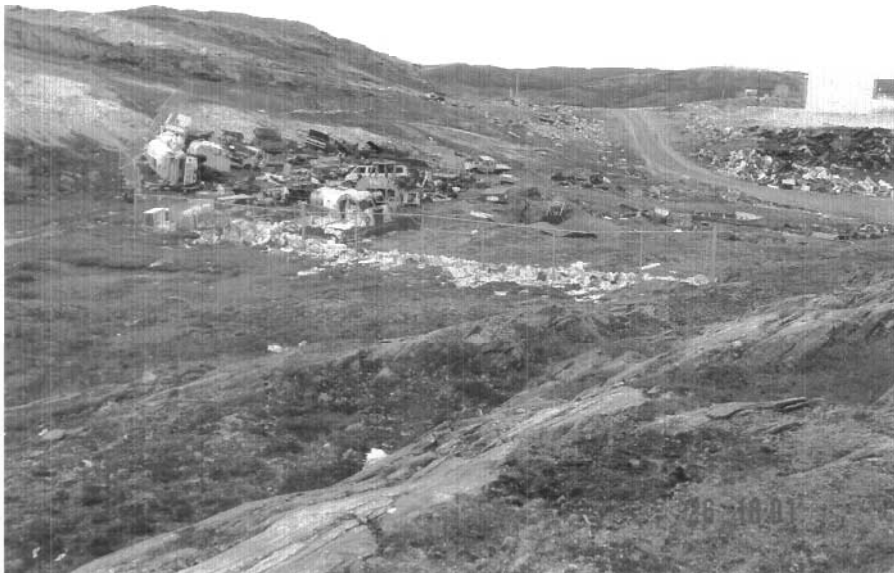
Photo 12. Partial fence at Solid Waste Disposal Facility.