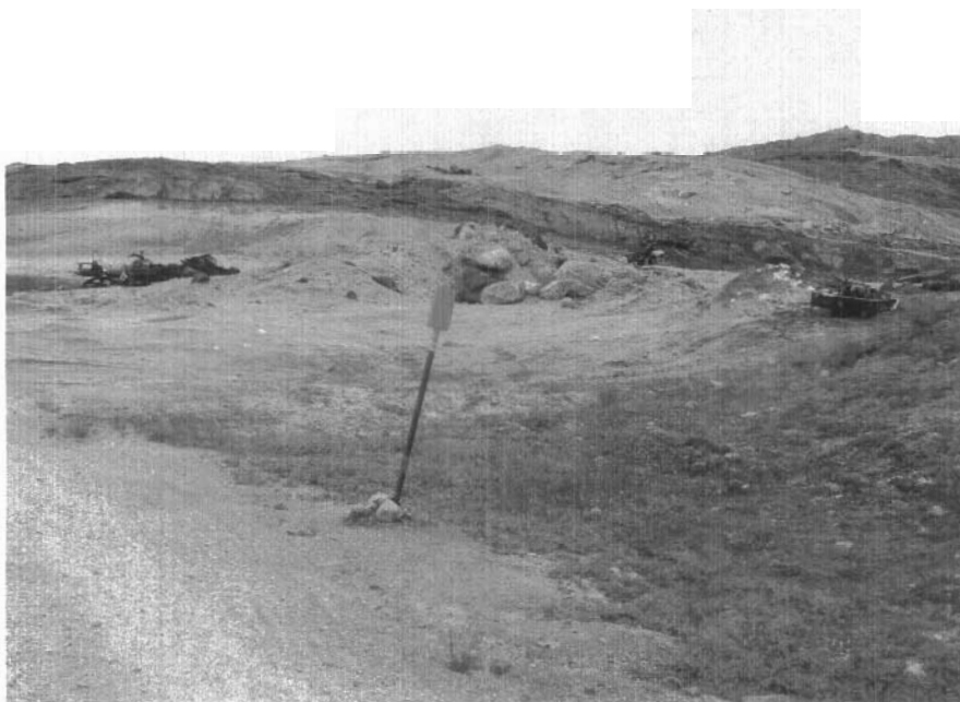
Photo 9. Garbage discarded along road to Water Intake Facility.