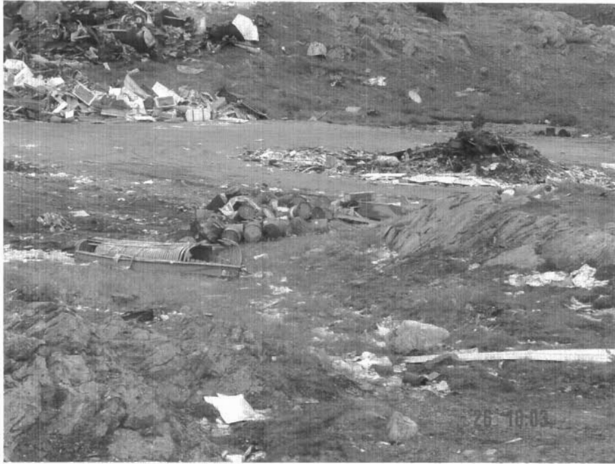
Photo 11. Drums of waste oil improperly stored at dump.