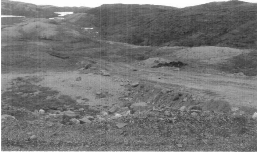
Photo 19. Access road to New Solid Waste Disposal Facility, not currently in use.