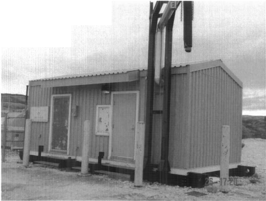
Photo 5. Truck fill station at Water Intake Facility, water sample N 62.5011.4 W 69.5306.5.