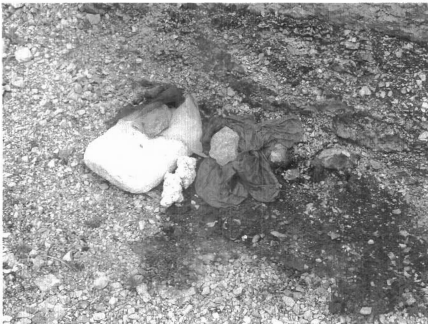
Photo 8. Garbage observed within 5 metres of auxiliary truck fill station.