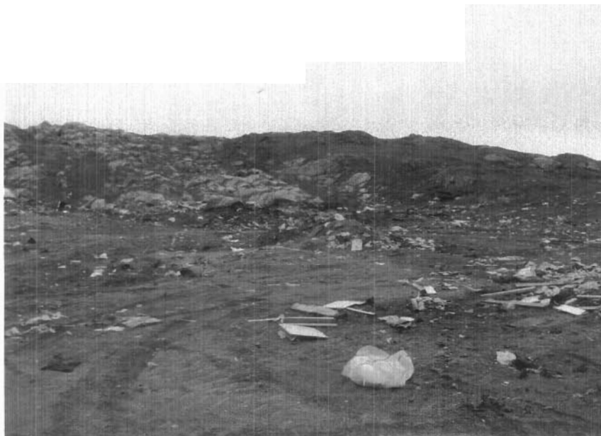
Photo 18. Alternative tipping faces at dump..