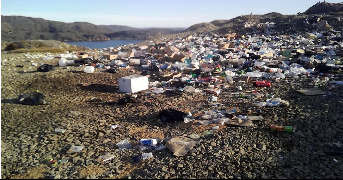
Description: Burn and cap of domestic garbage. No fencing around this section of the solid waste facility. Wind blown garbage blown across site of sewage discharge. Burn Garbage was capped between 2020, and 2021 to help mitigate the windblown debris.