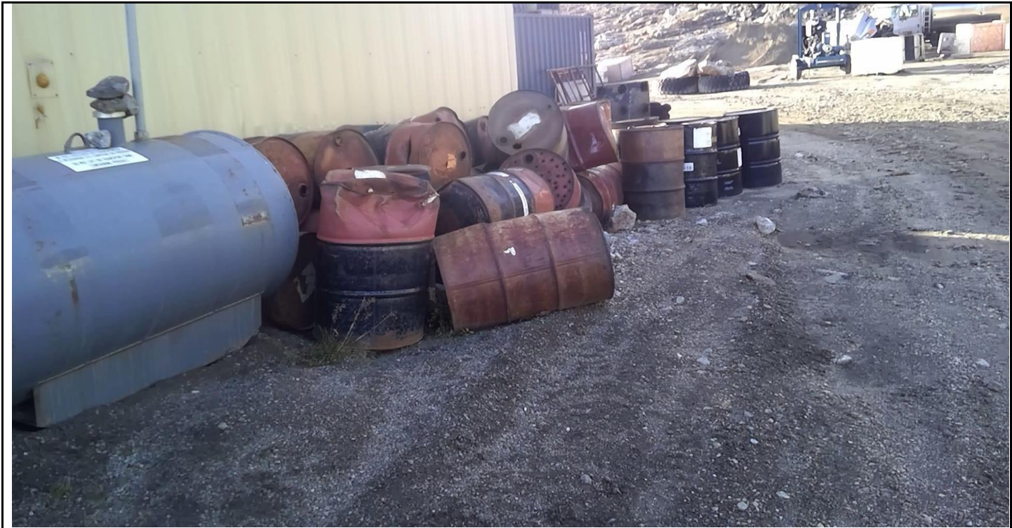
Description: some hazardous waste batteries stored outside, partially exposed the outside elements.