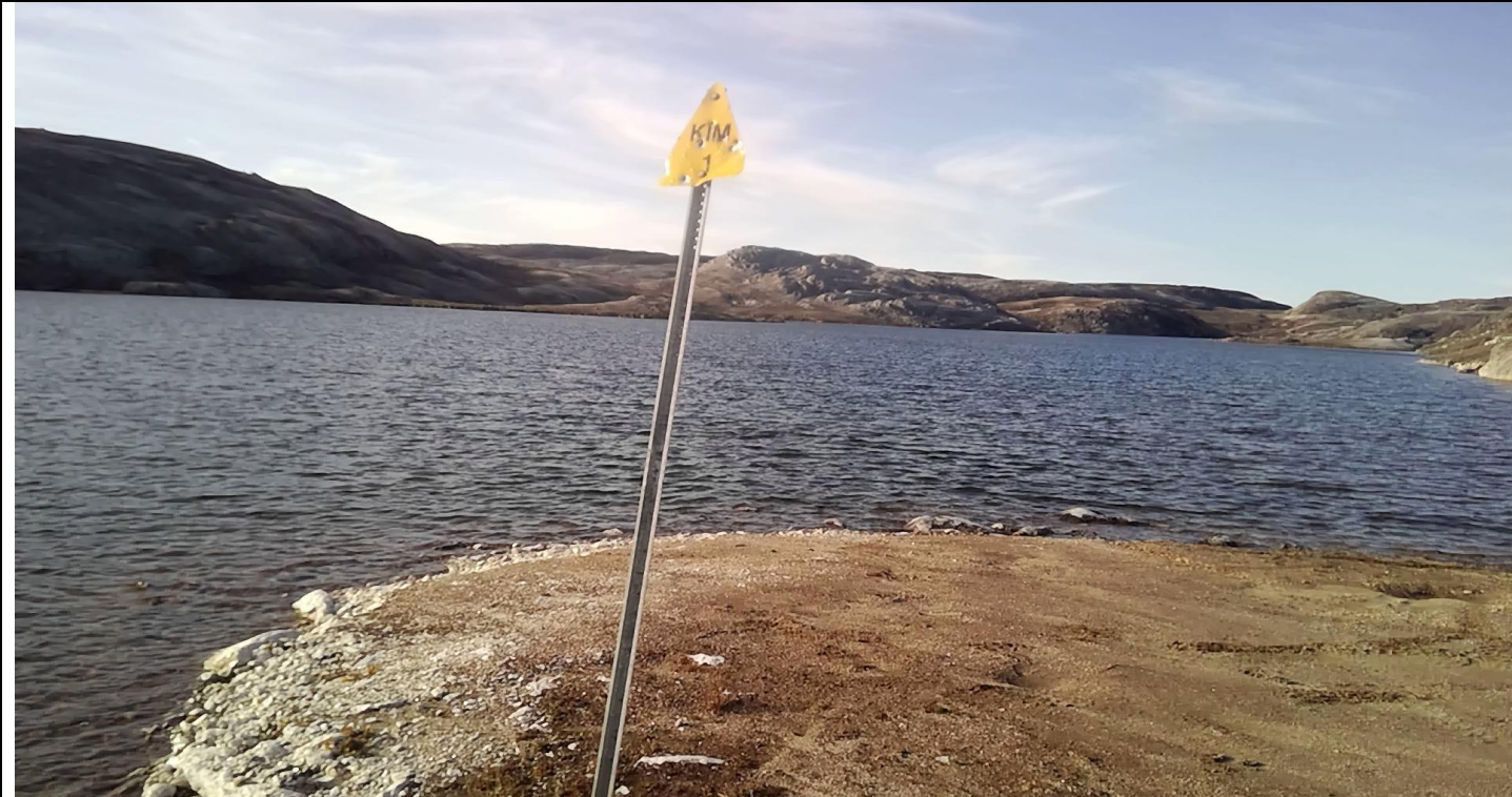
Description: KIM 1 monitoring site at Fundo Lake water source