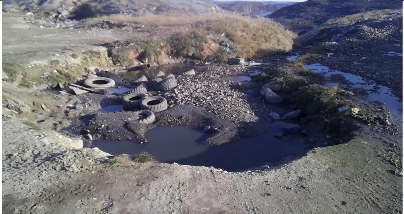
Description: Sewage Discharge Location. Hamlet employees discharge sewage into drainage ditch.