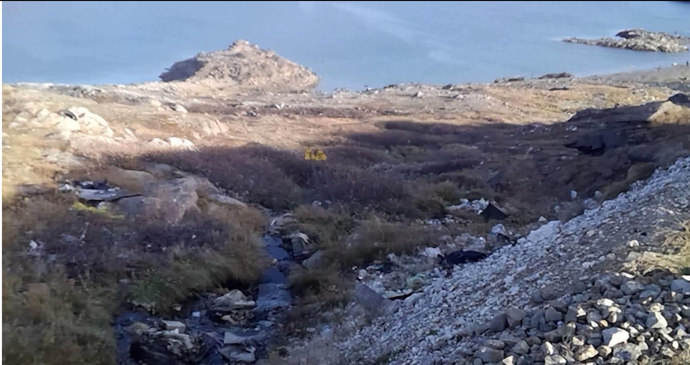
Description: Monitoring Stations “KIM 2 & KIM 3”, wind blown garbage carpet the sewage drainage ditch.