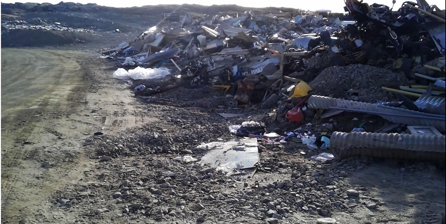
Description: With the exception of domestic burning and capping waste, all other waste such as bulk wood, bulk metal, hazardous waste, and gravel have been deposited into the pile along the road. The trench the direct any leachate from the pile was covered as directed in 2020.