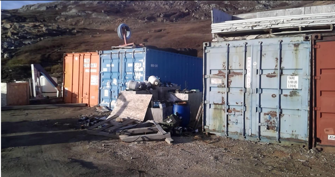
Description: Sea cans filled with Hazardous waste drums of used oil.