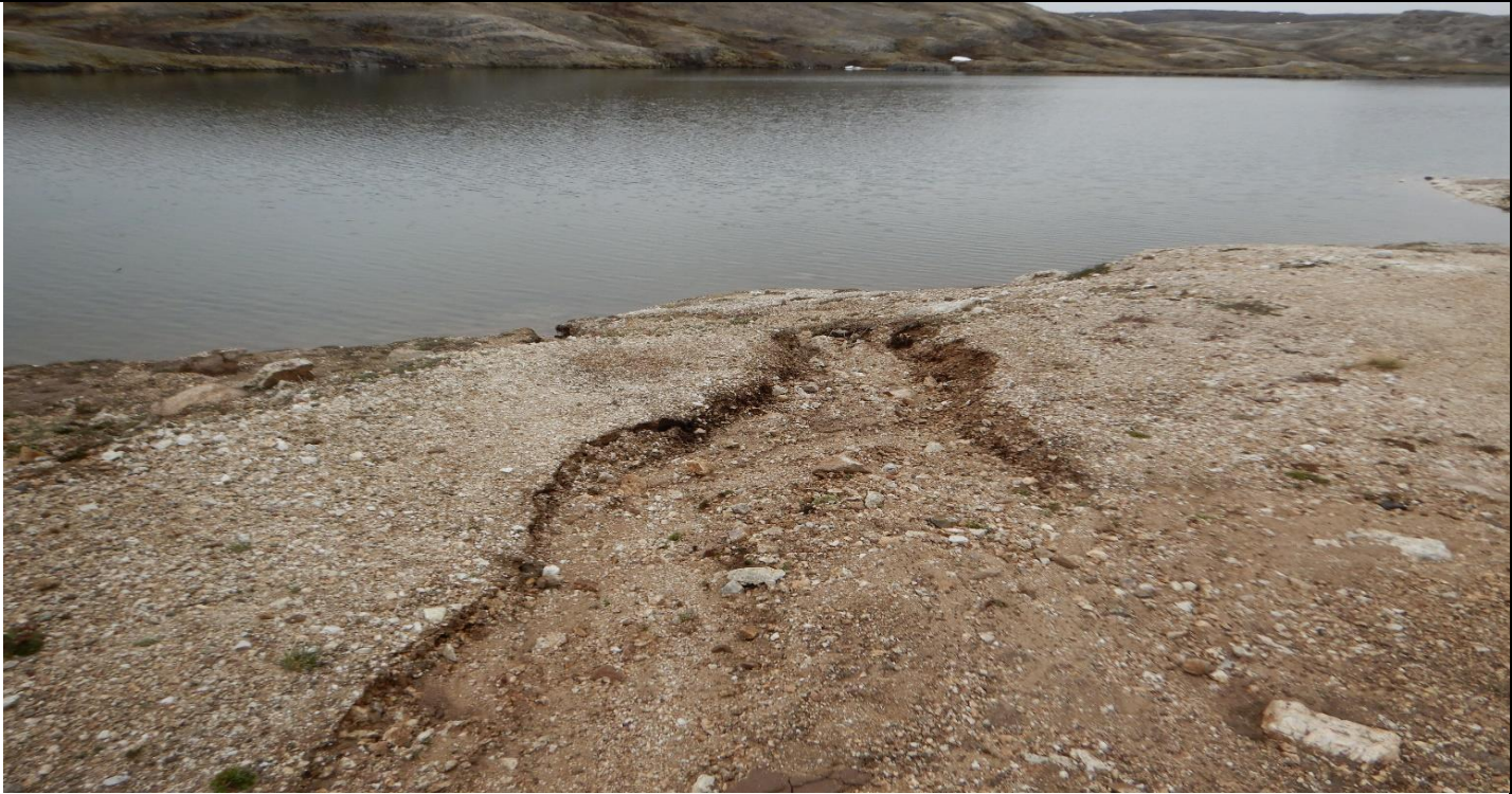
Description: Road appears to be washing out into the water source at Fundo Lake.