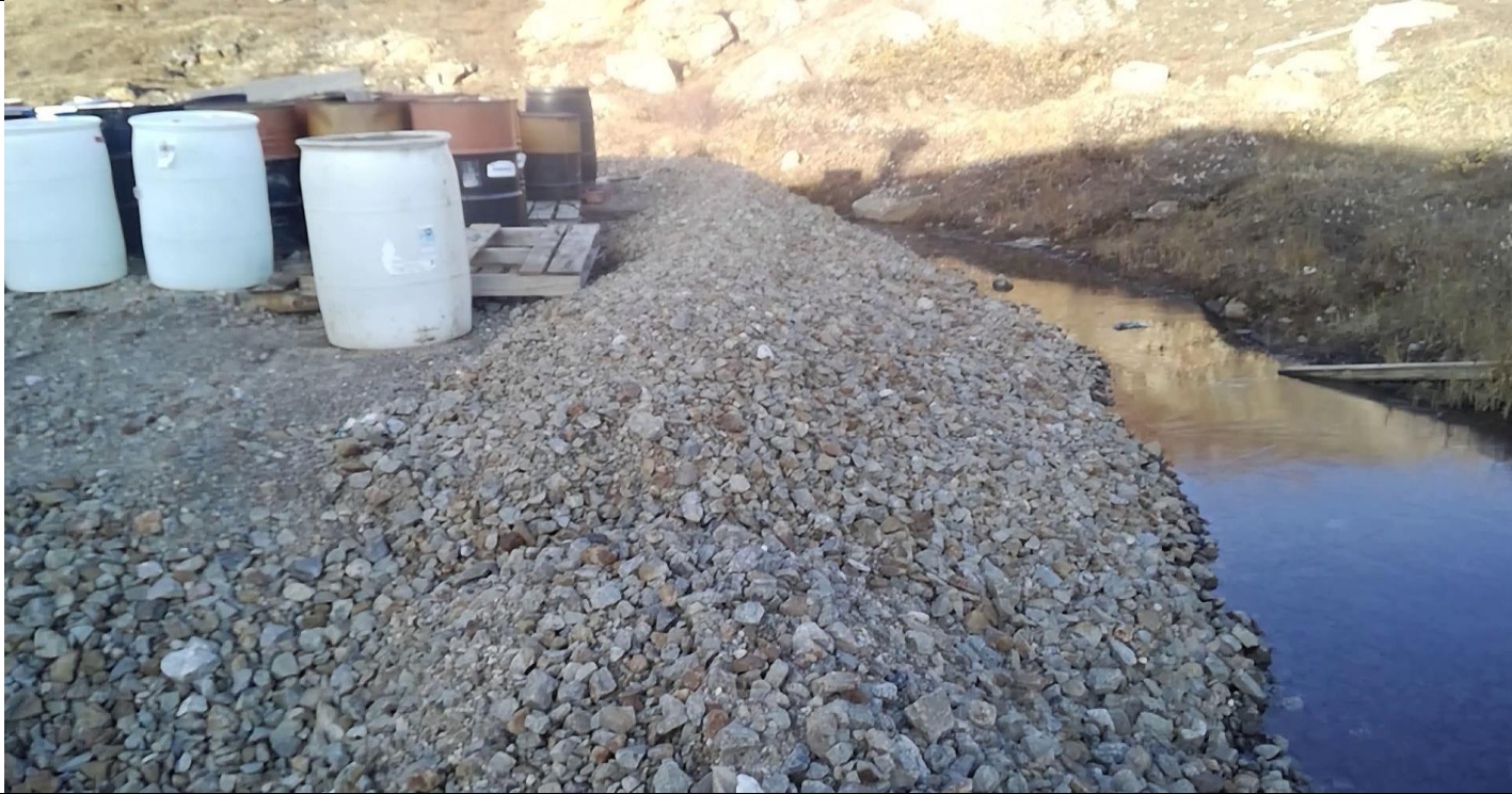
Description: some hazardous waste stored outside, exposed the outside elements. Used to fuel the oil burner in the municipal garage. Wall doesn't appear to be able to contain any liquid wastes