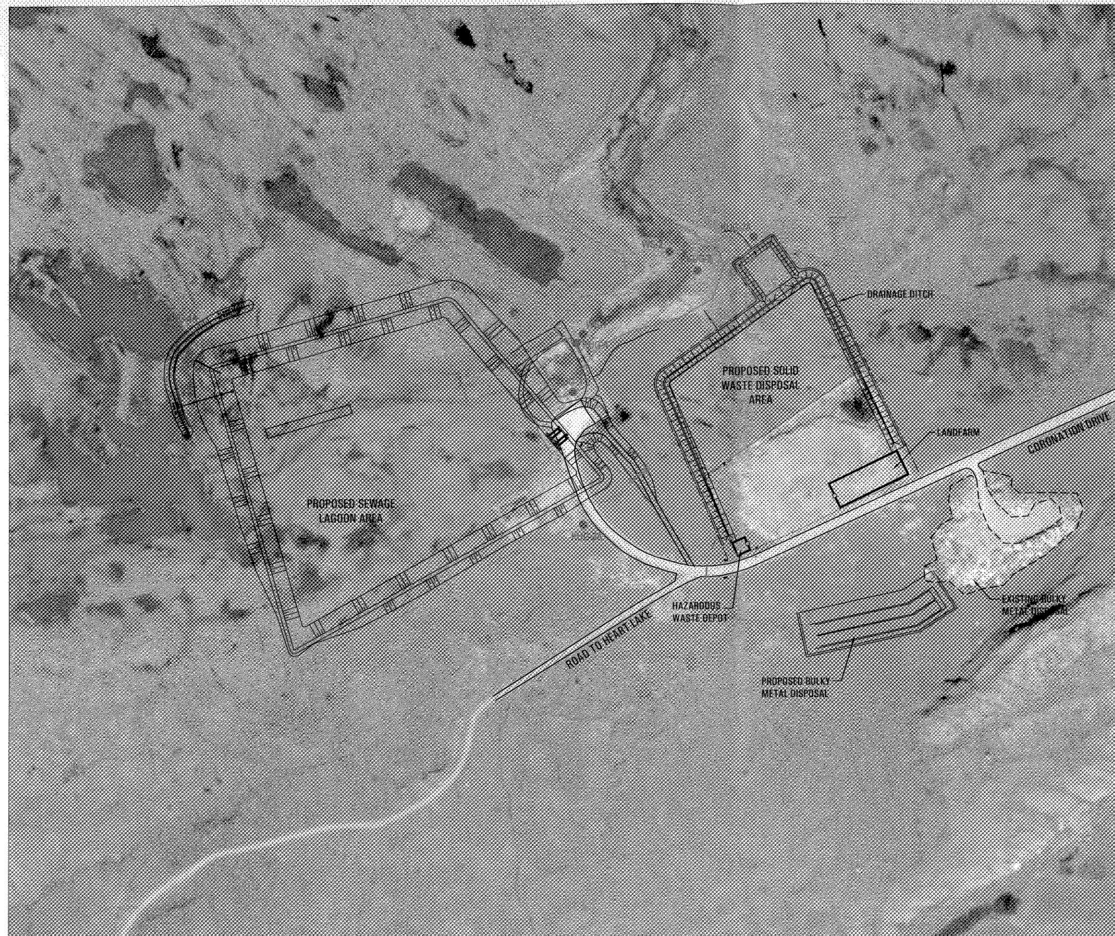
FIGURE 3 HAMLET OF KUGLUKTUK SOLID WASTE MANAGEMENT FACILITY OPERATION & MAINTENANCE (O&M) PLAN - MARCH 2007 REGIONAL VIEW OF SEWAGE LAGOON AND SOLID WASTE DISPOSAL FACILITY (LANDFILL)