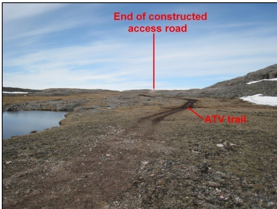
Photo 8 End of constructed access road with existing ATV trail near Km 2.9 of the proposed route; north aspect.