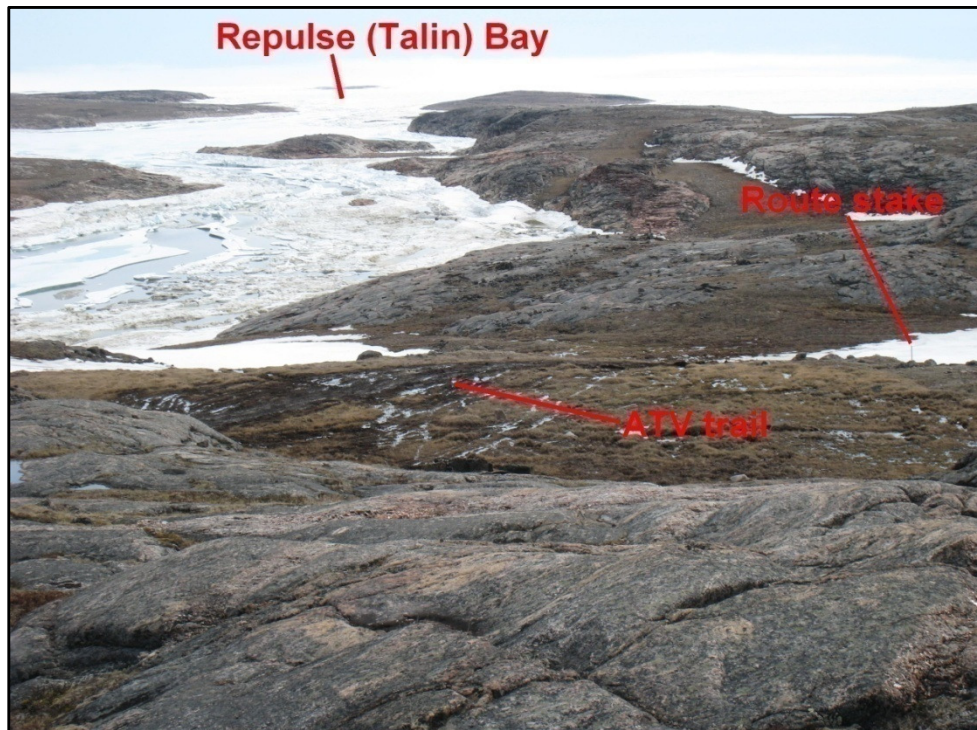
Photo 9 Muddy and rutted ATV trail along proposed access road route, near Km 3.0; southwest aspect.