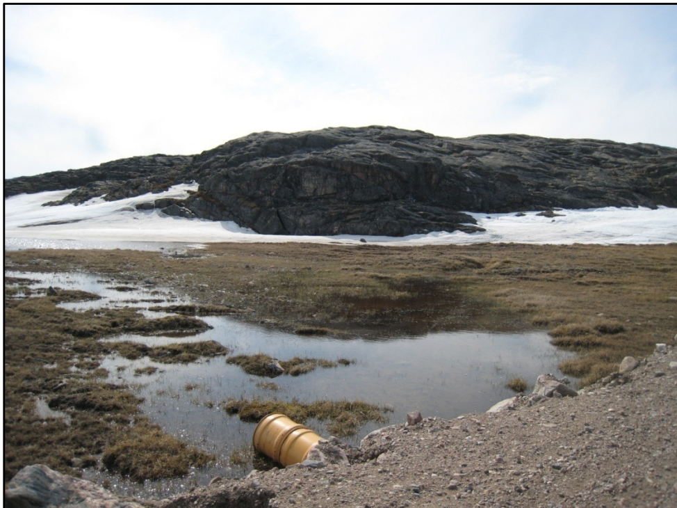
Photo 7 CRS-2 crossing west aspect with installed culvert and upstream pond flow pattern; upstream water body is confirmed fish-bearing pond.