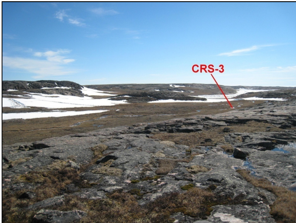
Photo 13 Stream flow pattern upstream of CRS-3 with existing ATV trail and proposed access road route on the left side of the photo; southeast aspect.