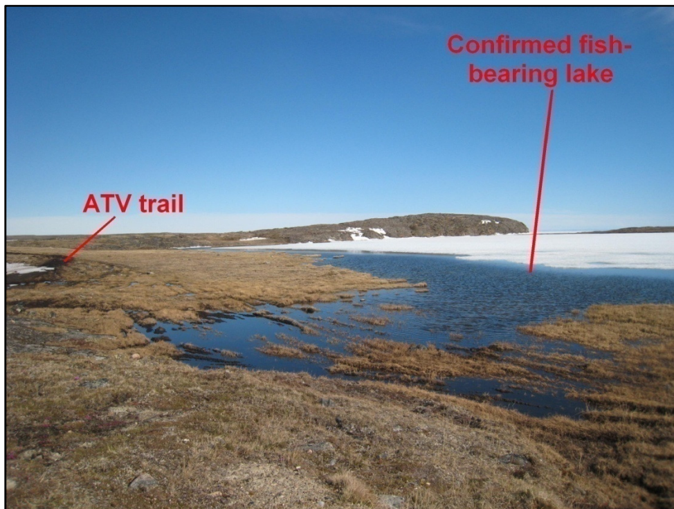
Photo 12 Confirmed fish-bearing lake and existing ATV trail near Km 4.0 of the proposed access road route; southeast aspect.