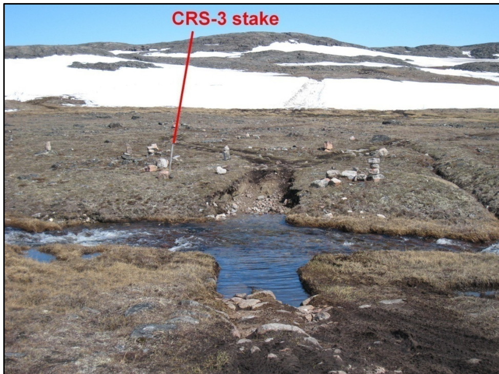
Photo 11 East aspect of impacted stream banks at existing ATV trail stream crossing; site is also CRS-3 crossing of the proposed access road at Km 3.5; note numerous inuksuit present.