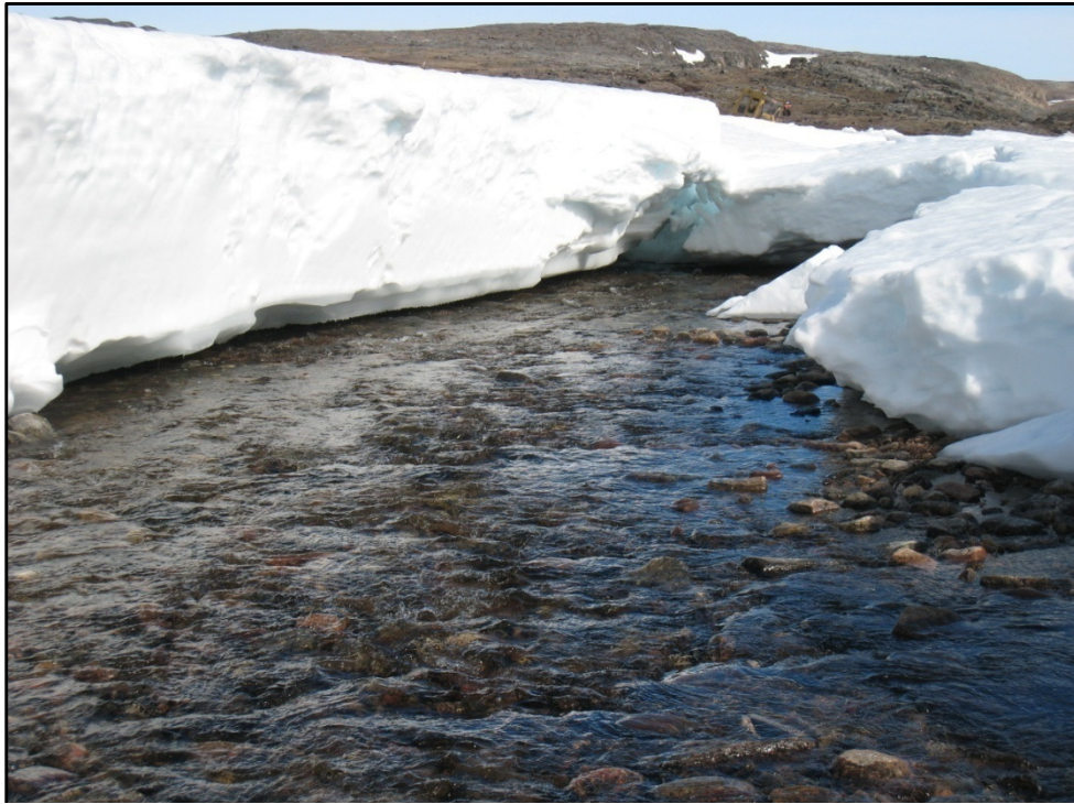
Photo 17 Large snowpack along stream, and stream substrate downstream of CRS-4 crossing; southeast aspect