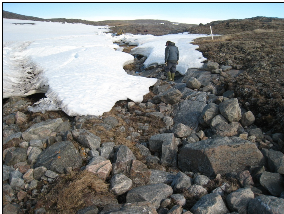
Photo 16 North of CRS-4 crossing stake located at Km 4.4 of the proposed access road route, note snowpack and boulders; south aspect.