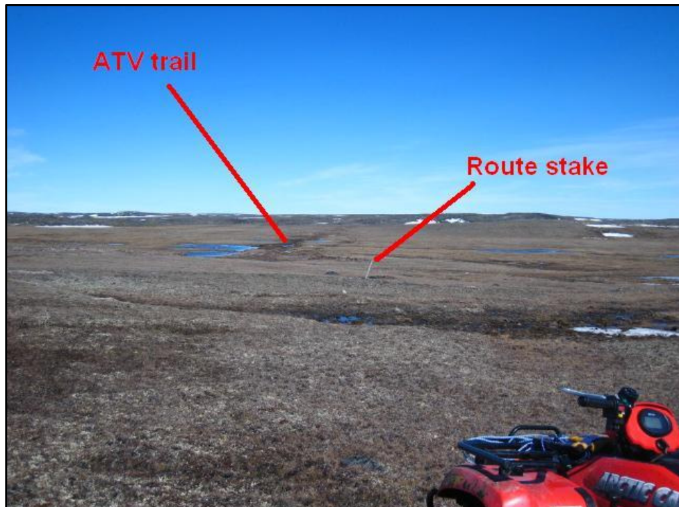
Photo 21 Proposed access road route near Km 5.7 with route stake and ATV trail, note terrain and standing water; east aspect.