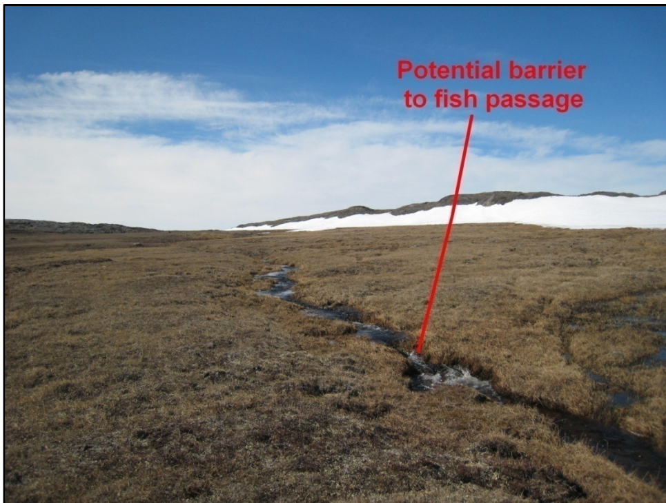
Photo 19 Stream reach upstream of CRS-5 crossing with potential barrier to fish passage, northeast aspect.