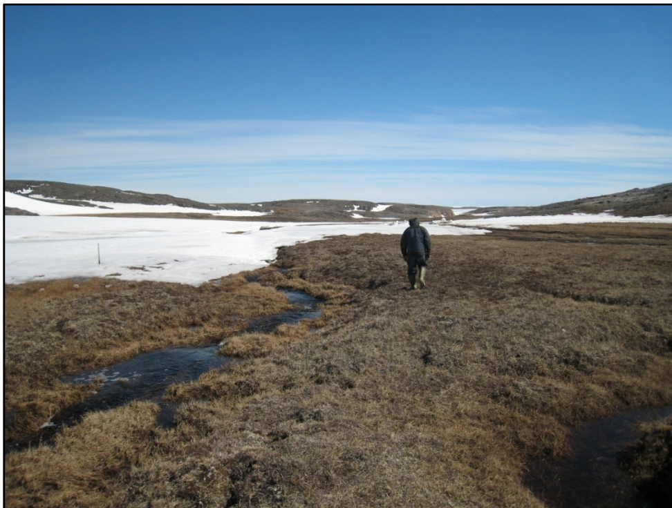
Photo 20 Stream reach downstream of CRS-5 crossing, note snow cover, vegetated valley bottom and bedrock ridges to east and west; south aspect.