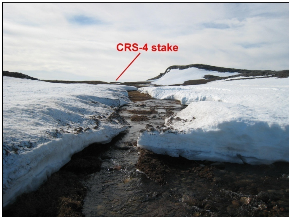
Photo 15 Stream reach downstream of CRS-4 crossing with large snowpack still present; north aspect.