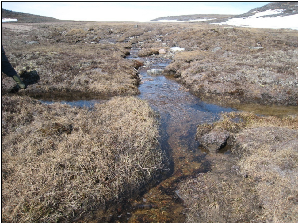
Photo 27 ATV crossing site upstream of CRS-7, note altered substrate, widened channel and bedrock ridges to east and west; north aspect.