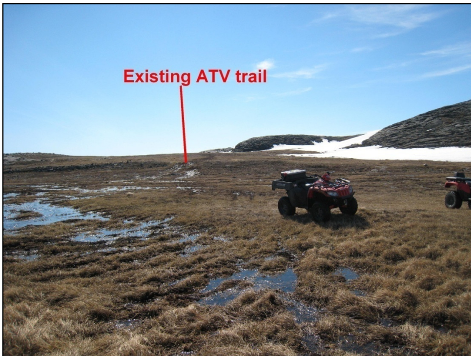
Photo 23 Wide spread flow pattern with ATV tracks across flow upstream of the CRS-6 crossing, existing ATV trail in background; southwest aspect.