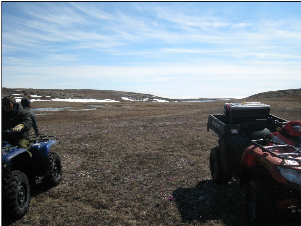
Photo 29 Terrain at the end of the proposed access road route, note small pond adjacent to area and bedrock ridges to east and west; south aspect.