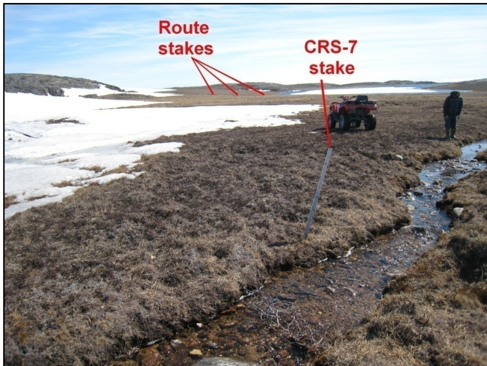
Photo 25 Stream reach at the CRS-7 crossing site, note vegetated banks and snow cover with other route stakes in background; south aspect.