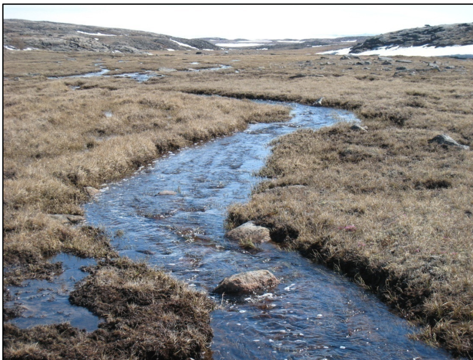
Photo 24 Stream reach downstream of CRS-6 crossing site with defined channel, note bedrock ridges to east and west; south aspect.