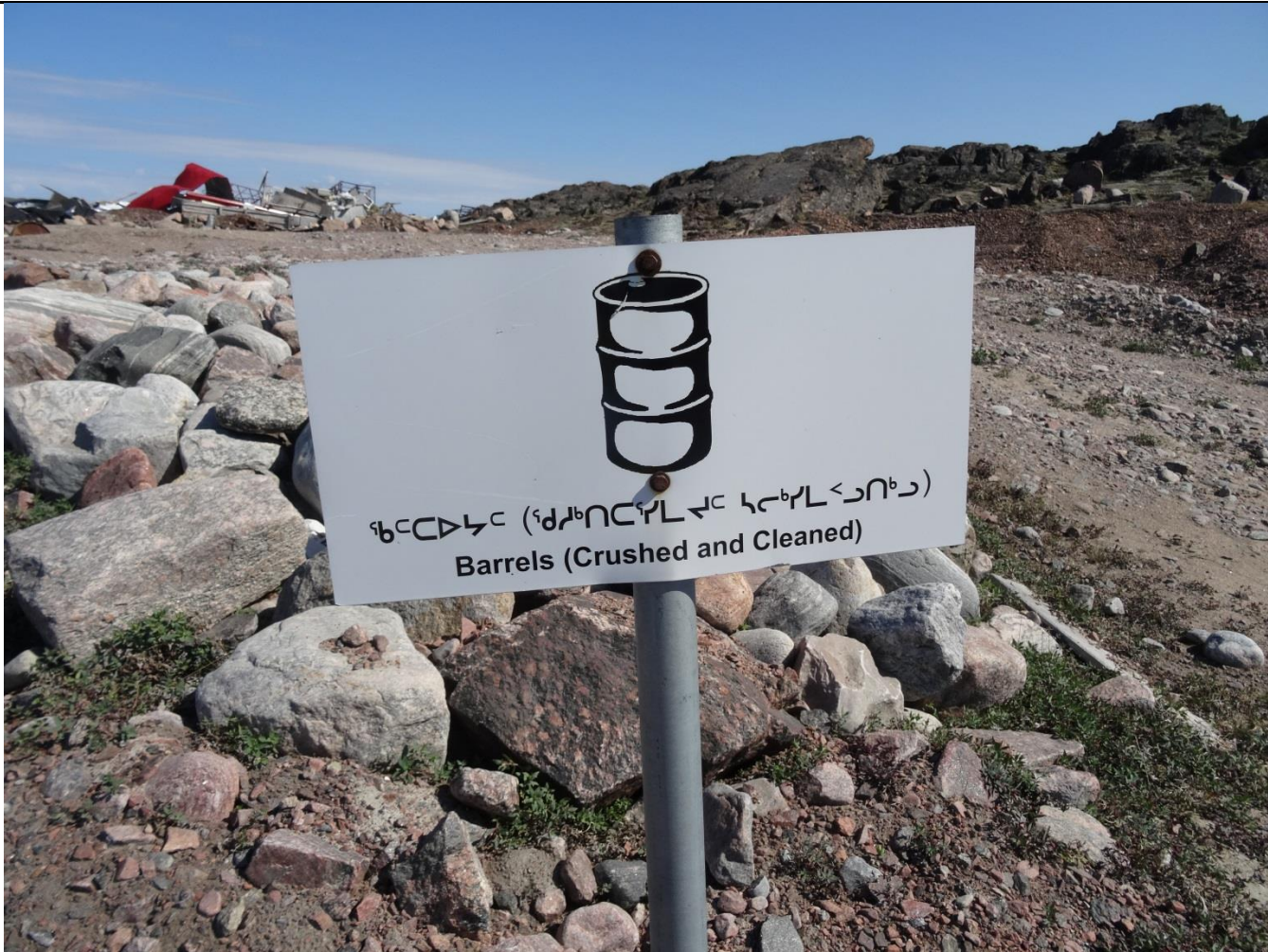
Description: Metal Dump – Signage for Crushed and Cleaned Drums