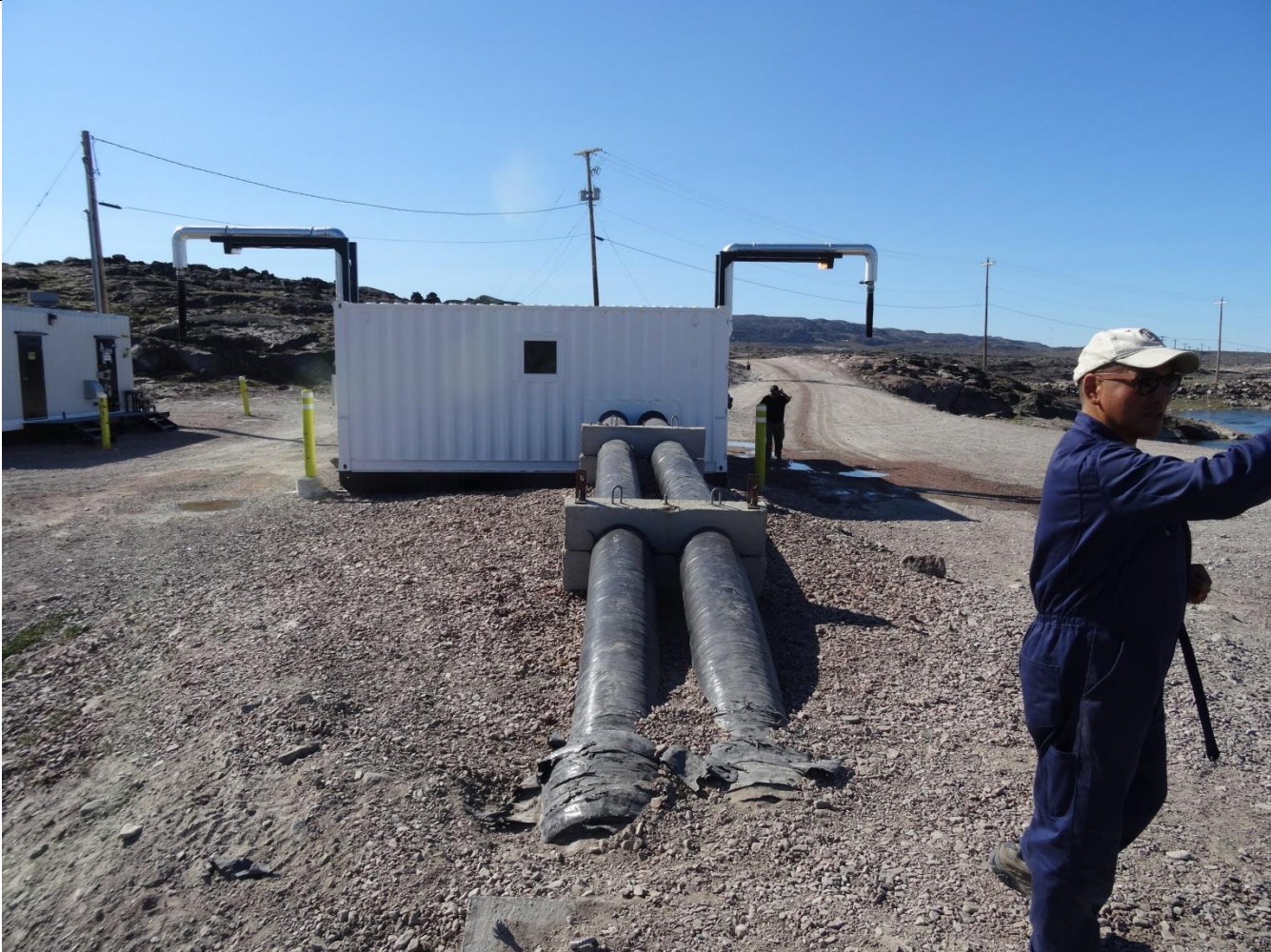
Description: Water Intake Building – Rear View