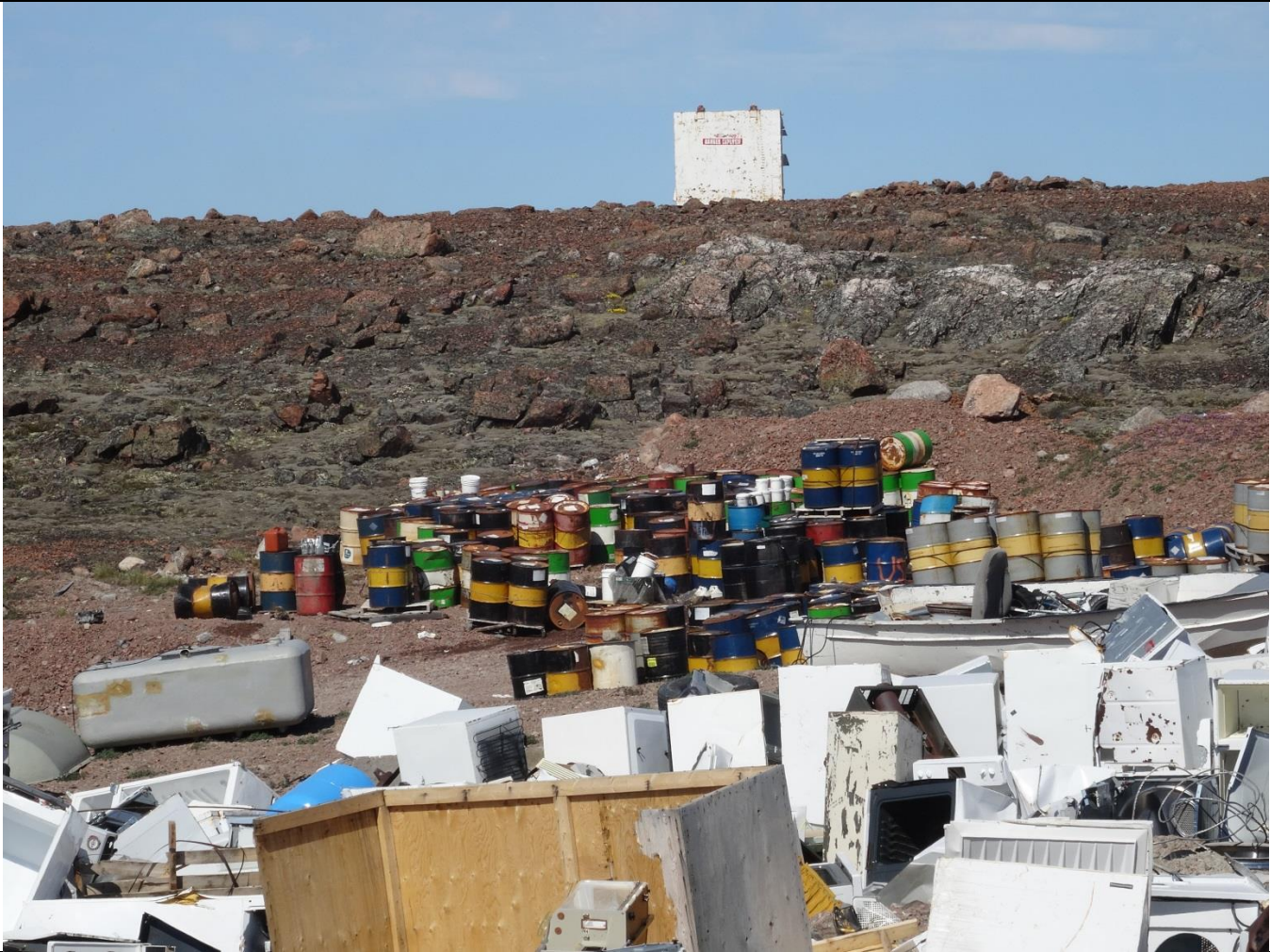
Description: Metal Dump – Drums Full of Used Oils