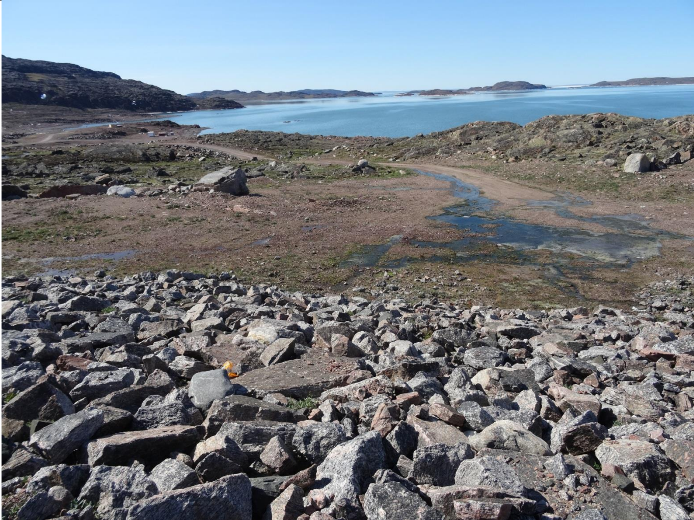
Description: Sewage Lagoon – Leak #2 in Berm flowing toward ocean