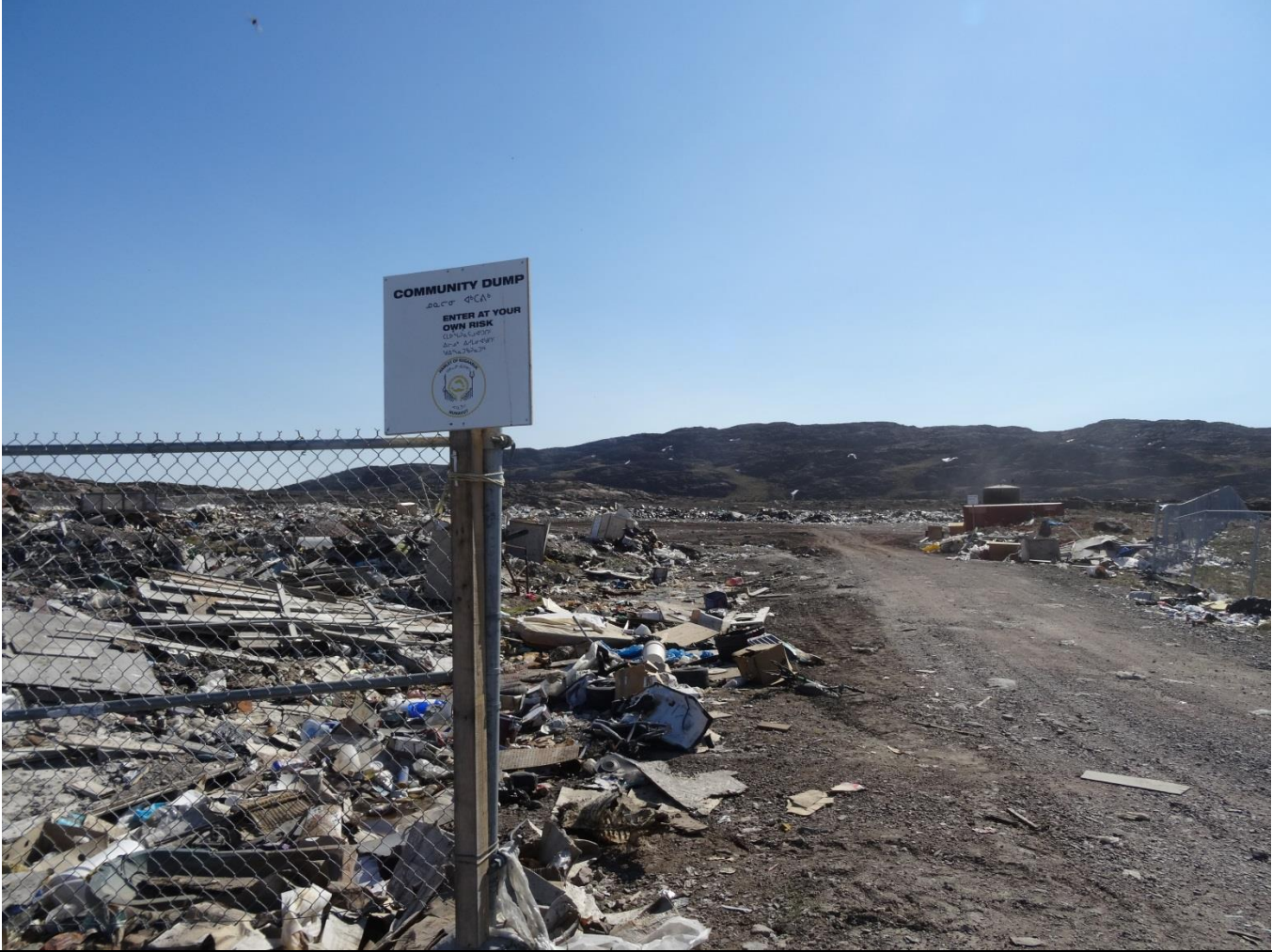
Description: Main Dump – Entrance – Very Nice Signage