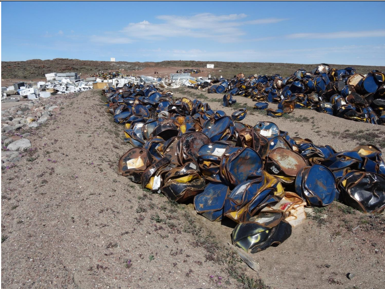
Description: Metal Dump – Crushed and Cleaned Barrels in Lined Berm Area