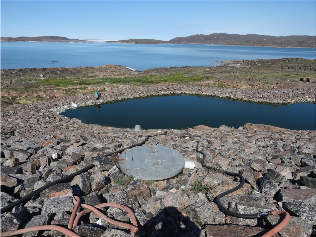
Description: Sewage Lagoon – Decant Pond