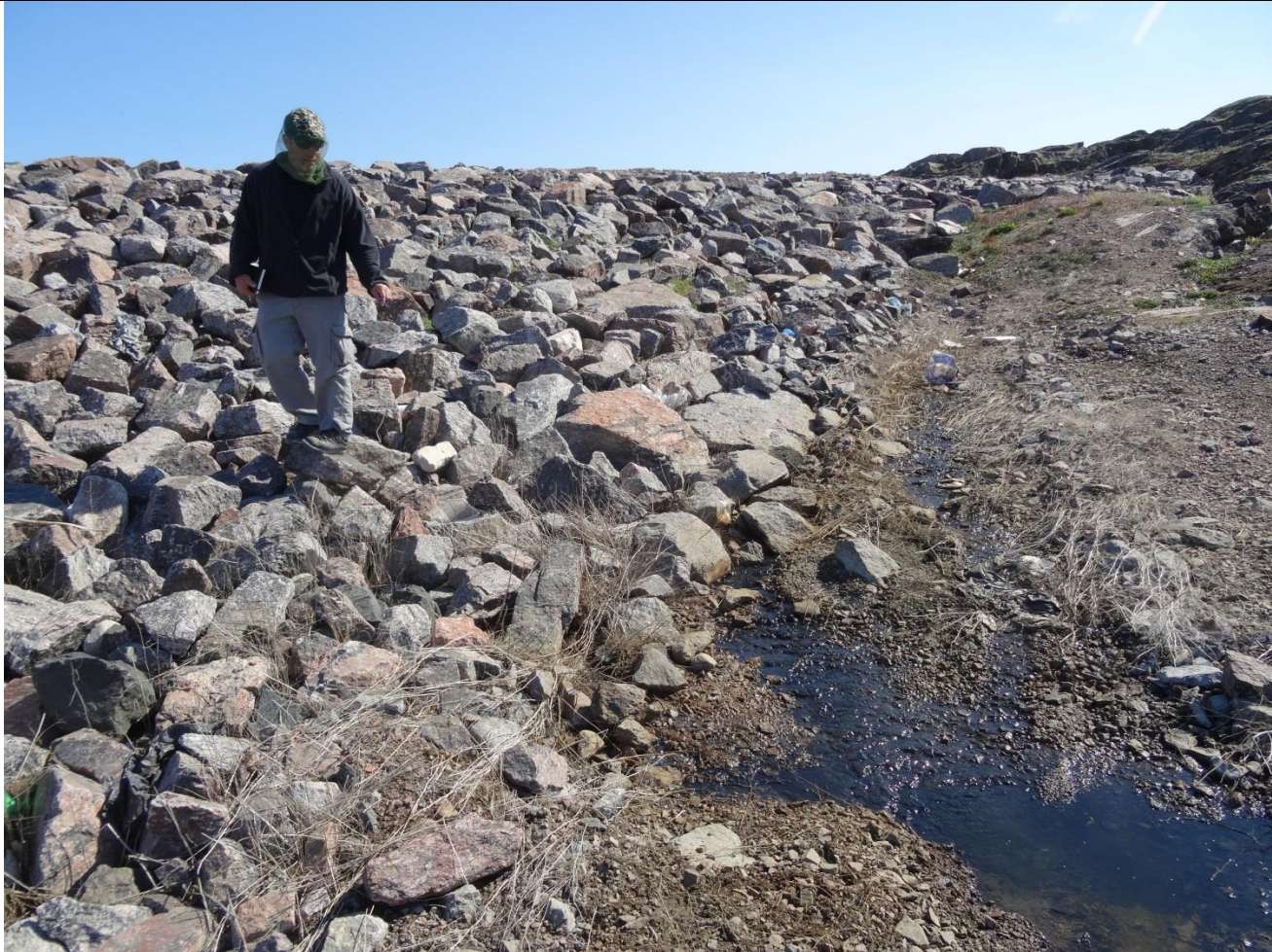
Description: Sewage Lagoon – Leak #1 in Berm – Bottom View