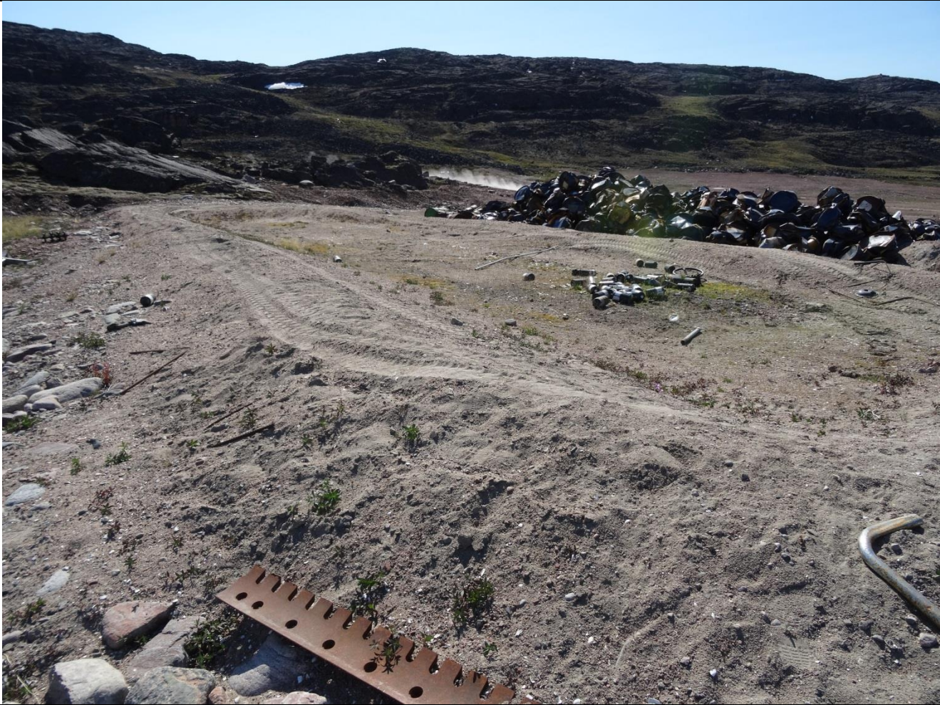
Description: Metal Dump – Lined Berm Area - Empty