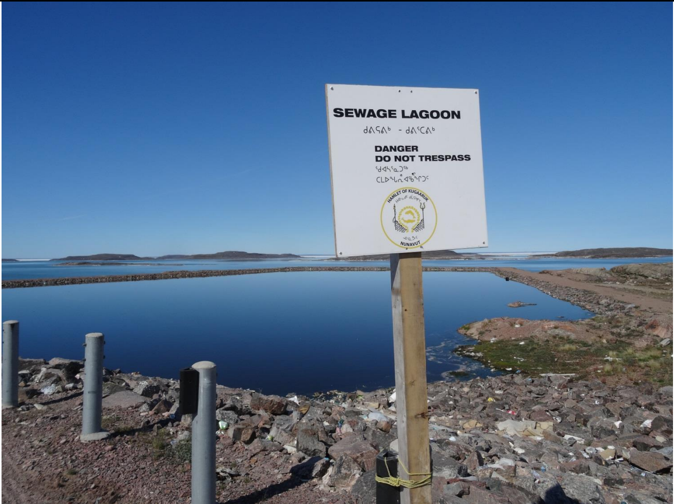
Description: Sewage Lagoon – From Truck Dumping Station – Very Nice Signage