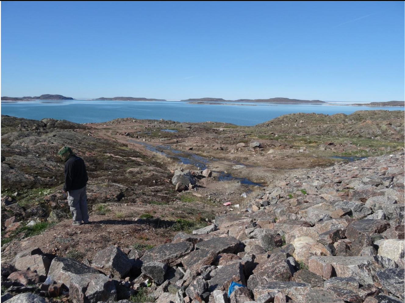
Description: Sewage Lagoon – Leak #1 in Berm flowing toward ocean