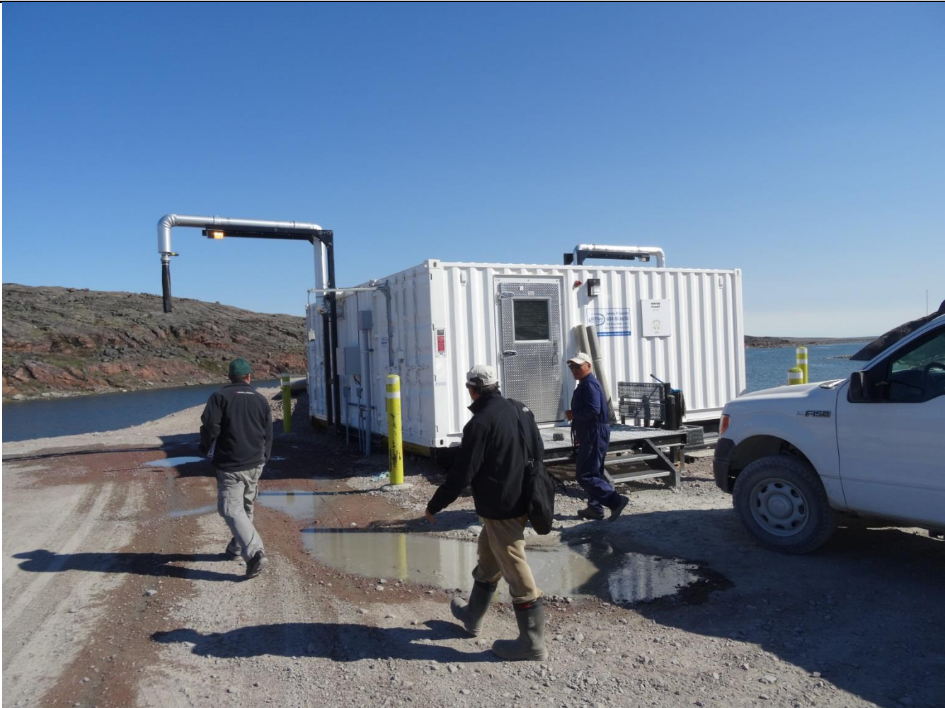
Description: Water Intake Building – Front View