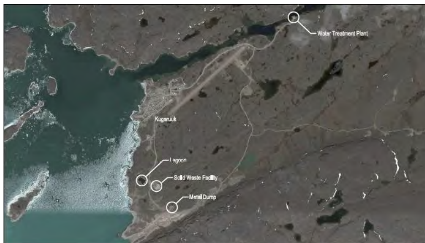
Figure 1 Kugaaruk and Surrounding Area

The community and surrounding area are shown in Figure 1.