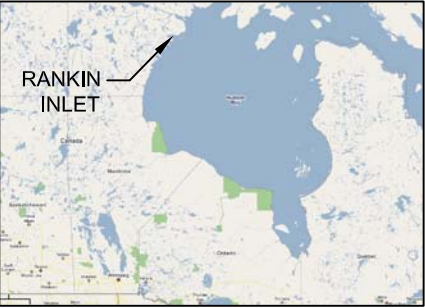
KEY PLAN (n.t.s.)