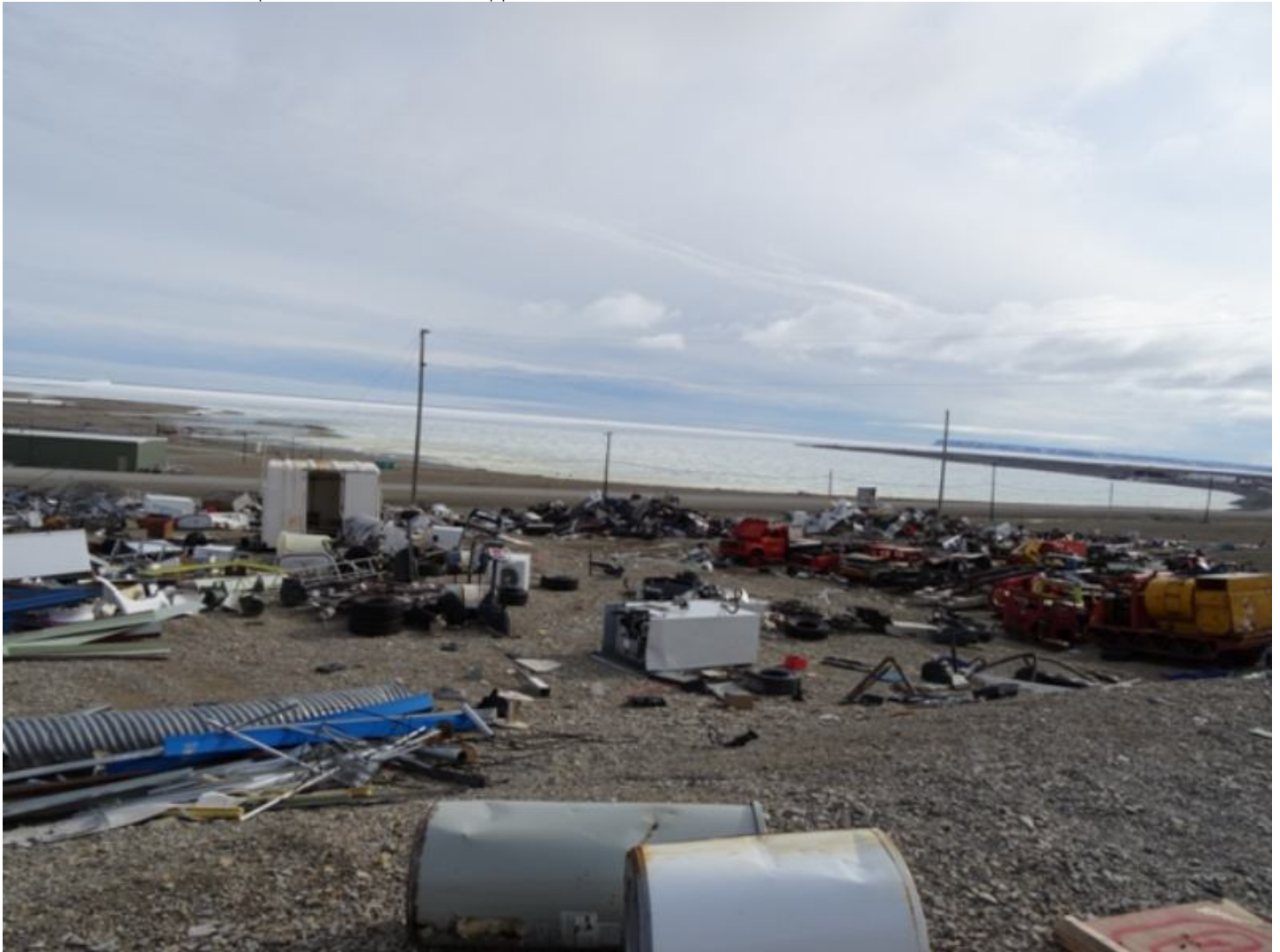
Figure 10 Bulk Waste Metals Site 2