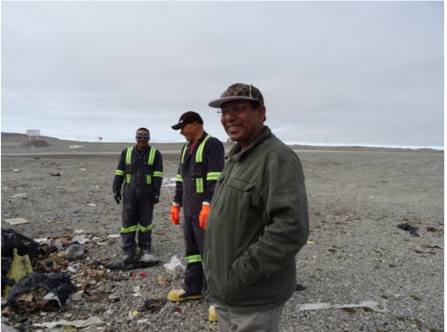
Figure 6 Municipal and Staff and Regional Engineer