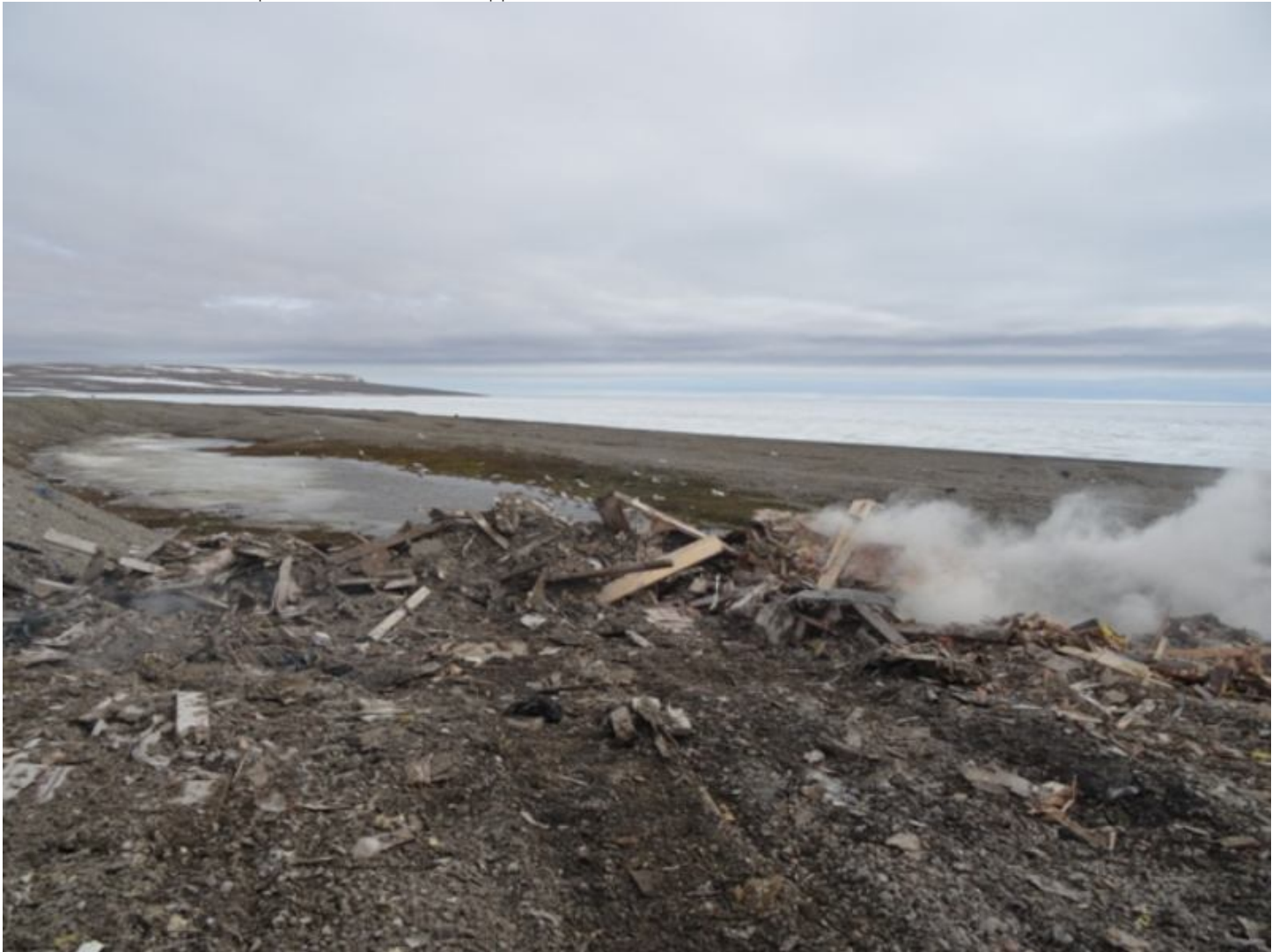
Figure 2 Municipal Waste Management Area