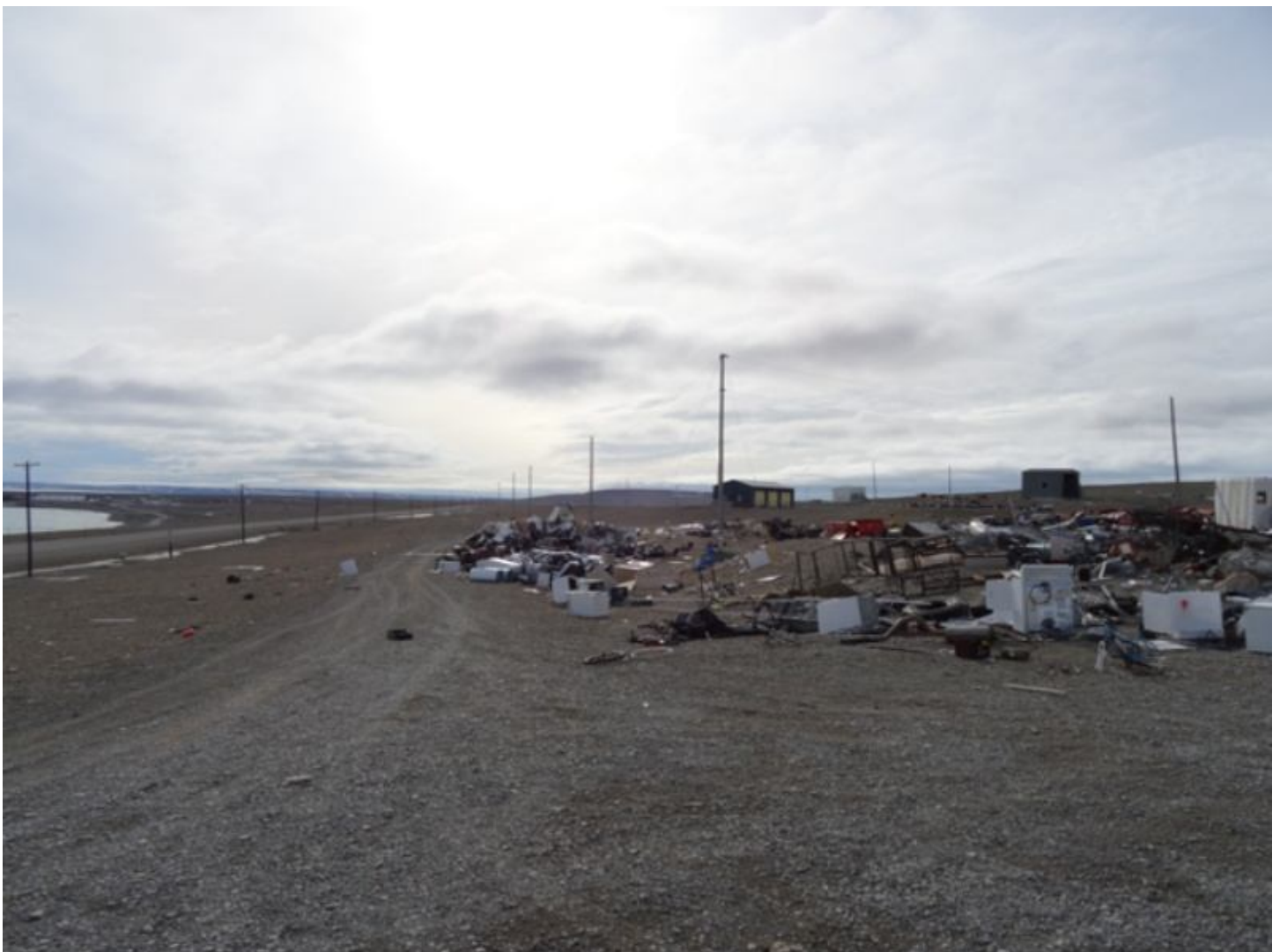
Figure 9 Bulk Waste Metals Site