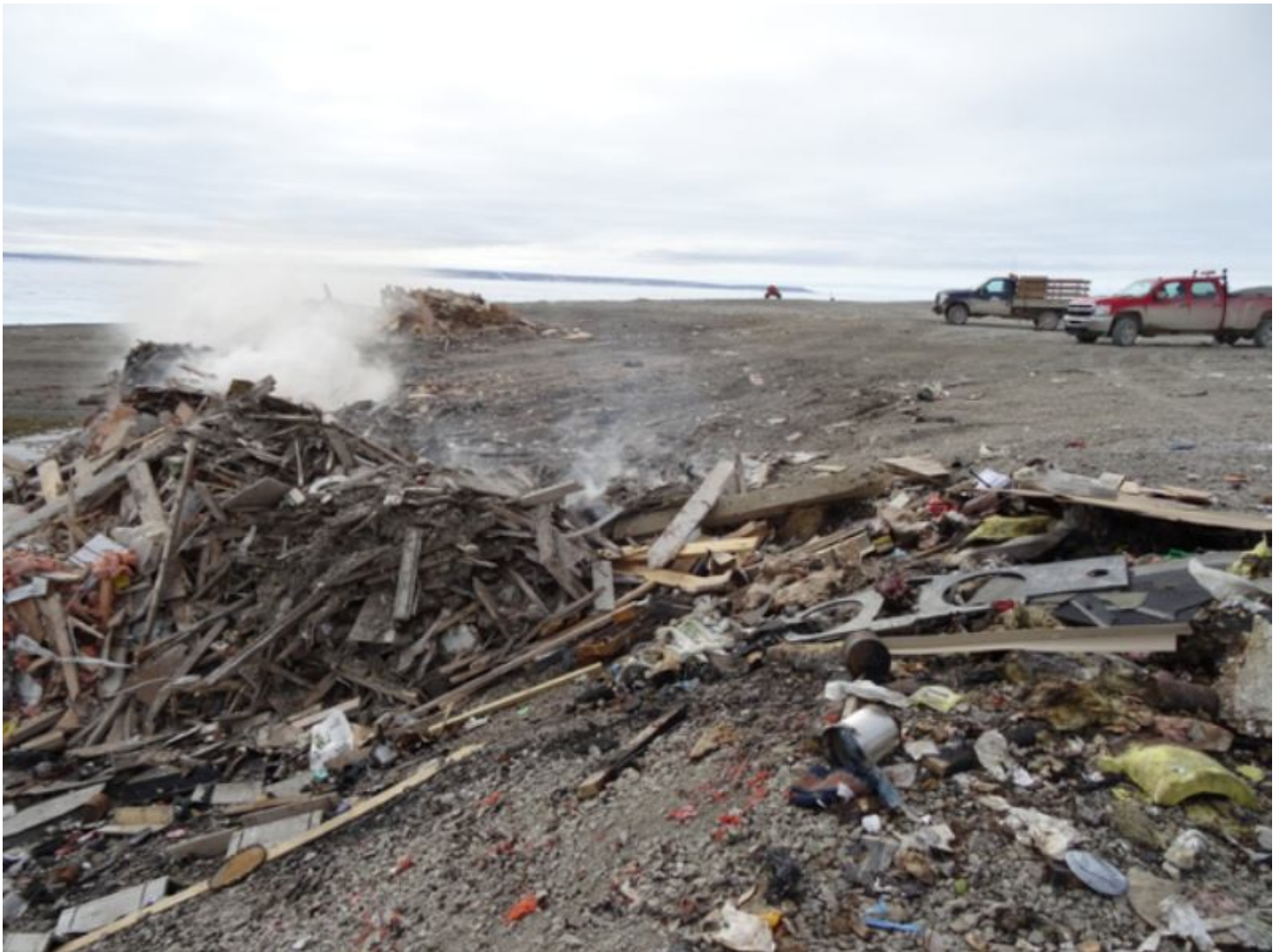
Figure 7 Municipal Waste Management Area 5