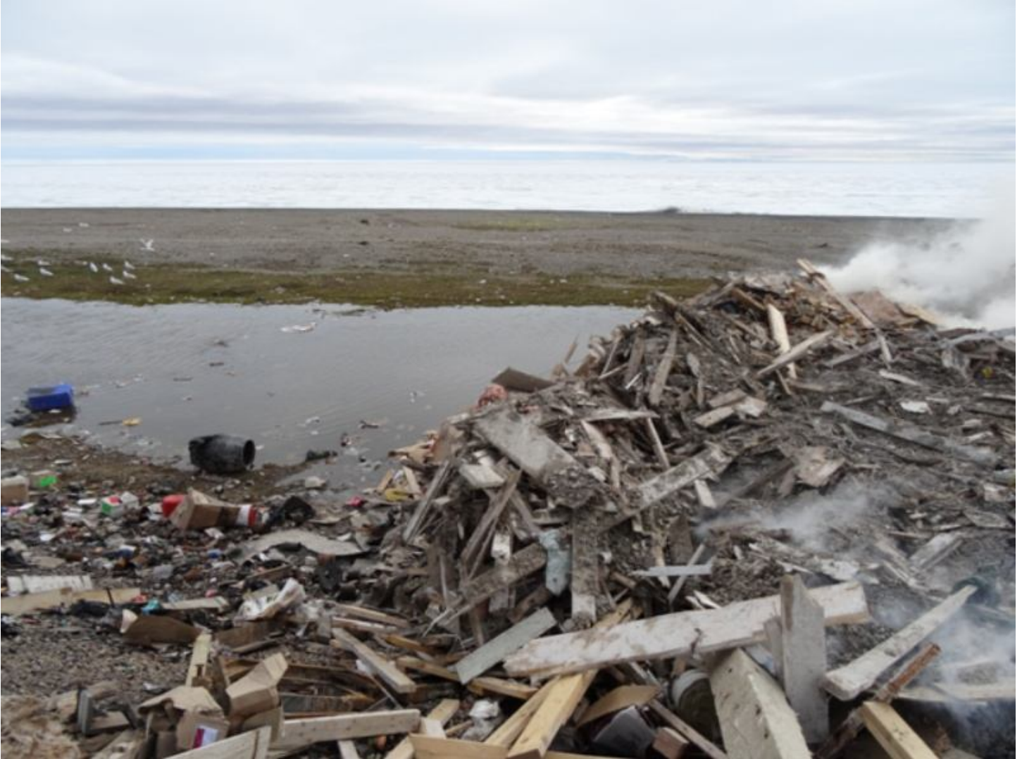
Figure 4 Municipal Waste Management Area 3