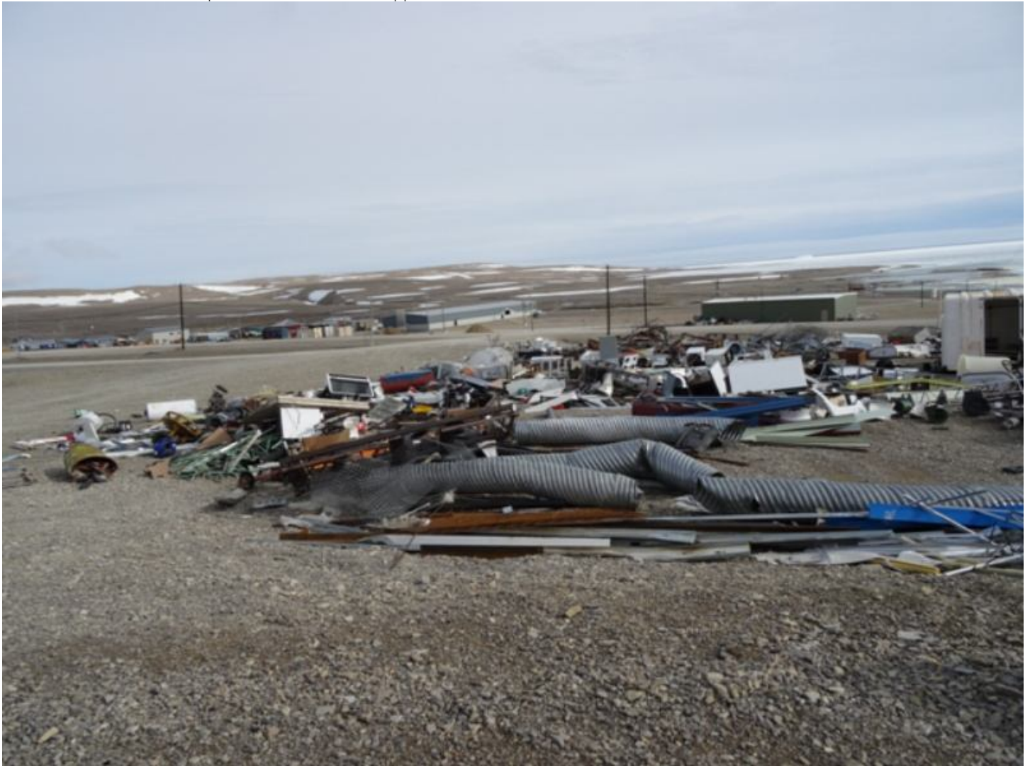
Figure 12 Bulk Waste Metals Site 4