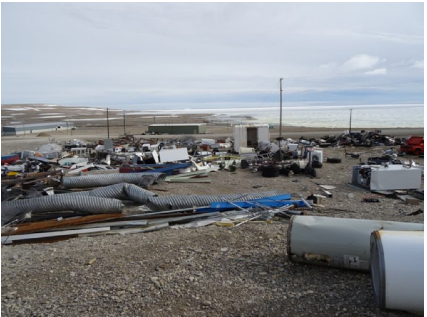
Figure 11 Bulk Waste Metals Site 3