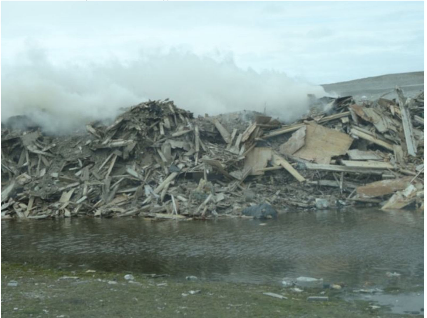
Figure 8 Sampling point below the Waste Management Area