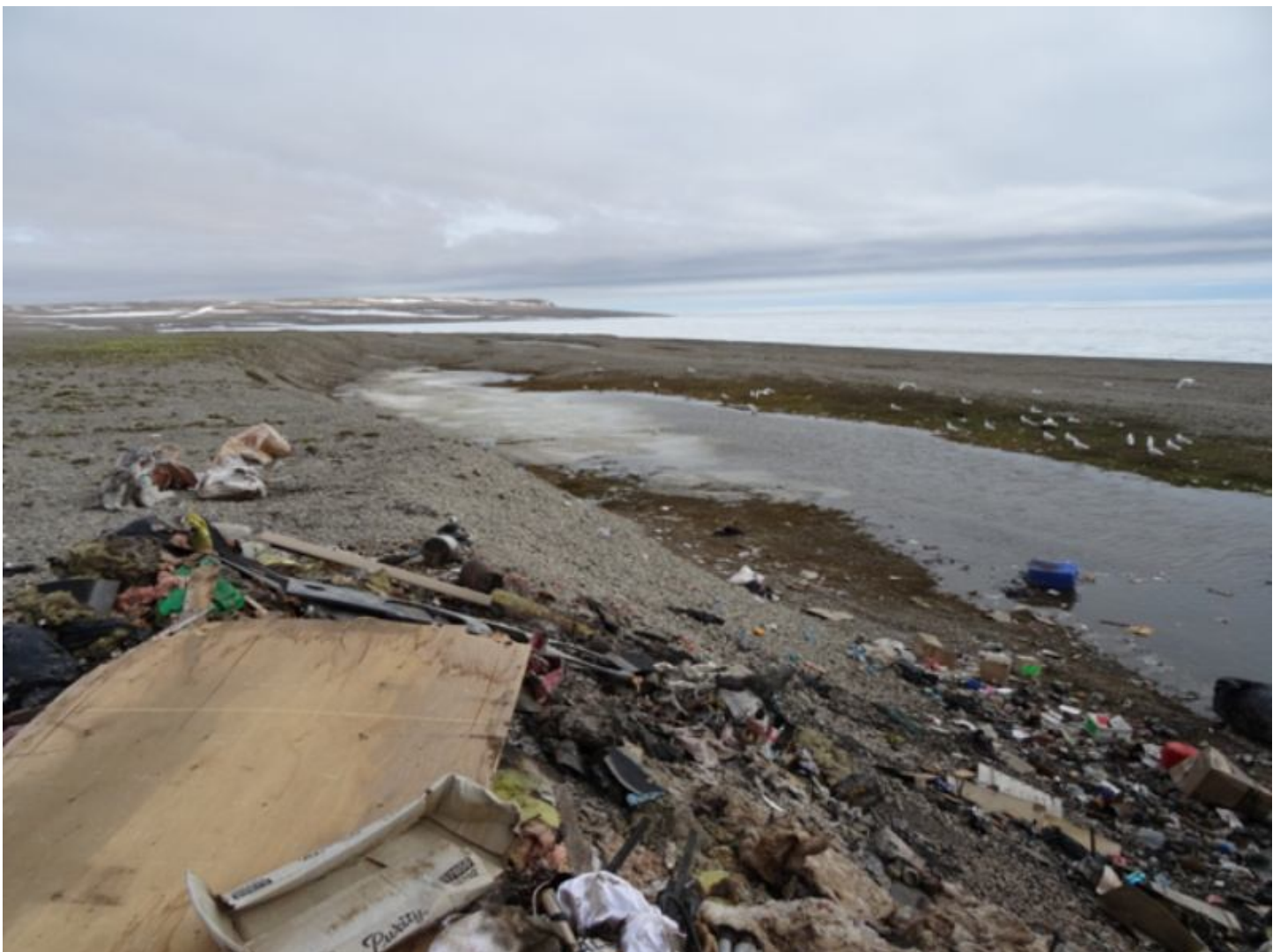
Figure 3 Municipal Waste Management Area 2