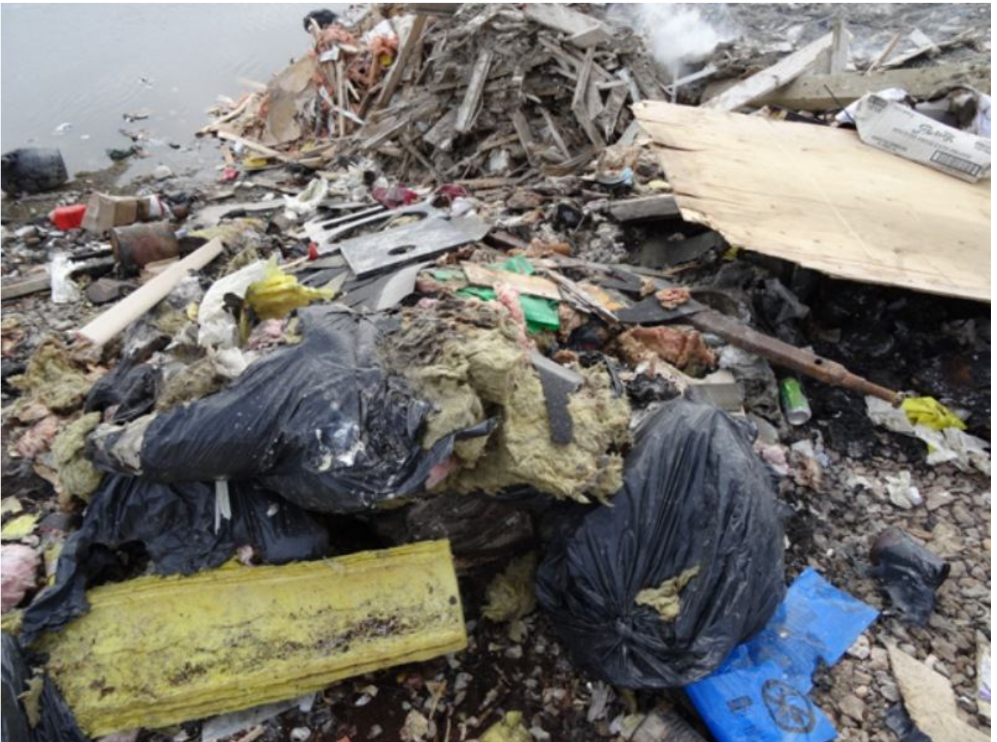
Figure 5 Municipal Waste Management Area 4