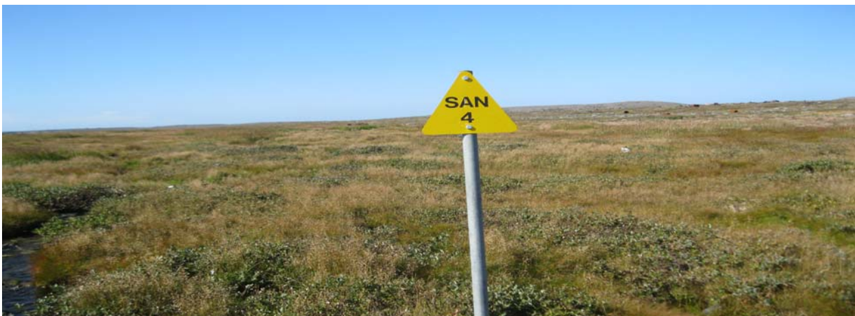
Wastewater effluent sampling Point