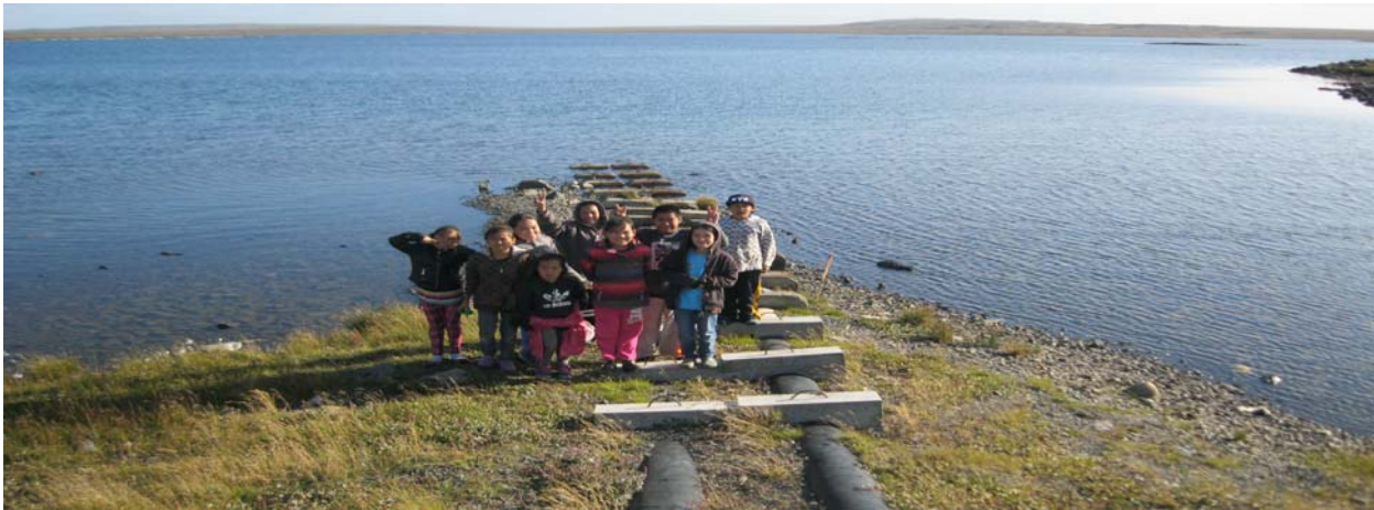
Sanikiluaq water Source Intake