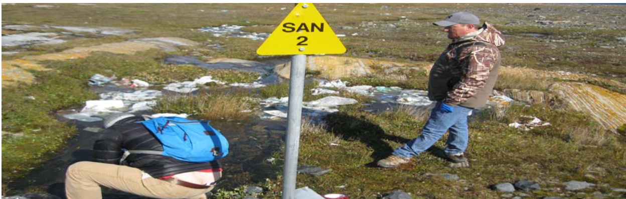
Leachate sampling Point