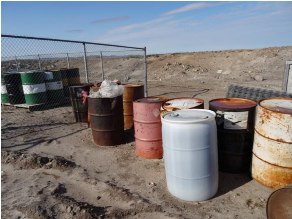
Figure 9 Barrels of unknown origin outside facility in Taloyoak