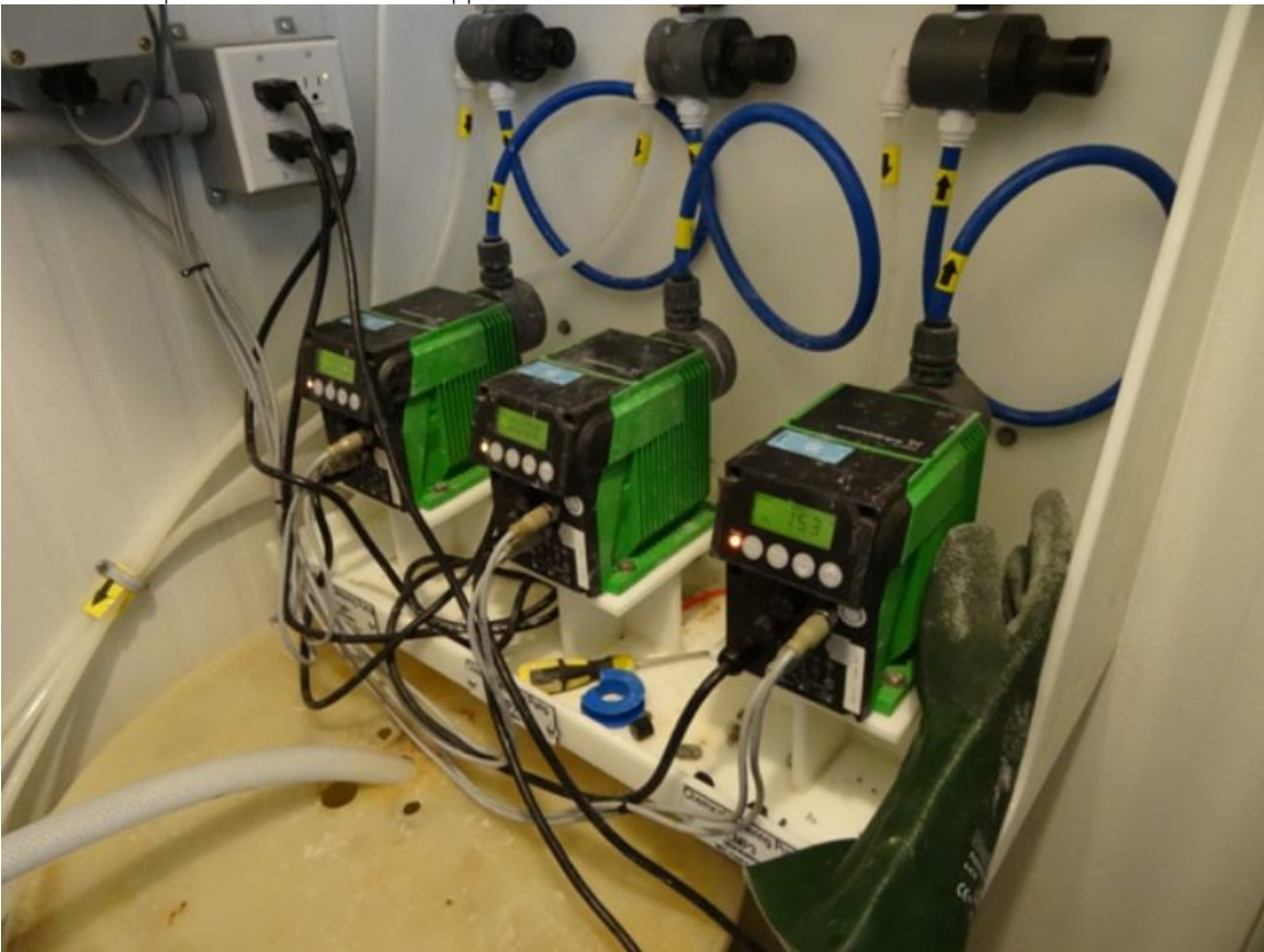
Figure 6 Trible redundant chlorination system - Taloyoak