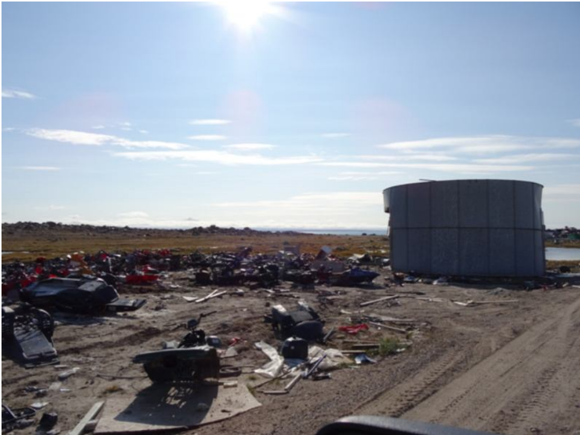
Figure 15 Solid Waste Management Area - Unlicensed