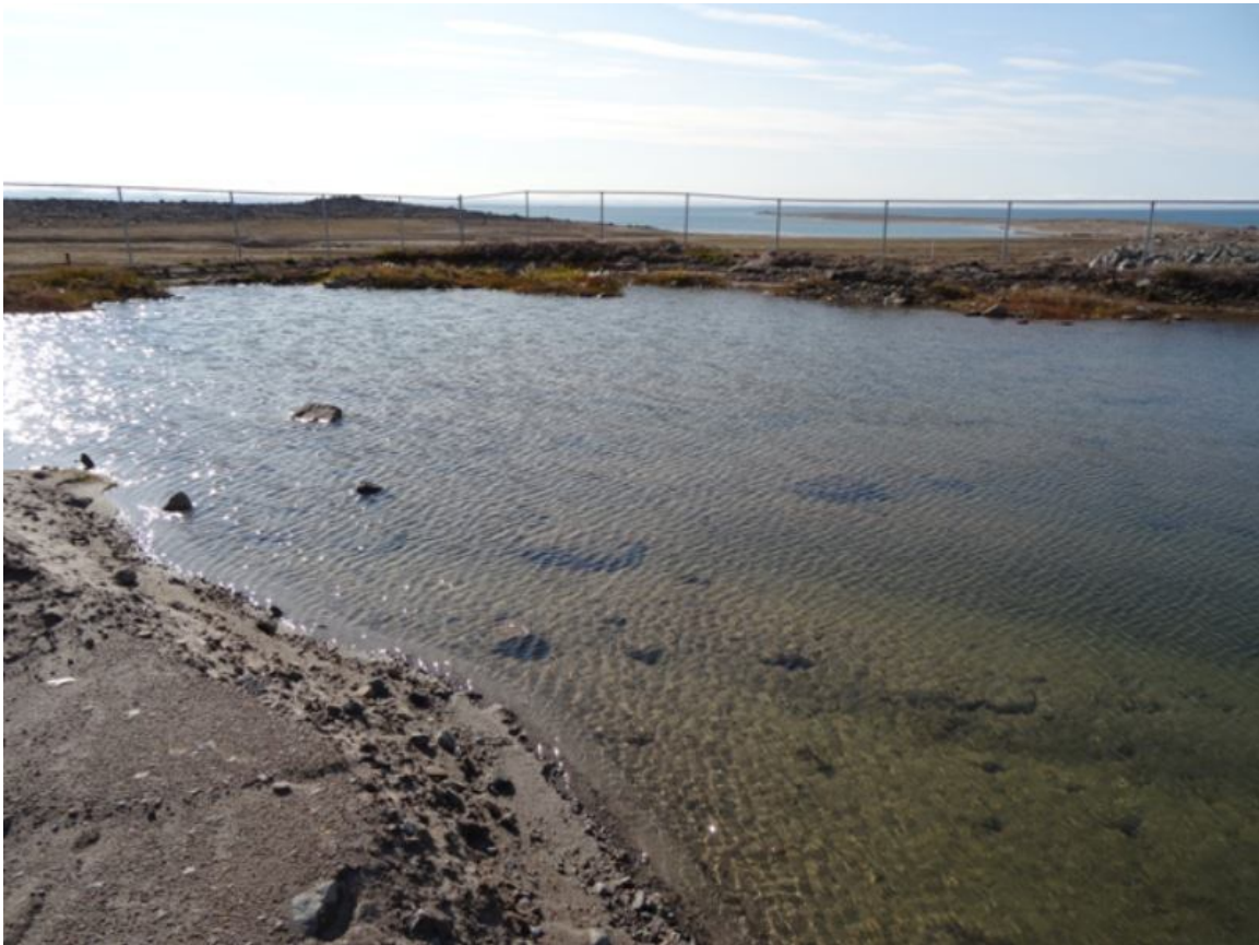
Figure 11 Water Trapped within the facility