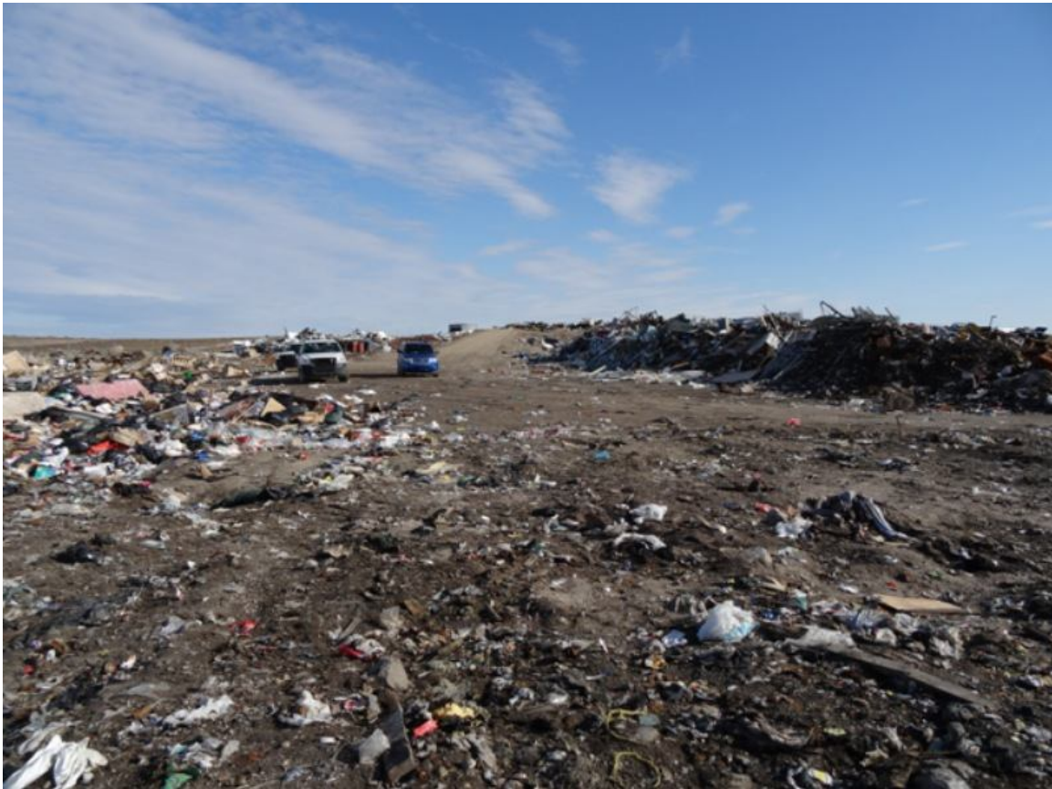
Figure 19 Municipal Waste Management Area