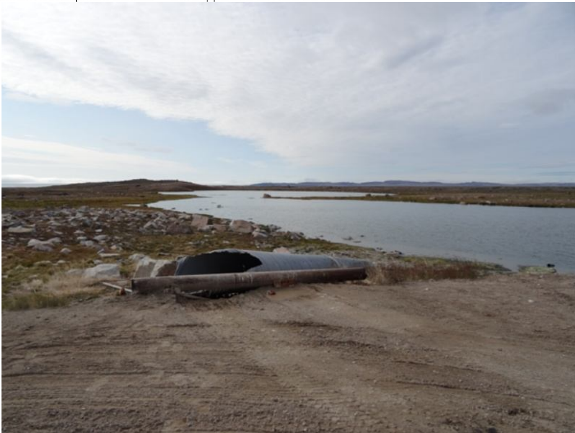
Figure 20 Truck Drop off at Waste Water Facility - Pond