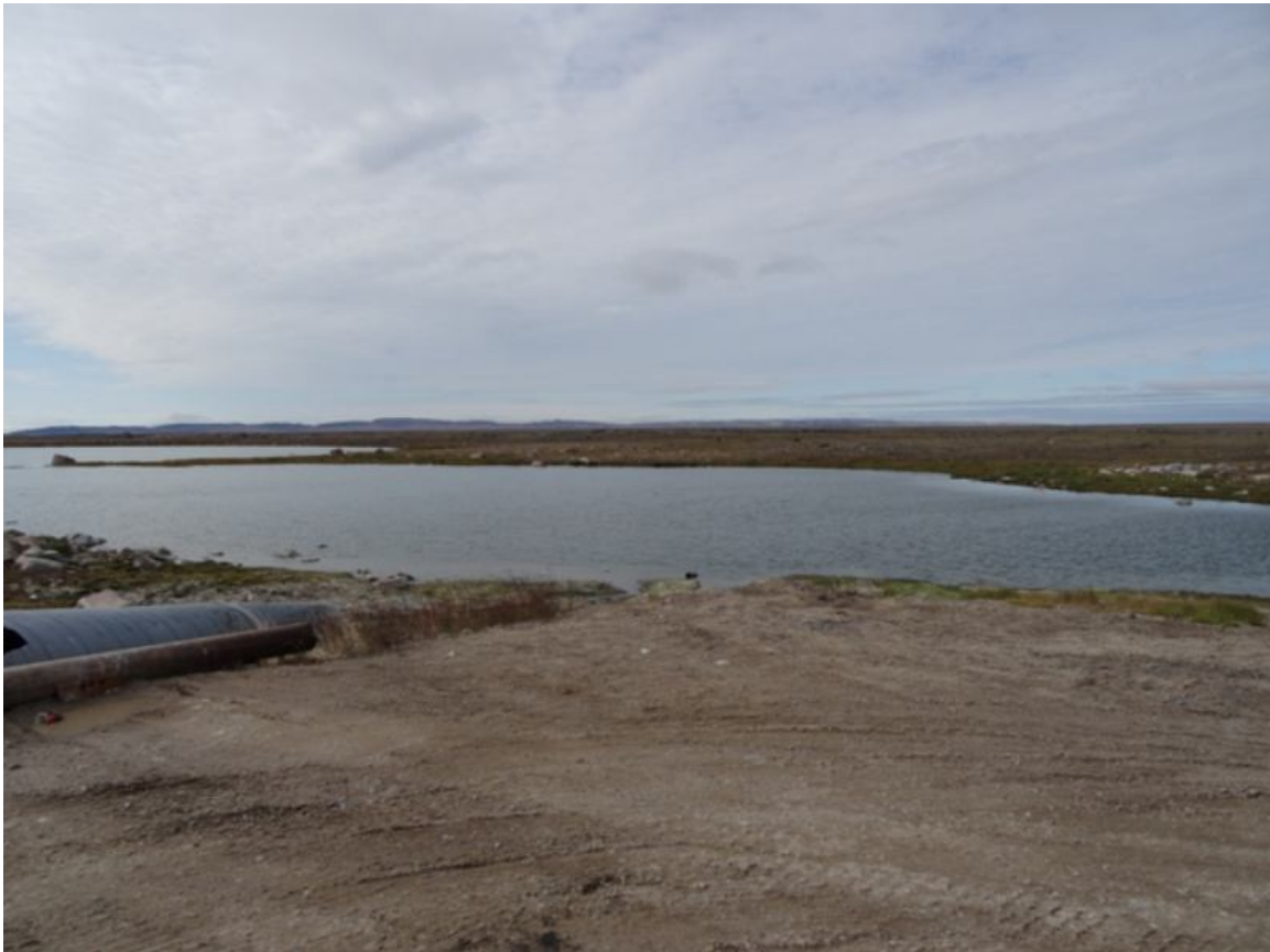
Figure 21 Pond