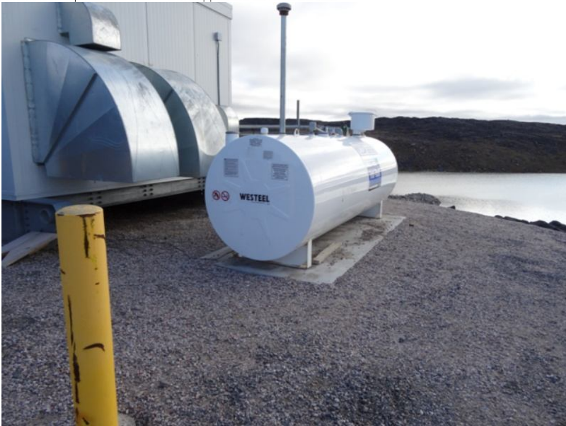
Figure 2 Fuel tank outside Facility. Double walled