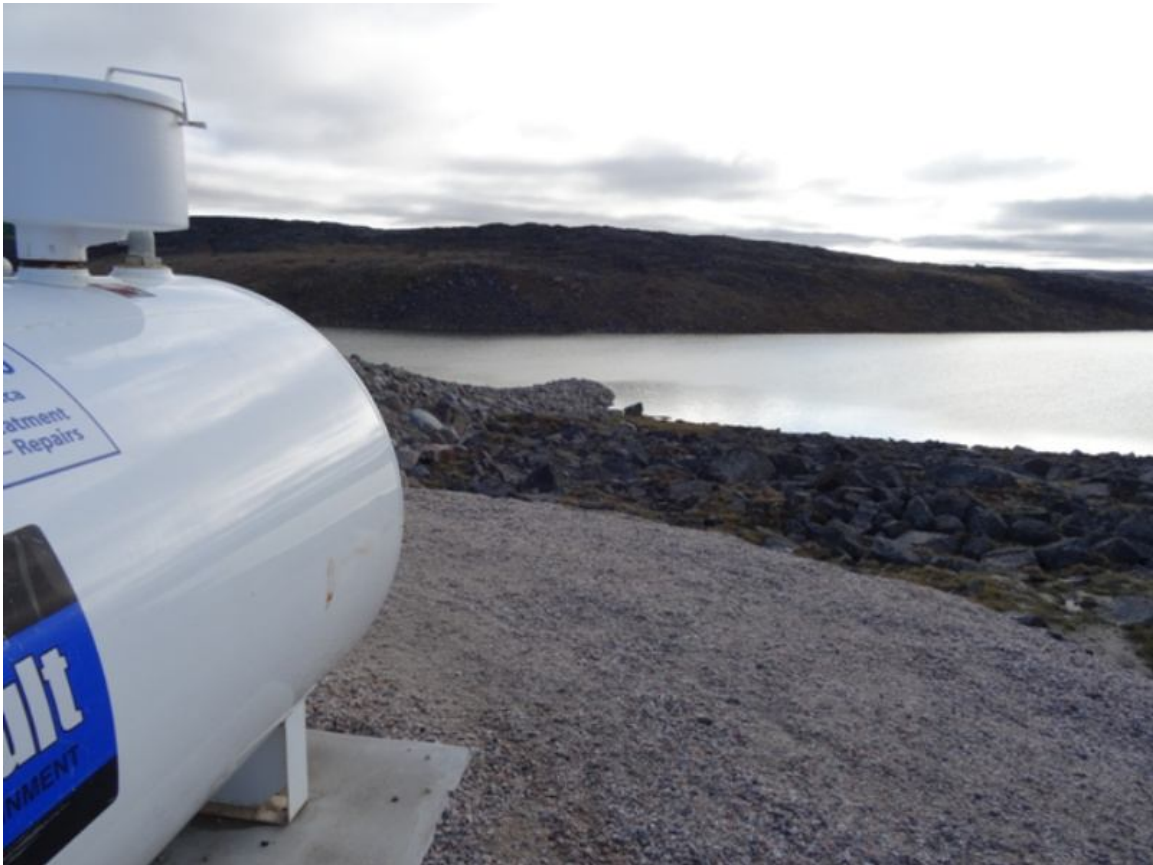
Figure 3 Canso lake behind Tank - Taloyoak