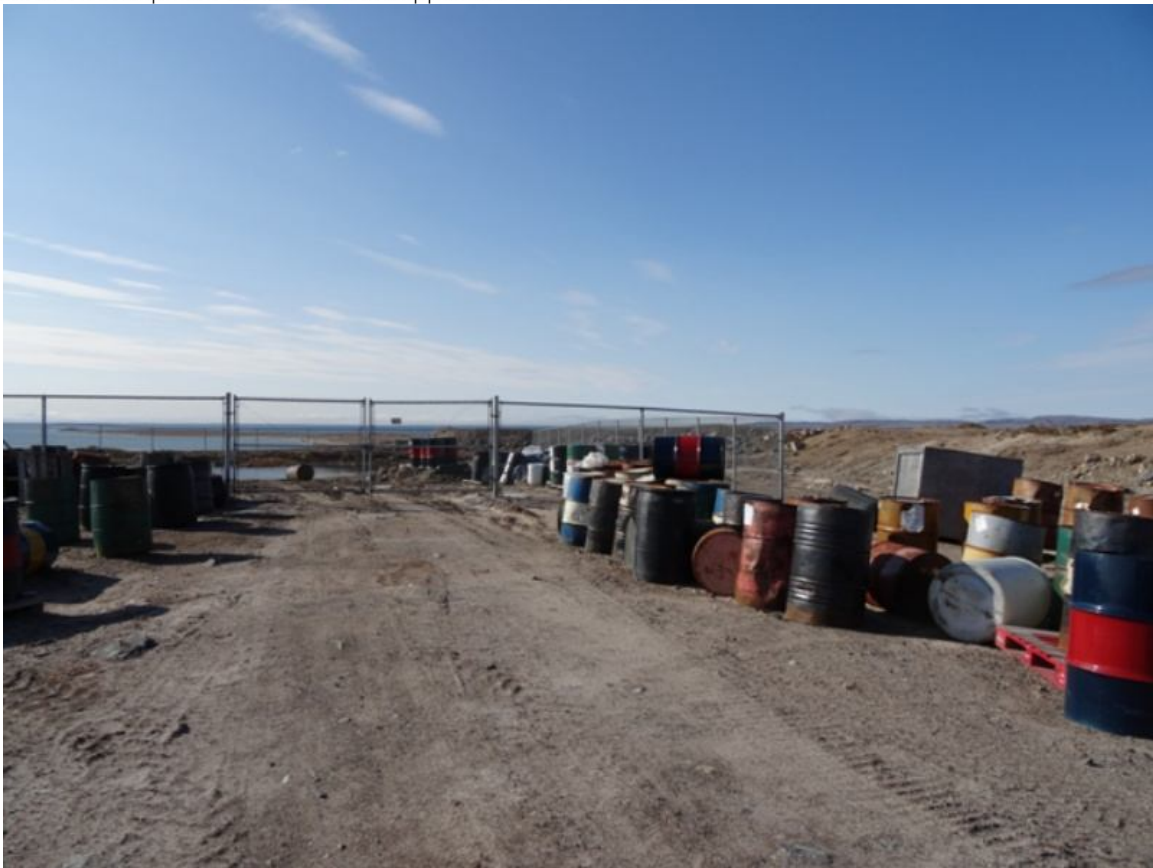
Figure 8 Hazardous wastes, contaminated soils storage and Landfarm - Taloyoak