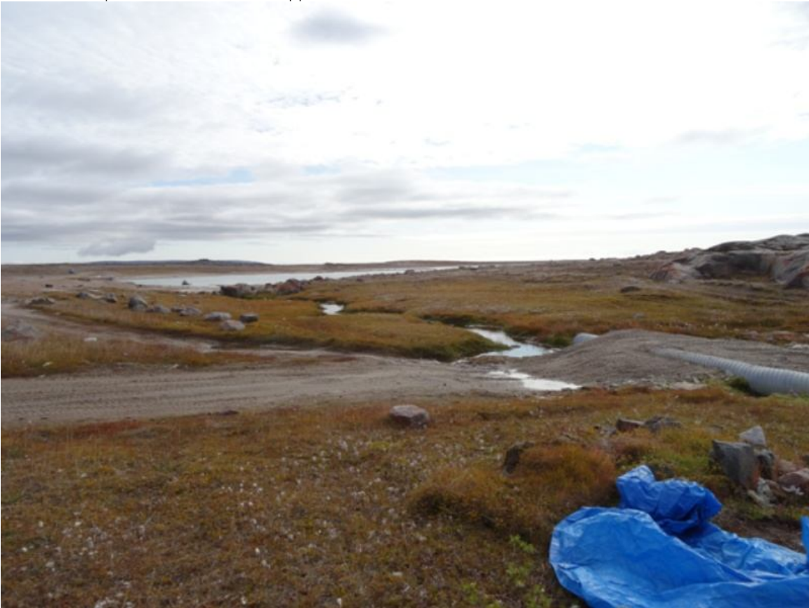
Figure 22 Final Point of control from the Waste Water Treatment Facility - Pond