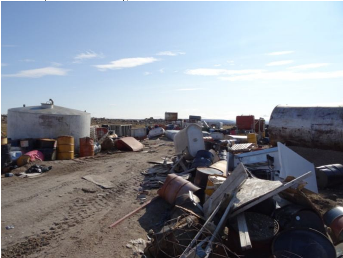
Figure 16 SWMA - Taloyoak