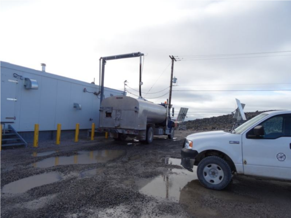
Figure 1 Intake and Treatment Facility Taloyoak