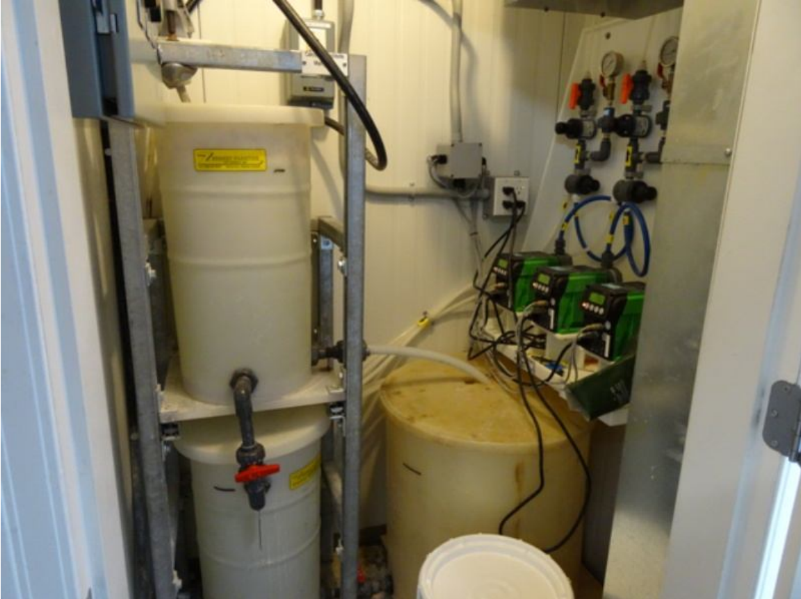
Figure 7 Mixing tank