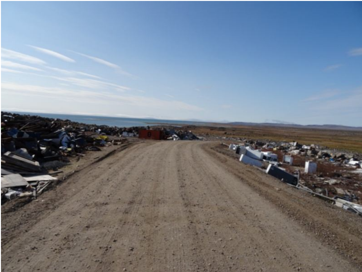
Figure 17 SWMA - Un segregated and not policed