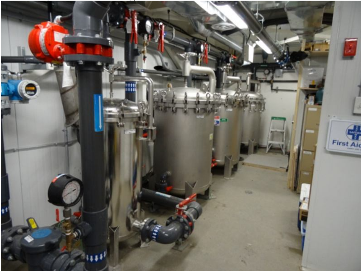
Figure 4 Filters in Treatment Facility