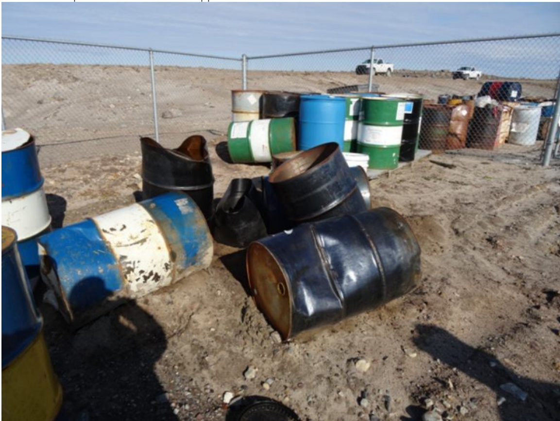
Figure 12 Drums of Unkown contents and origin within the facility