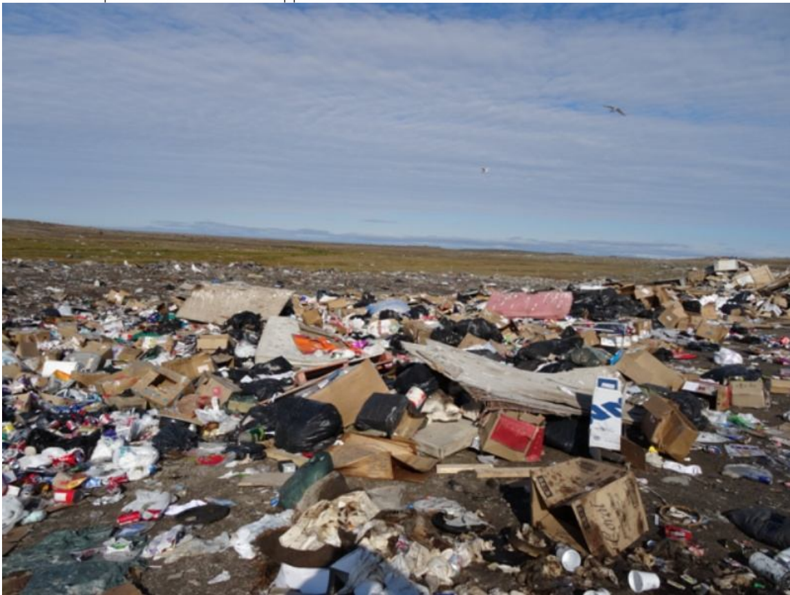
Figure 18 Municipal Waste Managment Area