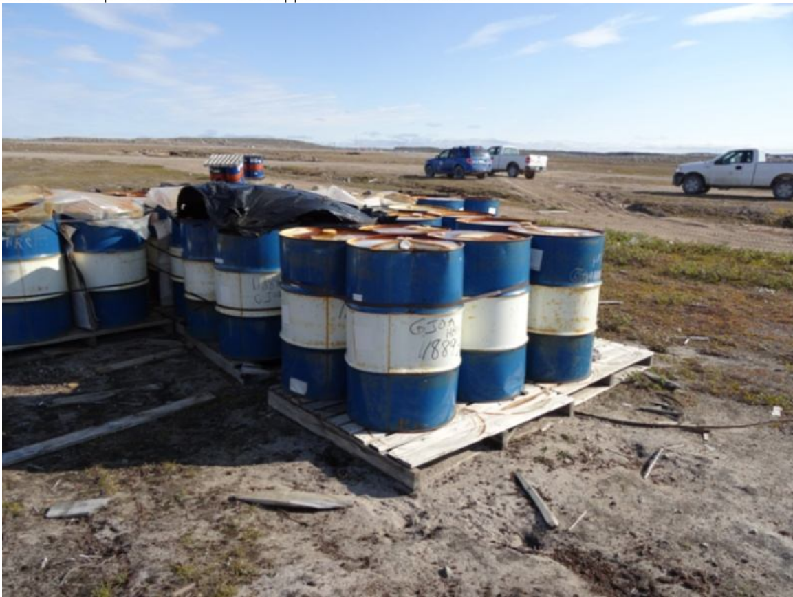
Figure 14 Old fuel stored outside the facility