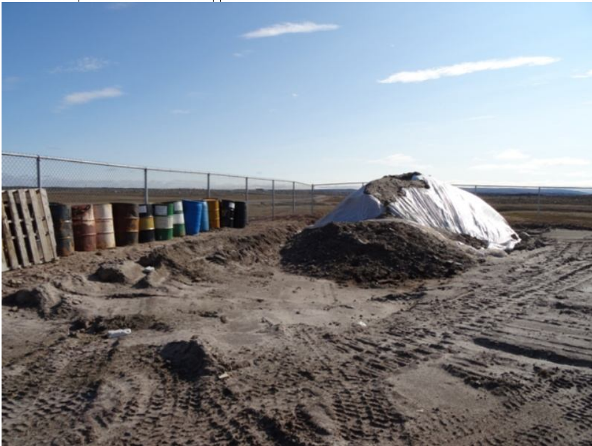
Figure 10 Contaminated soils deposited by Contractors in facility without the permission of Municipality