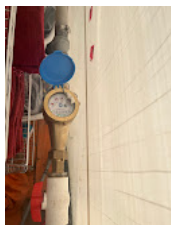
AW Water Meter.jpeg 252K