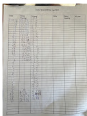
Water Log.jpeg 358K