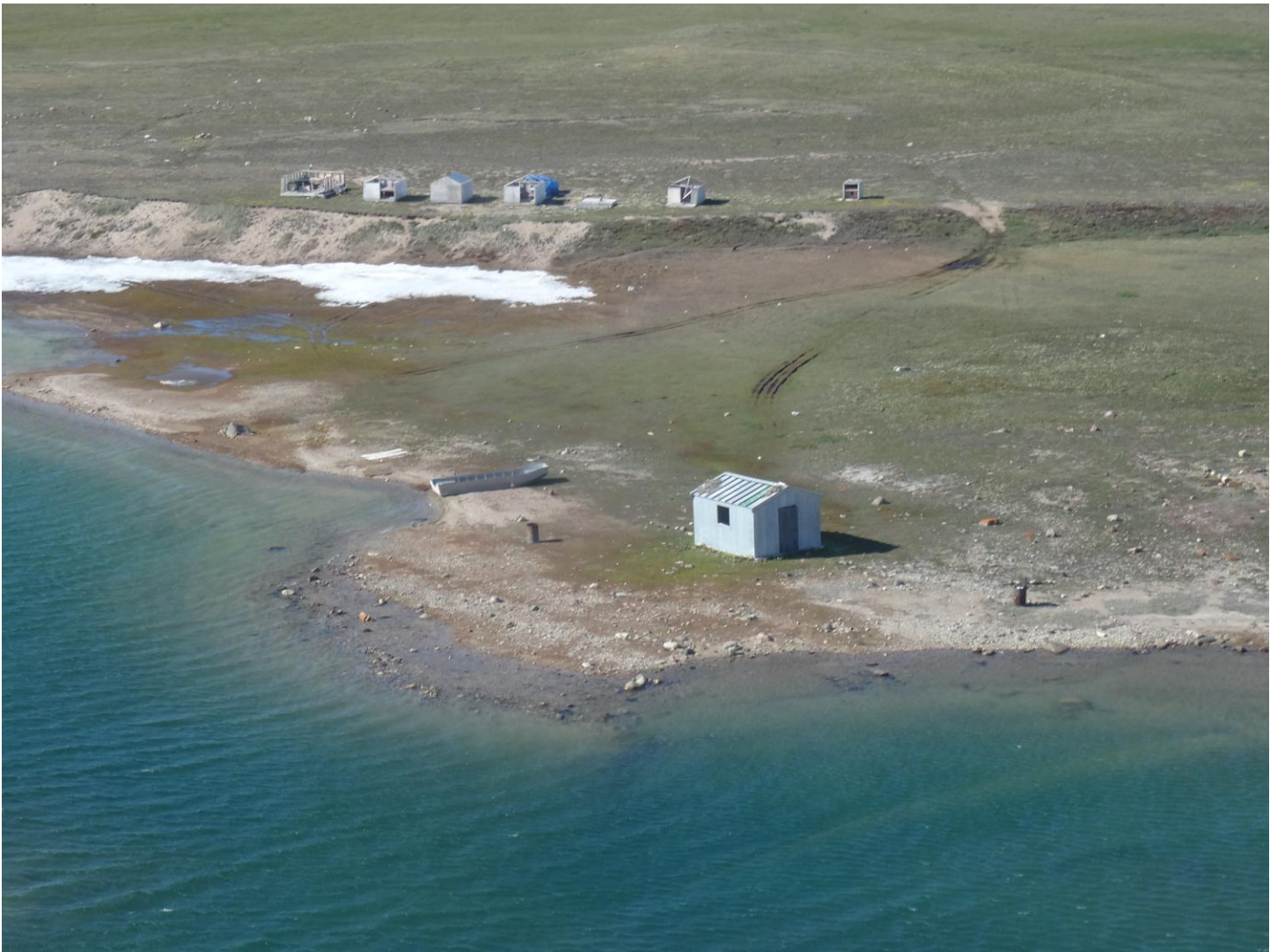
Figure 1. Mr. Hakongak's outfitting camp from the air. Large metal shed constructed, and other materials are stored, below the high water mark.