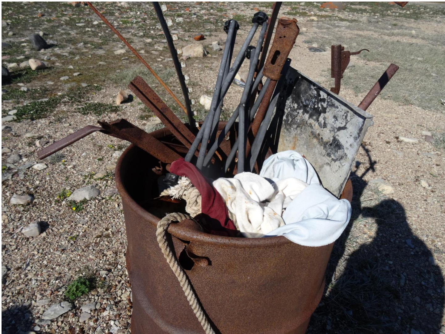
Figure 3. Contents of waste barrel.