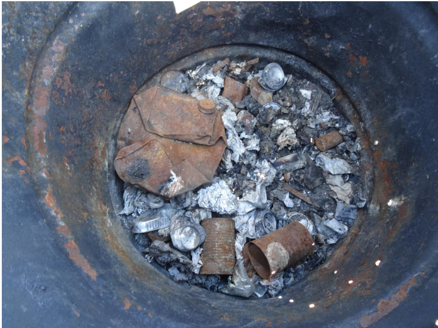
Figure 2. Contents of burn barrel.