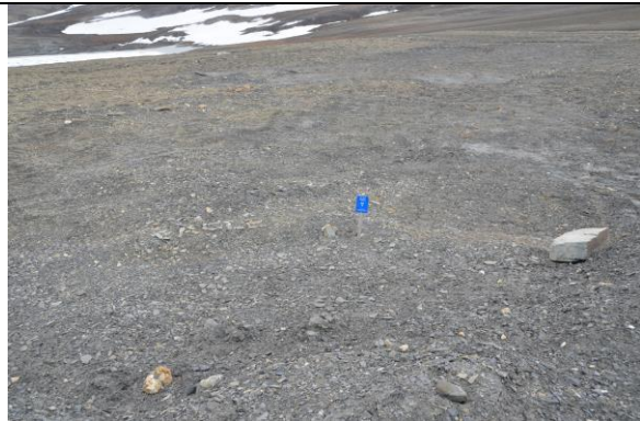
Photograph of site conditions of ALT-5 in June 2017 to show dry conditions.