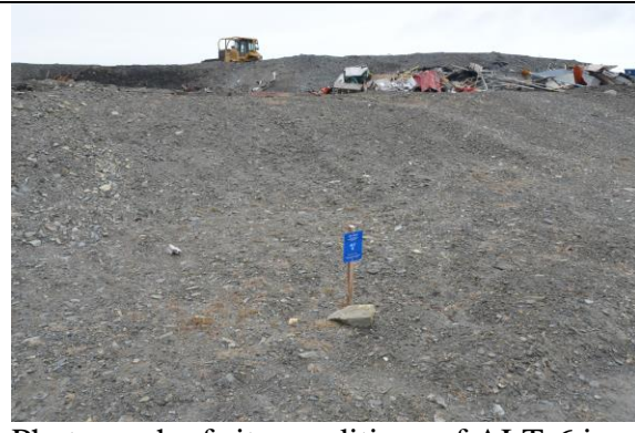
Photograph of site conditions of ALT-6 in June 2017 to show dry conditions.