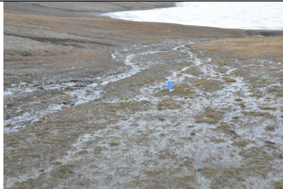
Photograph of site conditions of ALT-4 in June 2017 to show melt conditions.

The Department of National Defence was successful in collecting and analyzing samples at Monitoring Program Station ALT-4, during the period of runoff in June 2017. Unfortunately, there were no water to sample at ALT-5, 6, and 7 for analytical results. Analytical Results for ALT-4, are attached in Appendix E.