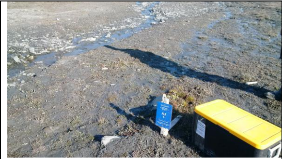
Photograph of site conditions of ALT-4 in July 2017 showing surface flow; water samples were obtained.

Only one Monitoring Program Station (ALT-4) could be sampled in July (picture attached). ALT-5-6-7 showed dry conditions that prevented any water samples to be collected for analysis. Analytical Results for ALT-4 is attached in Appendix F.