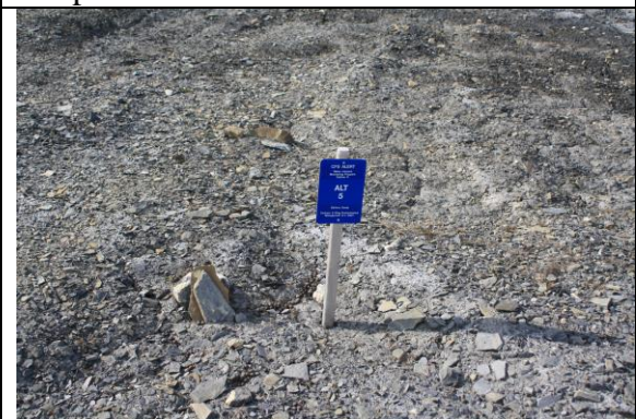
Photograph of site conditions of ALT-5 in July 2017 to show dry conditions.