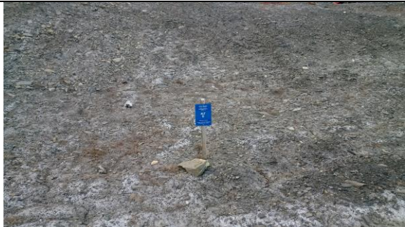
Photograph of site conditions of ALT-6 in July 2017 to show dry conditions.