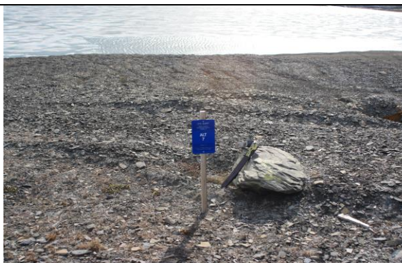
Photograph of site conditions of ALT-7 in July 2017 to show dry conditions.