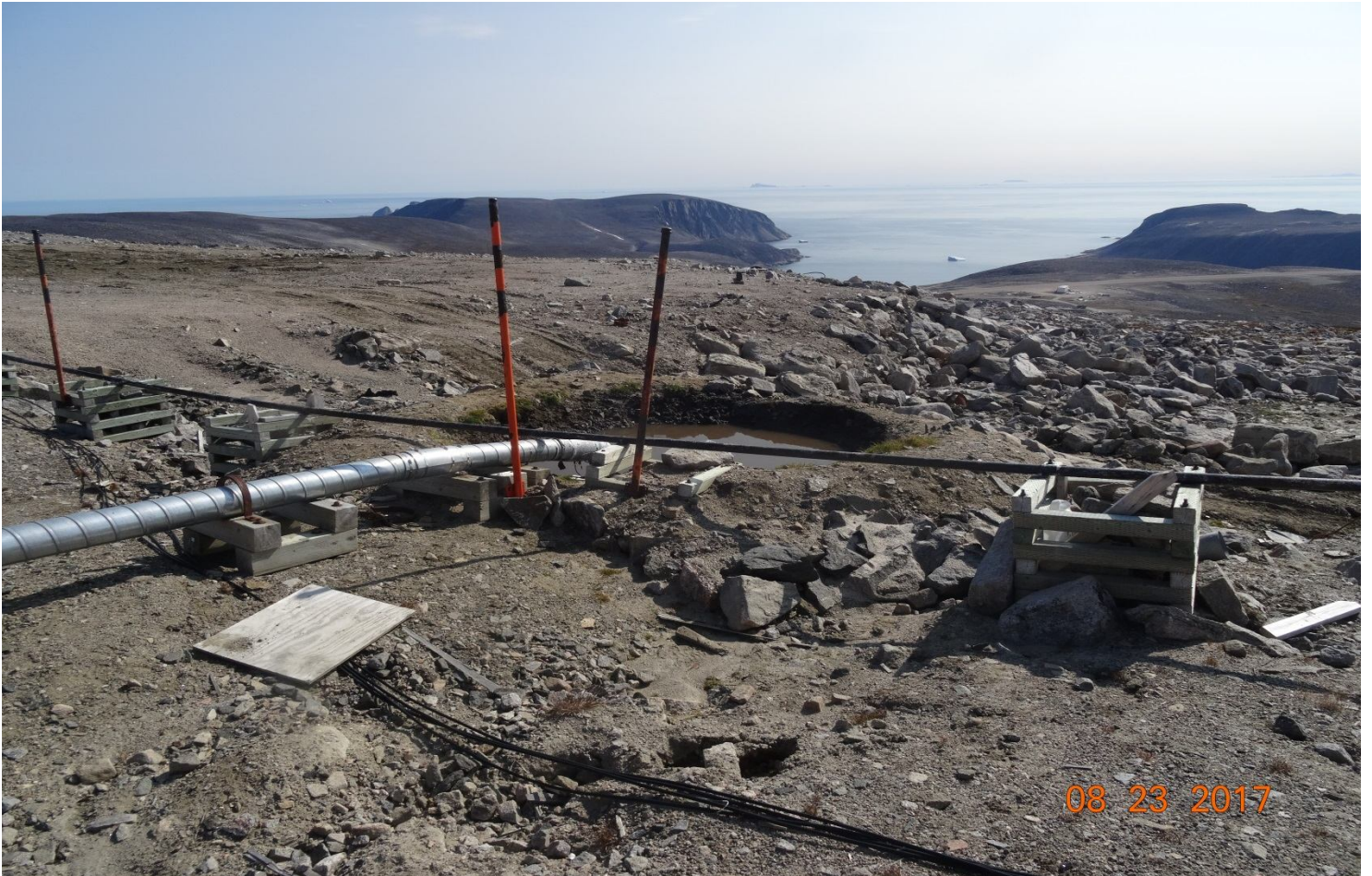
Figure 1: Sewage disposal facility