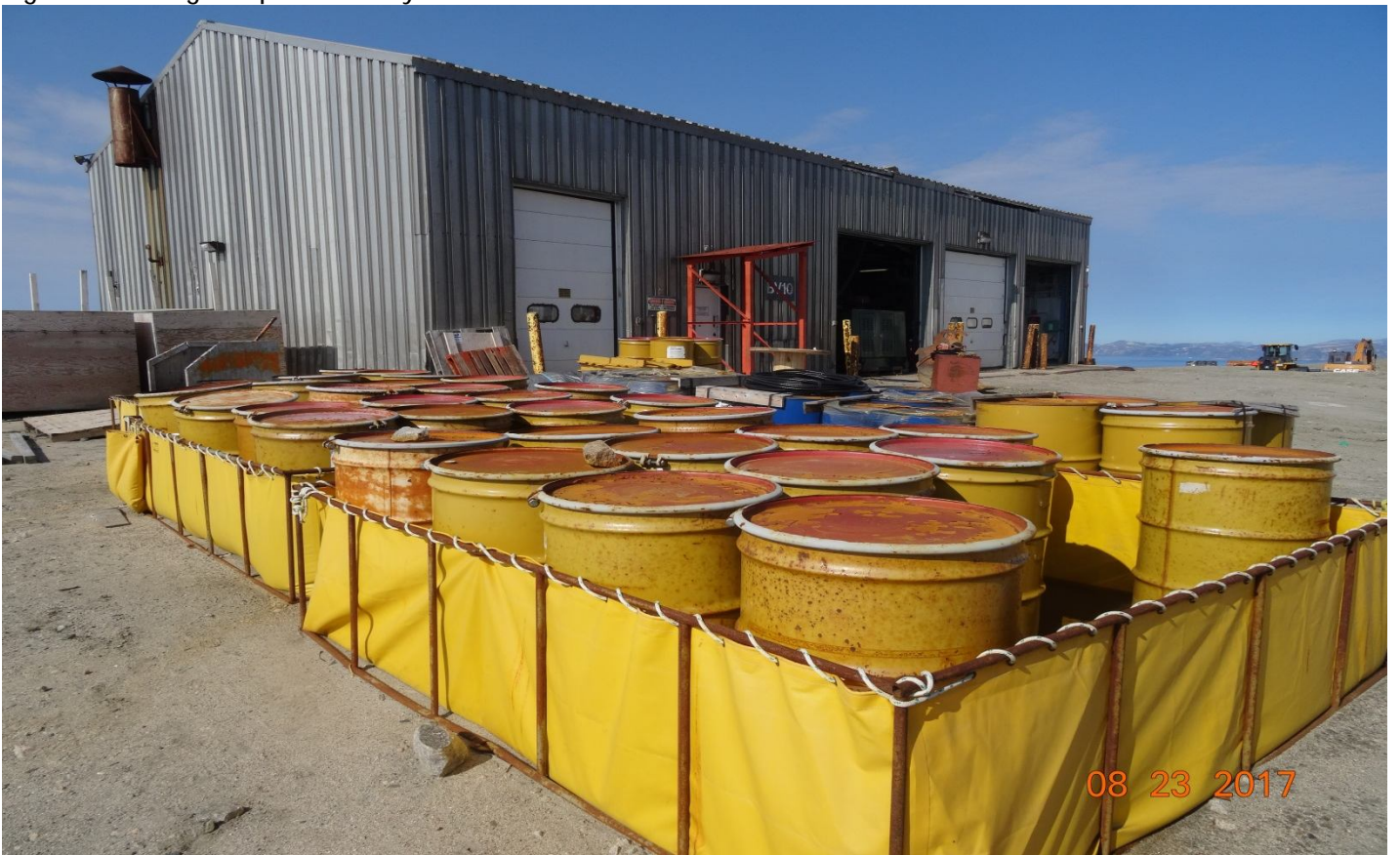
Figure 2: Hazardous waste storage