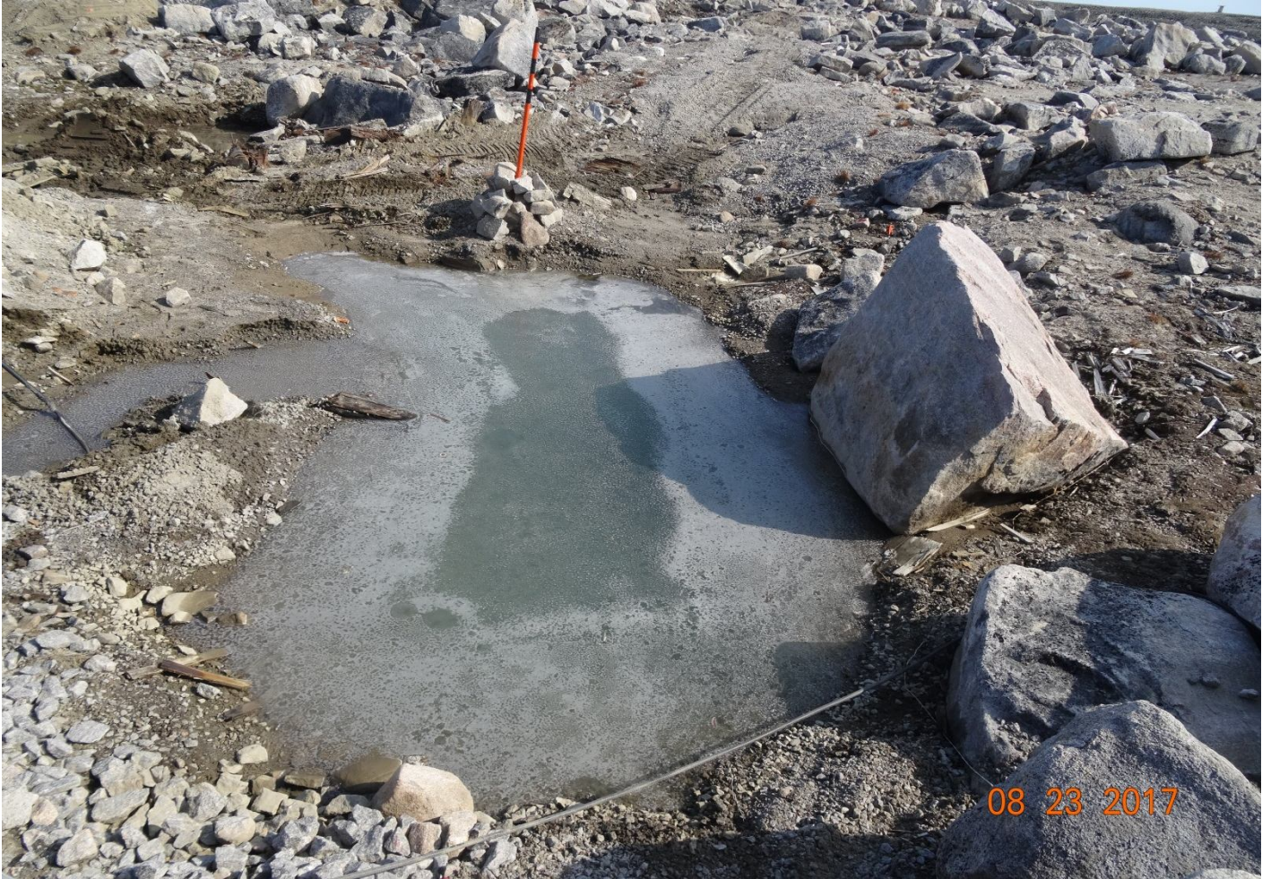
Figure 4: Hydrogen peroxide treatment.