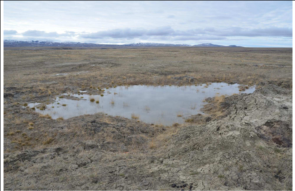
ERK-4 in July 2013 showing water sampling site.