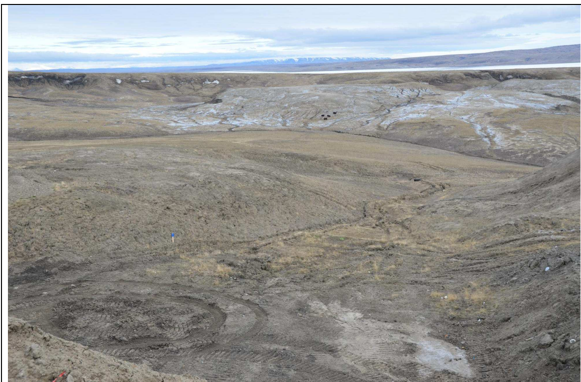
ERK-3 in July 2013 showing dry conditions.

The summer 2013 CFS Eureka crew departed the station at the end of July, ending the CFS Eureka operation for the year.