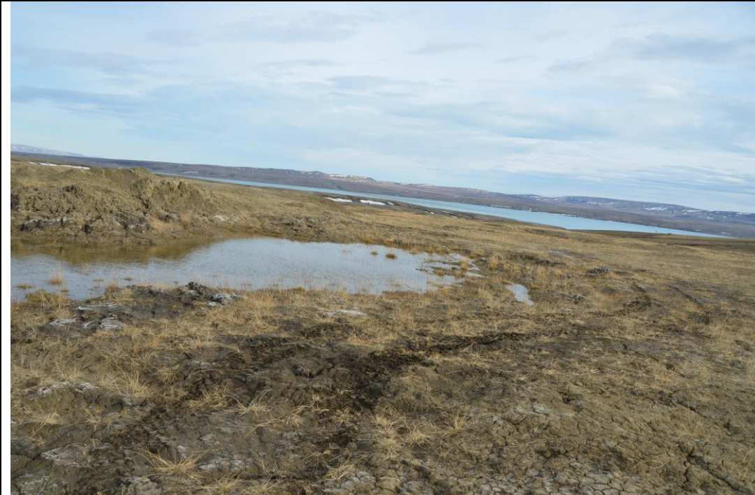
ERK-4 in June 2016 showing wet conditions; water samples were collected.