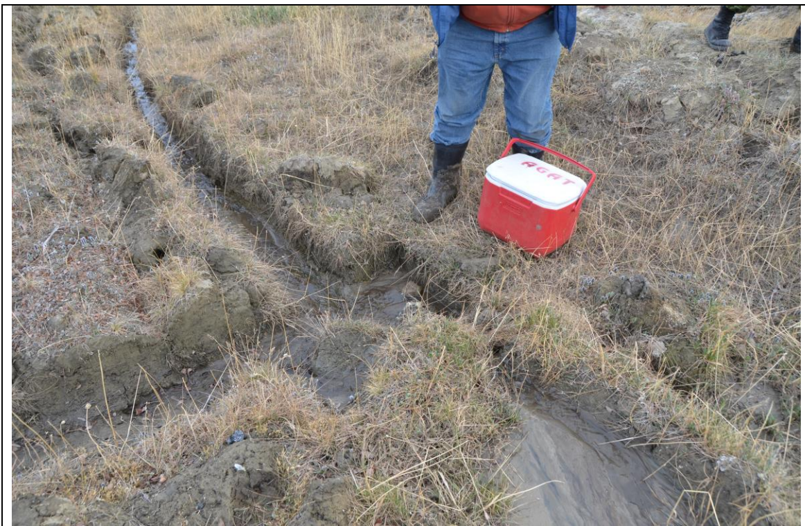
ERK-3 in June 2016 showing wet conditions; water samples were collected.

In 2016, CFS Eureka was only open for one month (June).