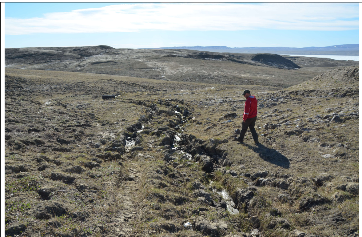
ERK-3 in July 2018 showing wet conditions; water samples were collected.

In 2018, CFS Eureka was only open from mid-June to mid-July.