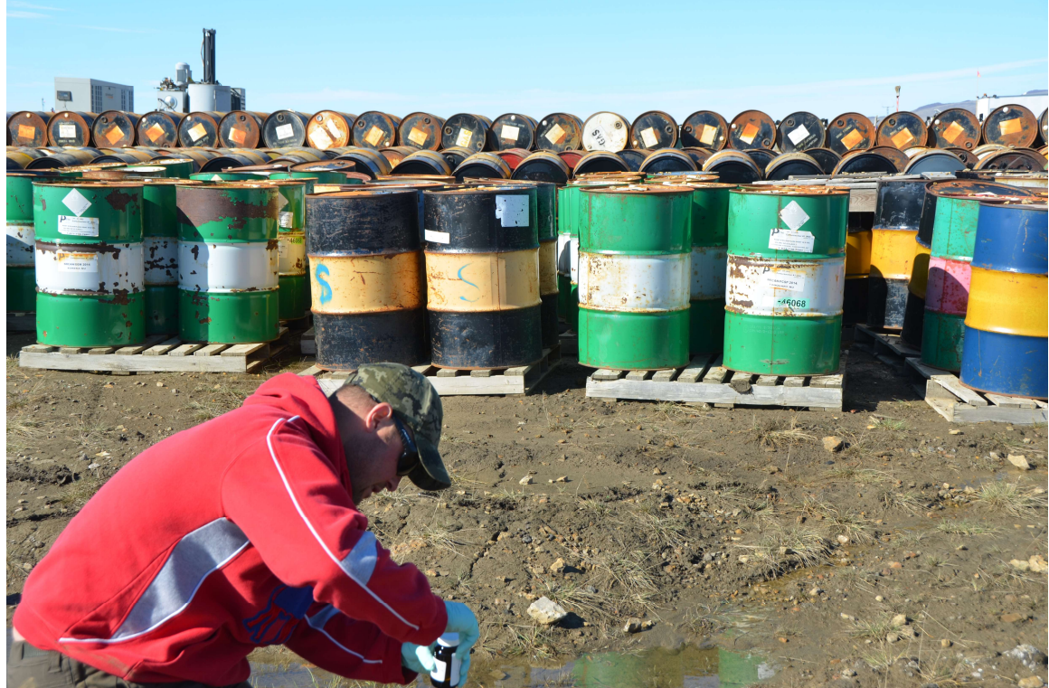
ERK-5 in July 2018 showing wet conditions; water samples were collected.