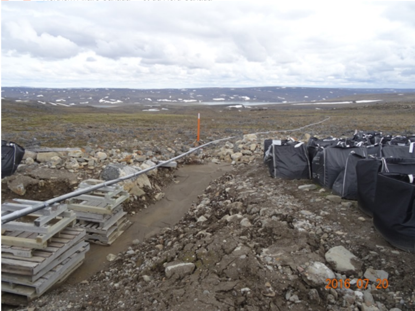
Figure 17 2009-341 (2)