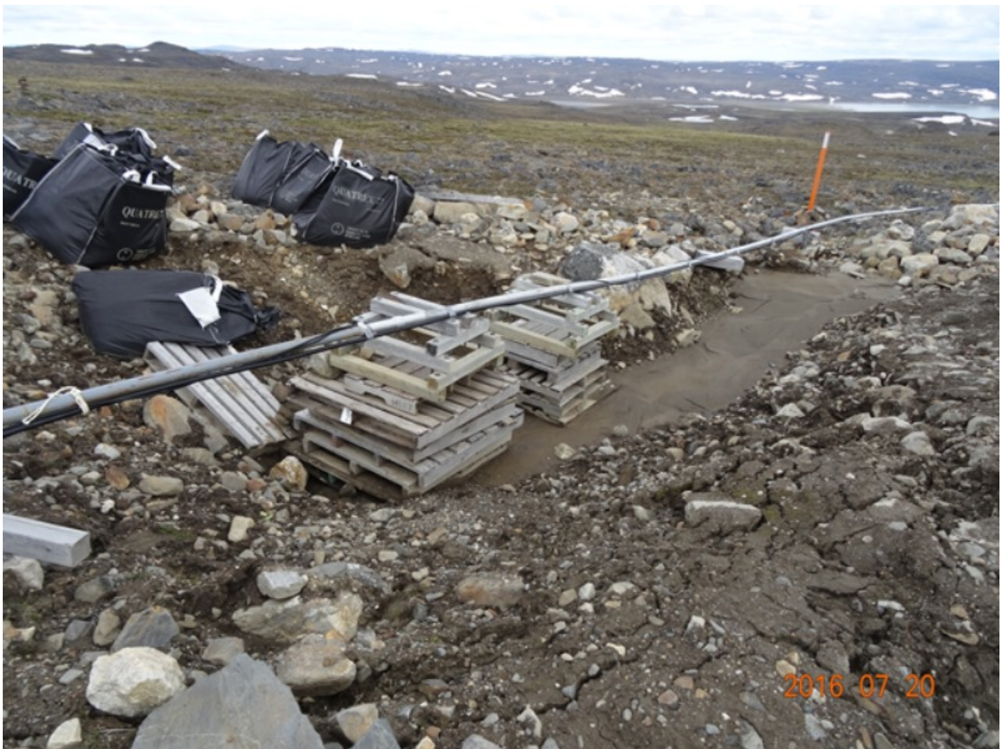
Figure 16 2009-341.