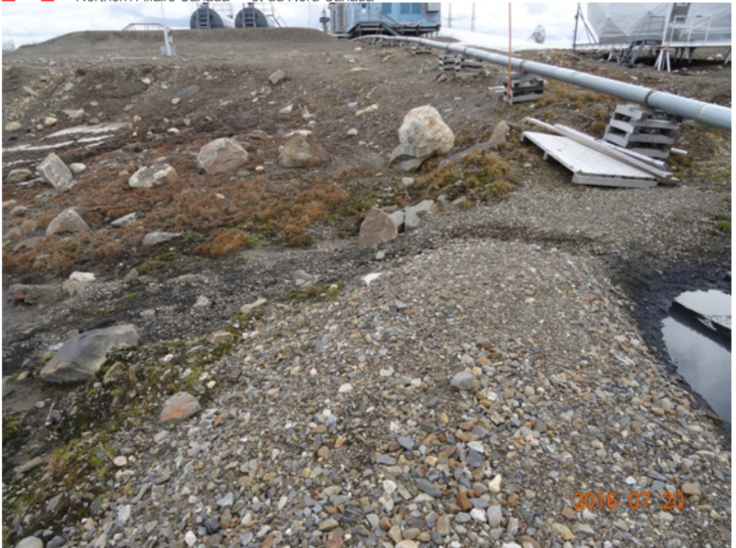
Figure 7 Effluent lagoon - signs of over topping and erosion