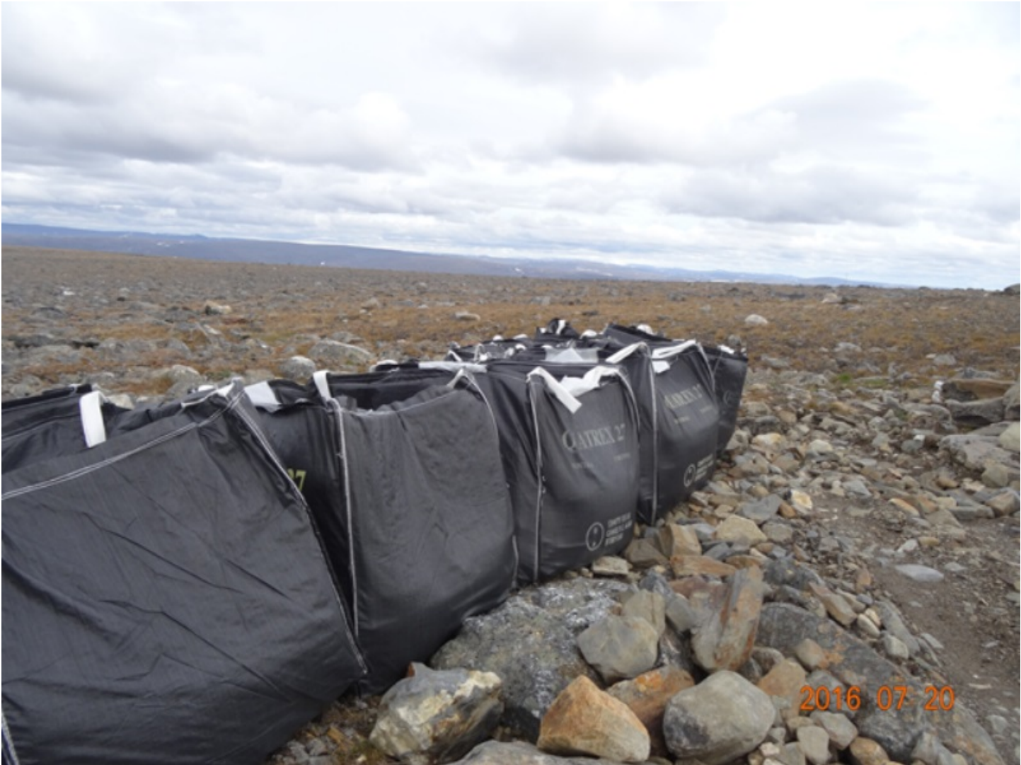
Figure 6 2013-145 - PHC soils 2