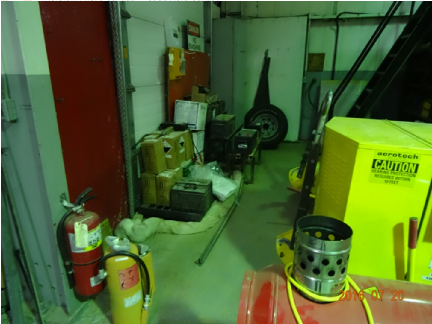
Figure 11 Garage - battery storage