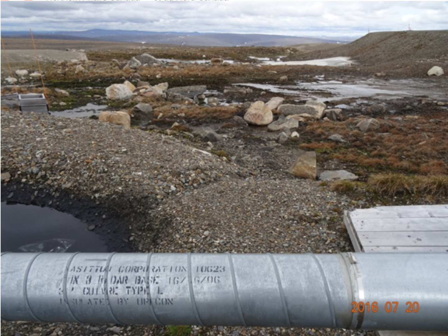
Figure 9 Effluent lagoon - over-topping