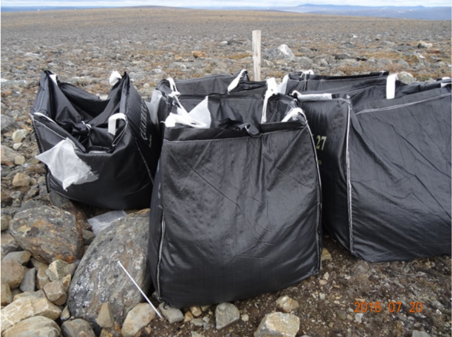
Figure 5 2013-145 - PHC soils