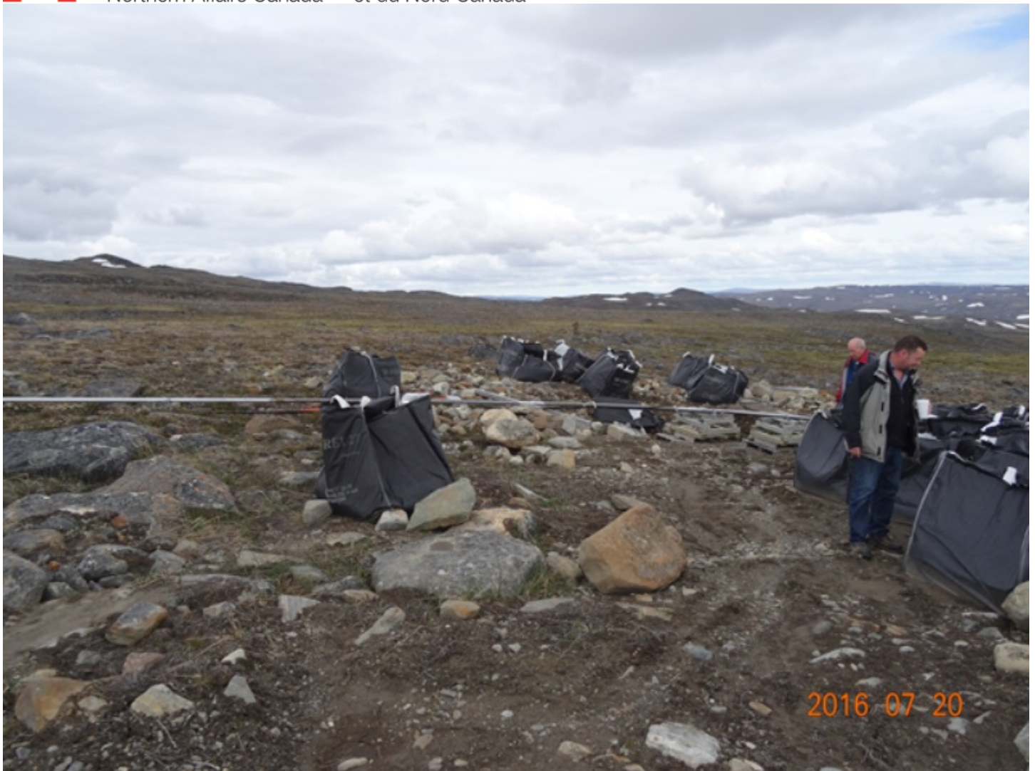
Figure 15 2009-341 - Clean up and remedial efforts on-going