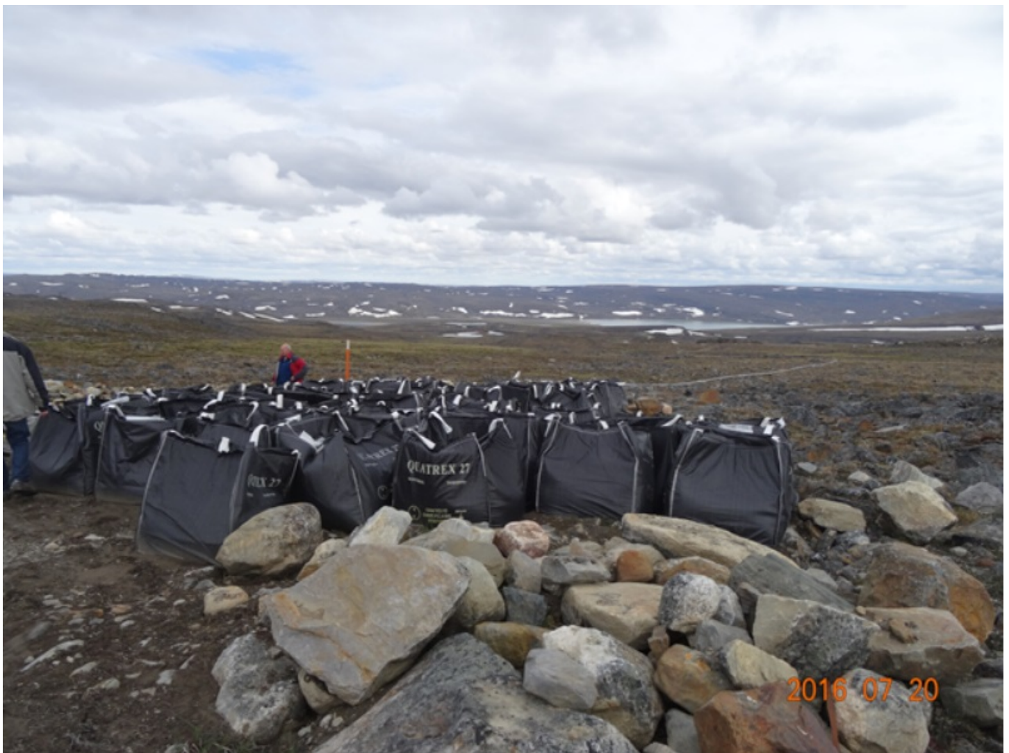
Figure 14 2009-341 - Quatrex bags of PHC soils on pipeline