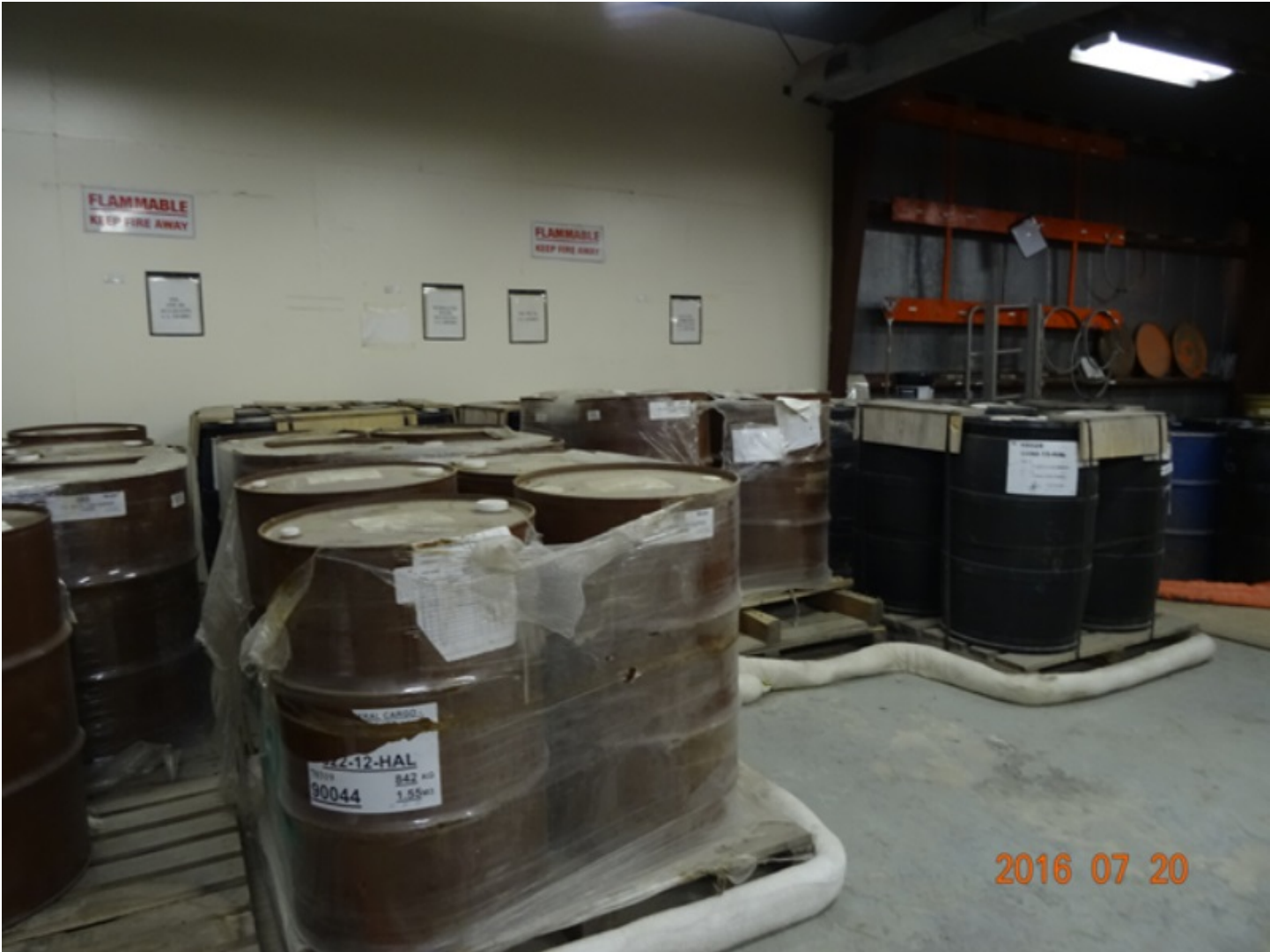
Figure 12 Hazardous waste and chemical storage area