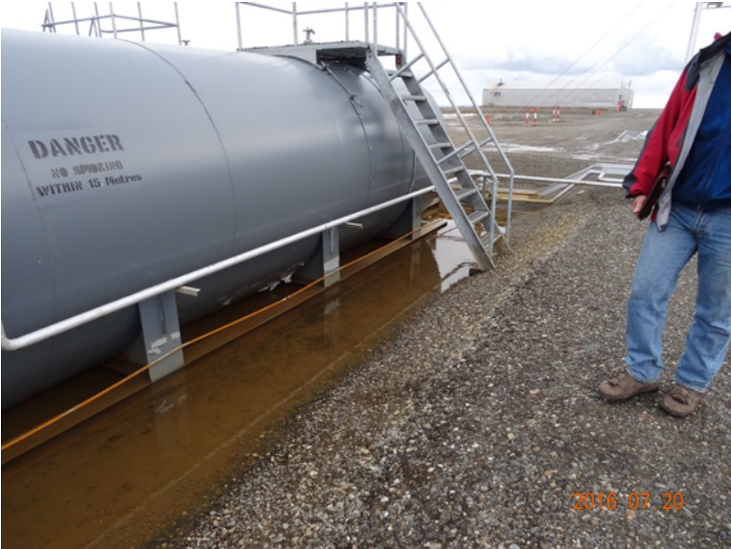
Figure 10 Summit bulk fuel storage