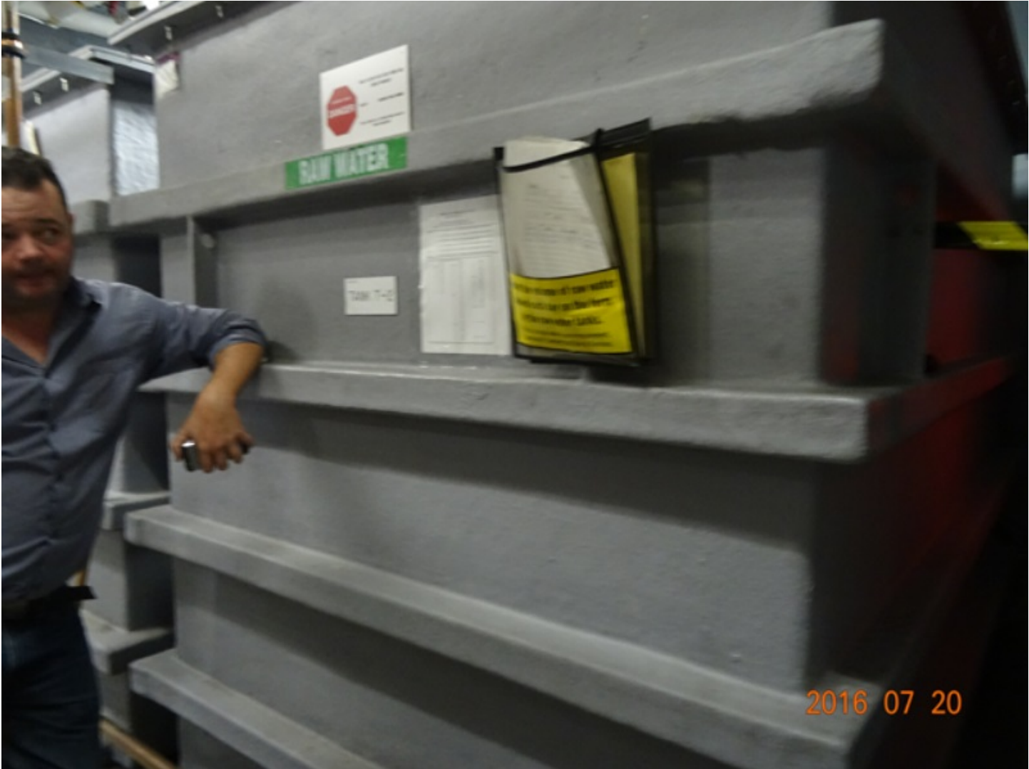
Figure 2 Water tanks in accommodation train