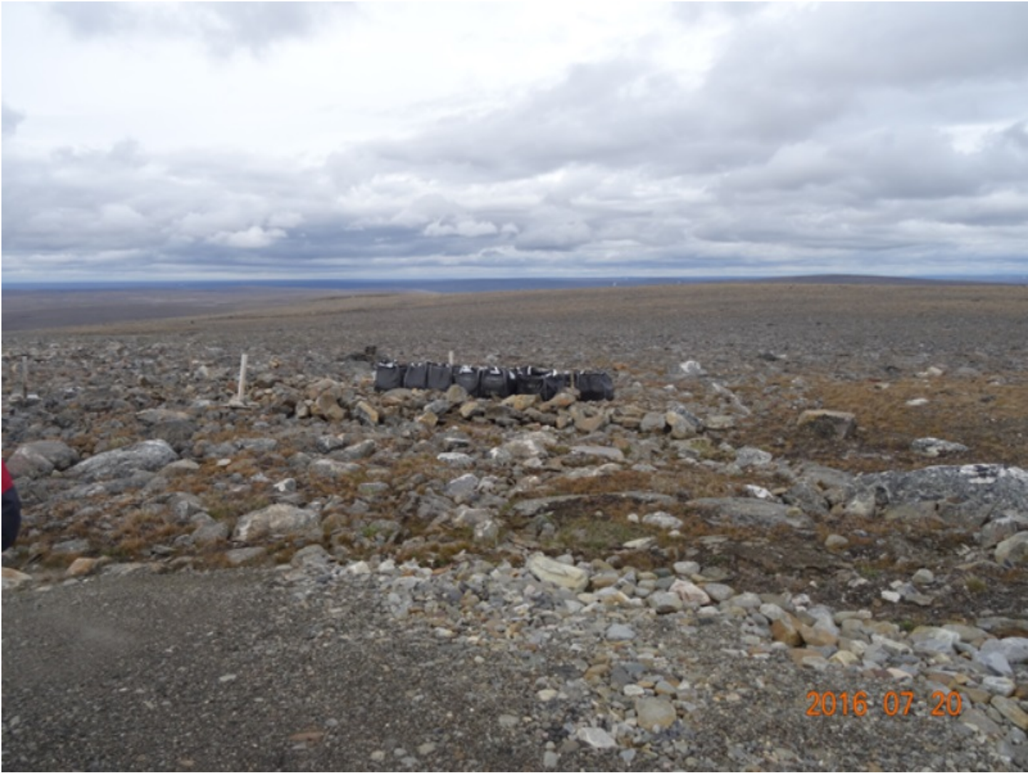
Figure 4 Site of 2013-145 Quatrex Bags of contaminated soils remain on site. Remedial work remain incomplete