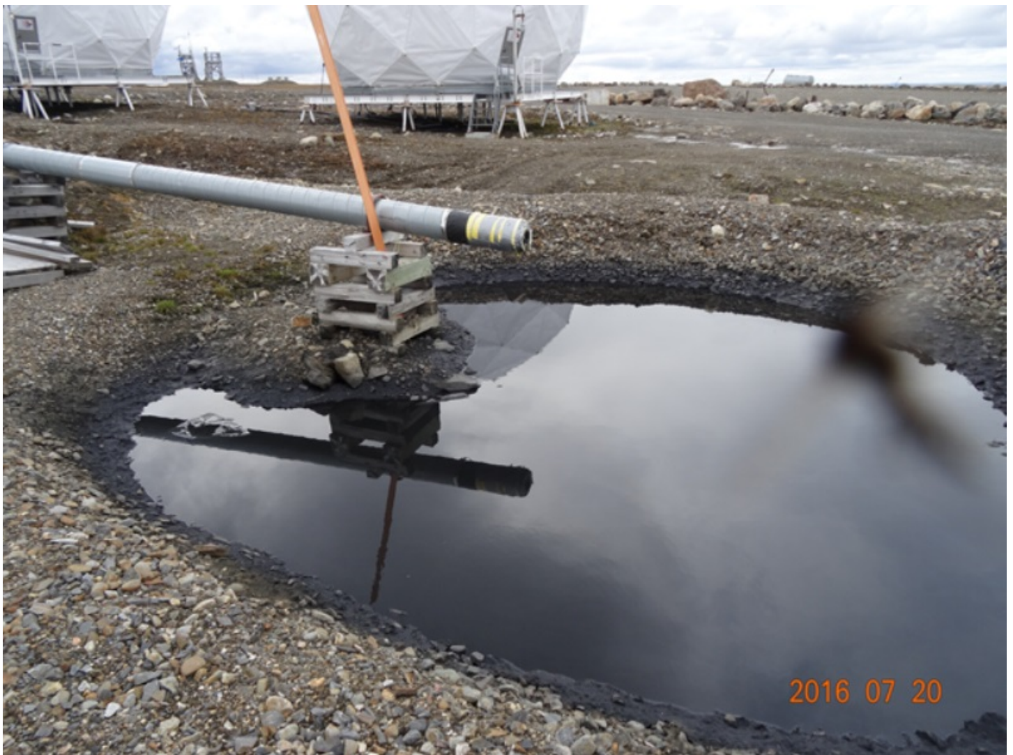
Figure 8 Effluent lagoon - very black color