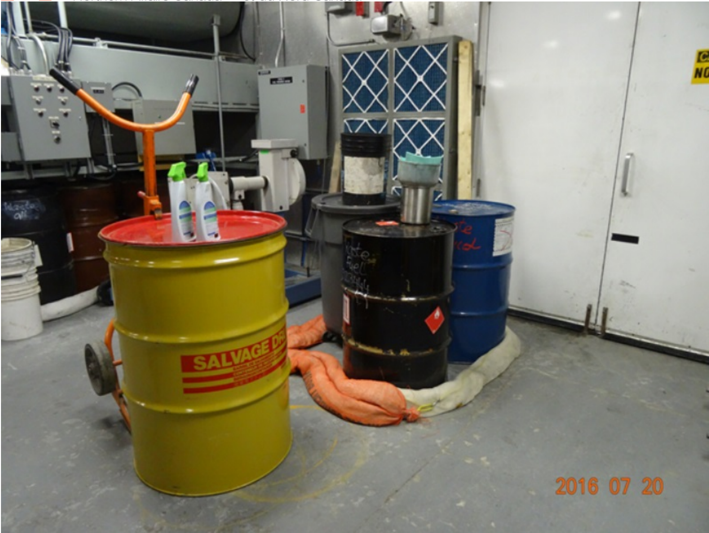
Figure 3 Chemical storage