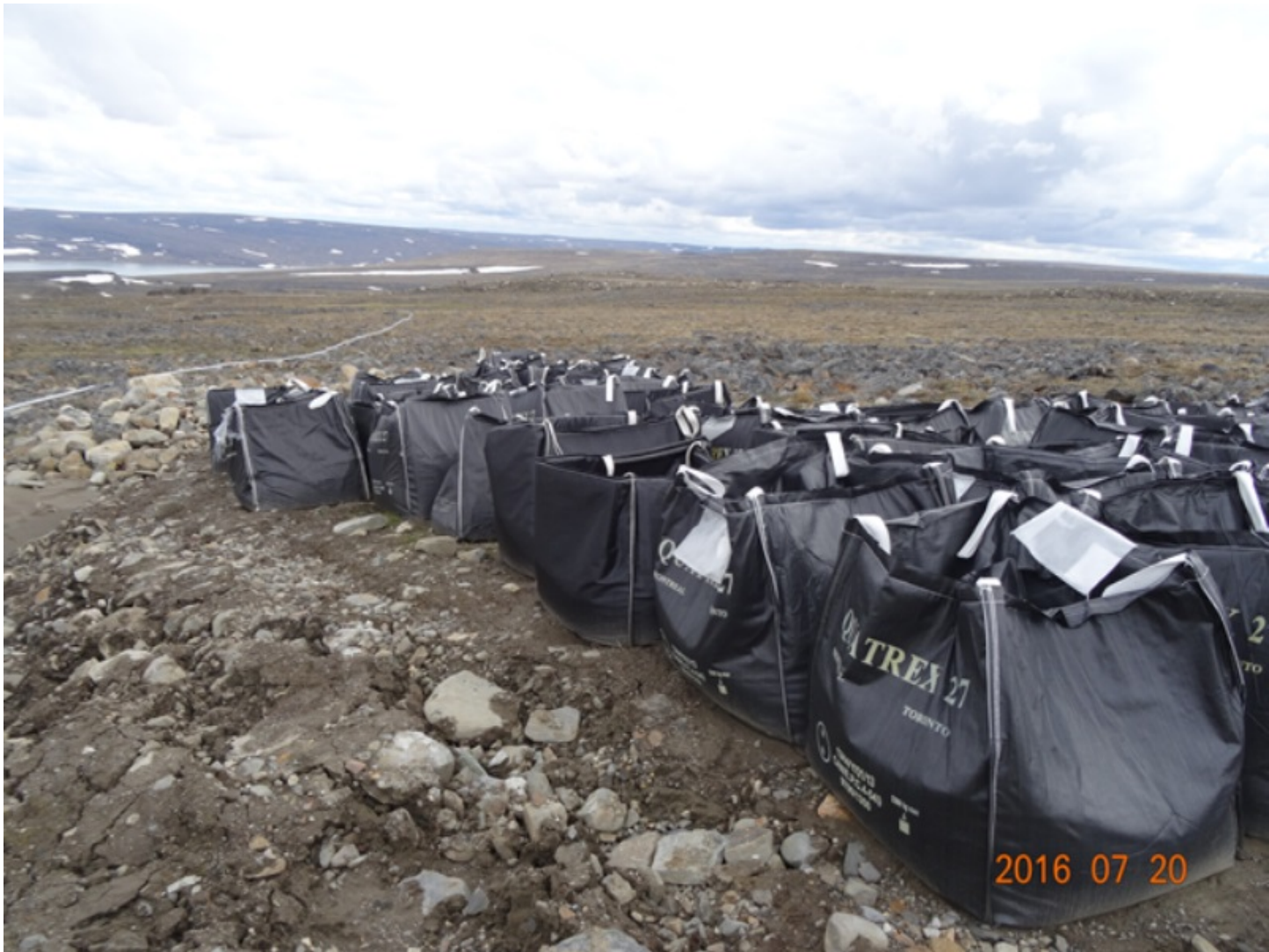
Figure 18 2009-341 Bags of PHC soils (2)