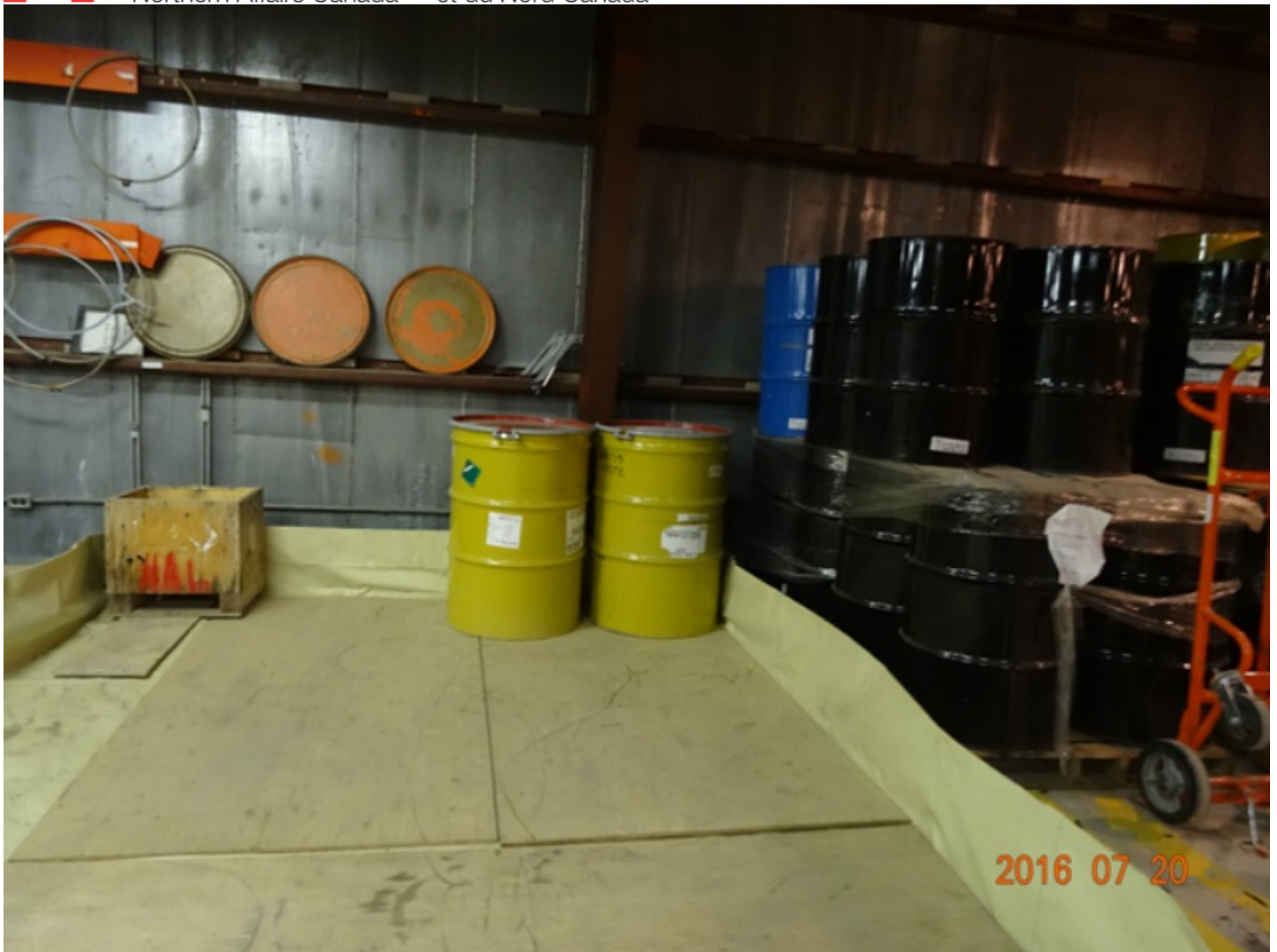
Figure 13 Haz waste marshalling and packaging area