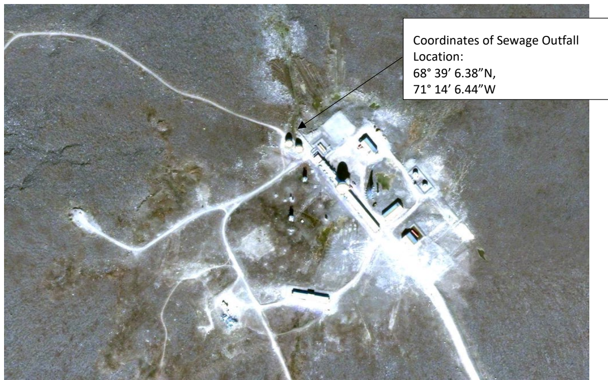
Figure B-2: Coordinates of Sewage Outfall Location: 68° 39' 6.38"N, 71° 14' 6.44"W