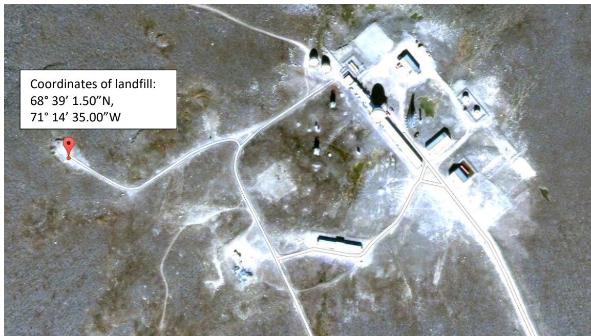
Figure B-1: Coordinates of landfill: 68° 39' 1.50"N, 71° 14' 35.00"W