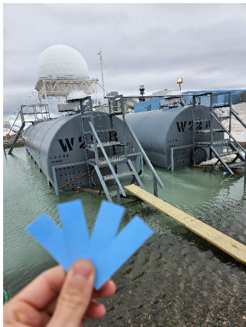
Photo E 1: Hydrocarbon test strips used in berm of tanks W22A & W22B (10-Jul-2023)