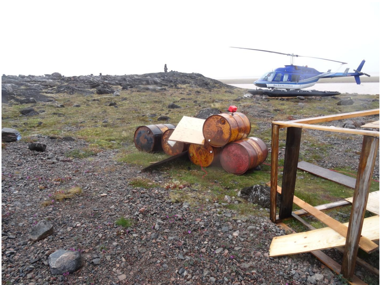
Figure 5. Old (full) fuel barrels at Perry River cabin.