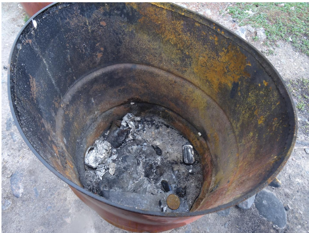
Figure 2. Burn barrel at Karrak Lake used for 'burnable' waste.