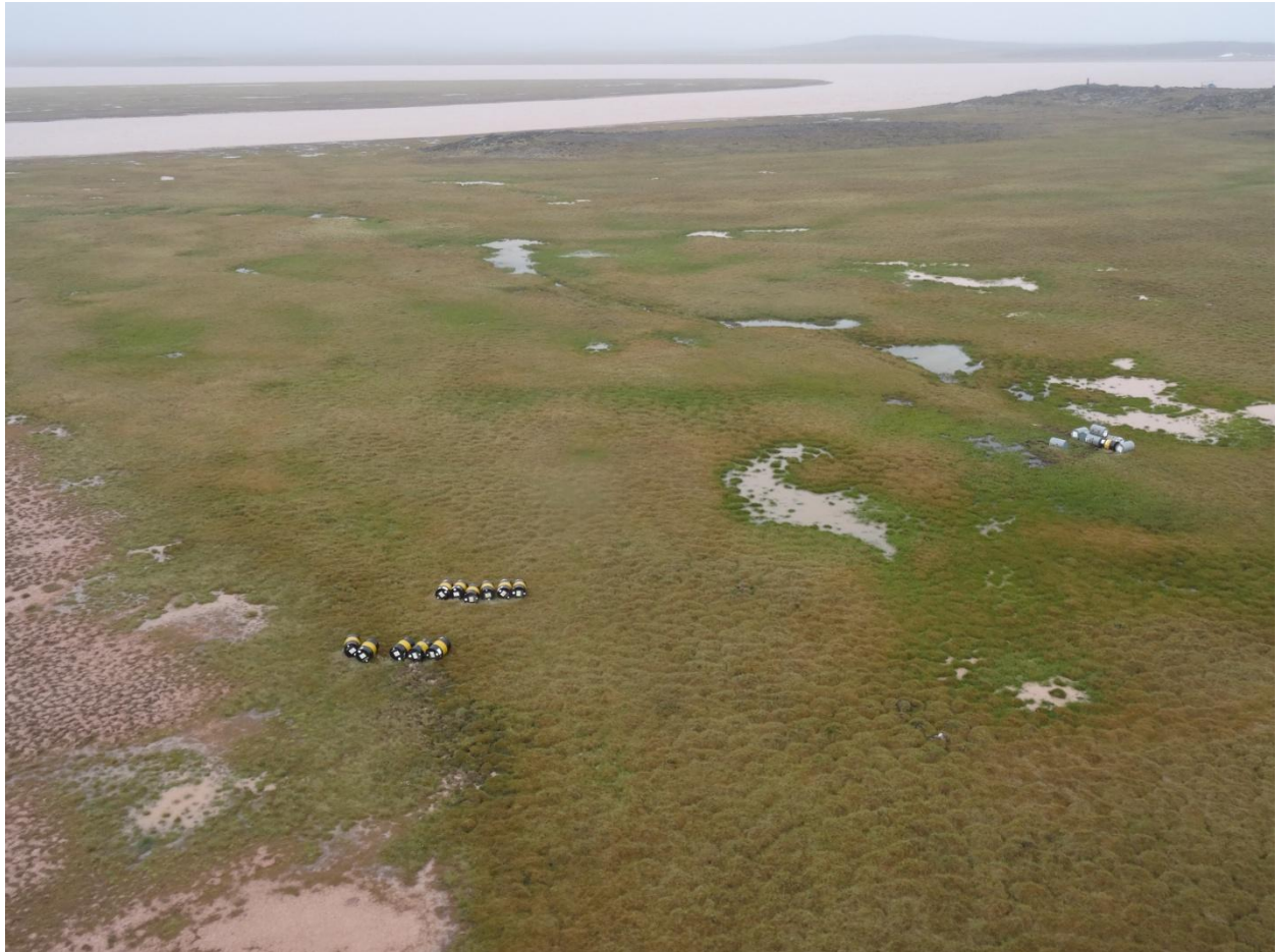
Figure 9. Fuel cache south of Perry River cabin.