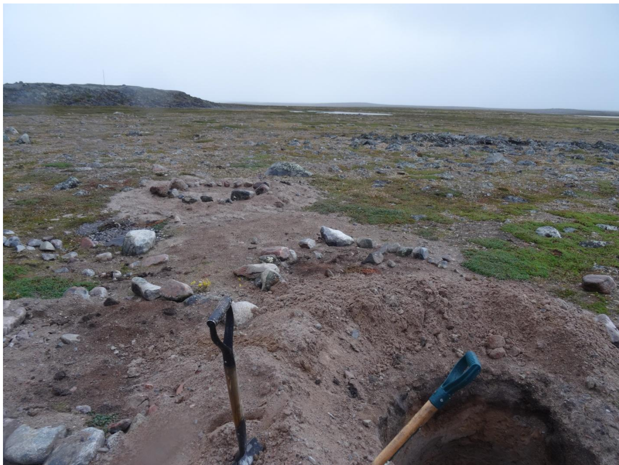
Figure 1. Compost pits at Karrak Lake shown, rock outlines denotes past pits. One or two added each year.