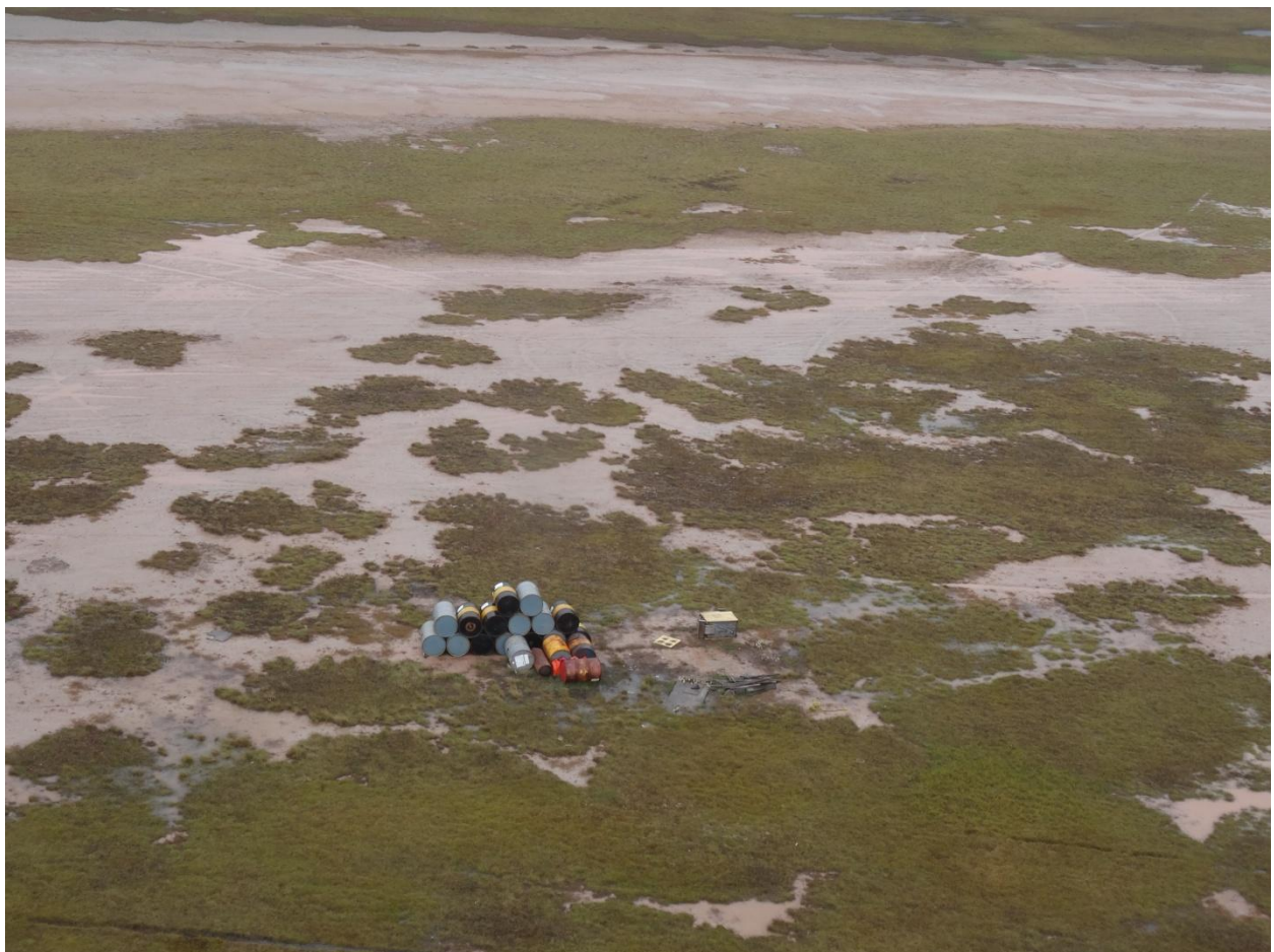
Figure 8. Fuel cache at airstrip across from Perry River cabin.