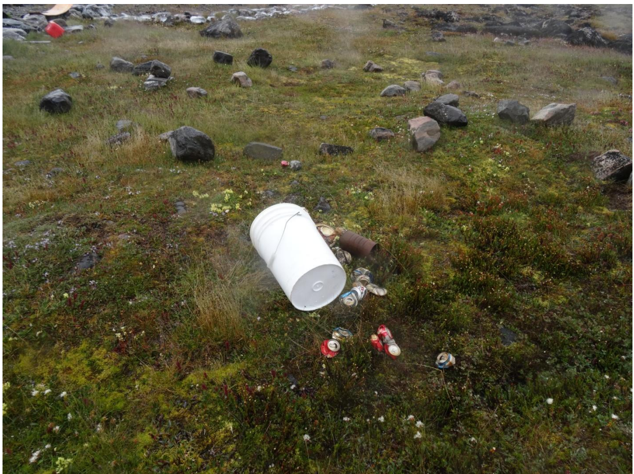
Figure 4. Litter at Perry River cabin.