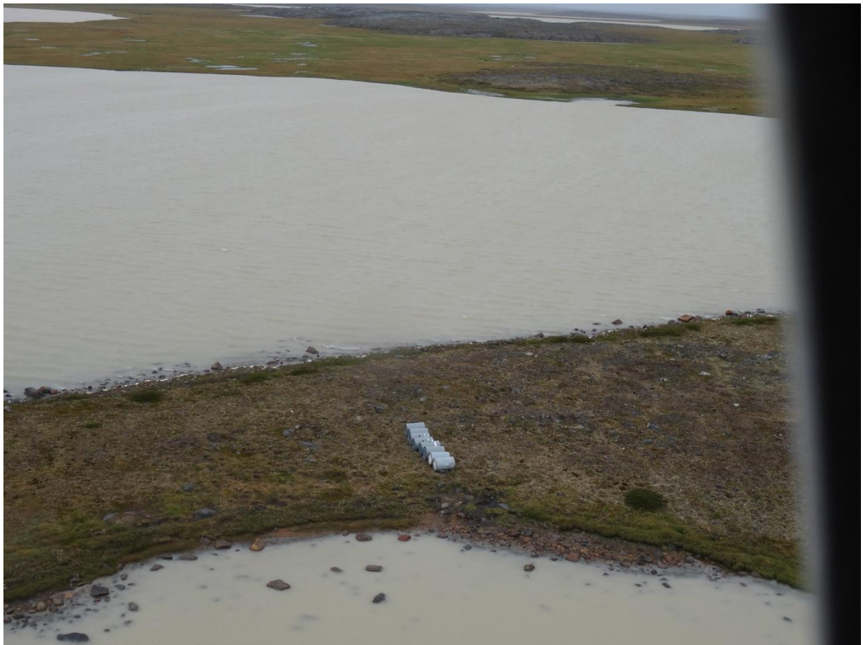
Figure 7. Fuel cache (A) located on a narrow peninsula. Barrels are now empty, however, the choice of site is contrary to the project's authorizations.