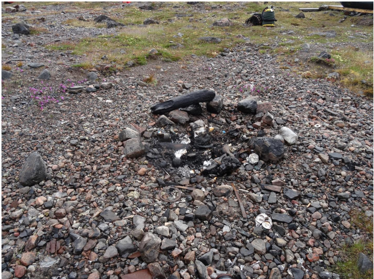
Figure 6. Burn site at Perry River cabin.