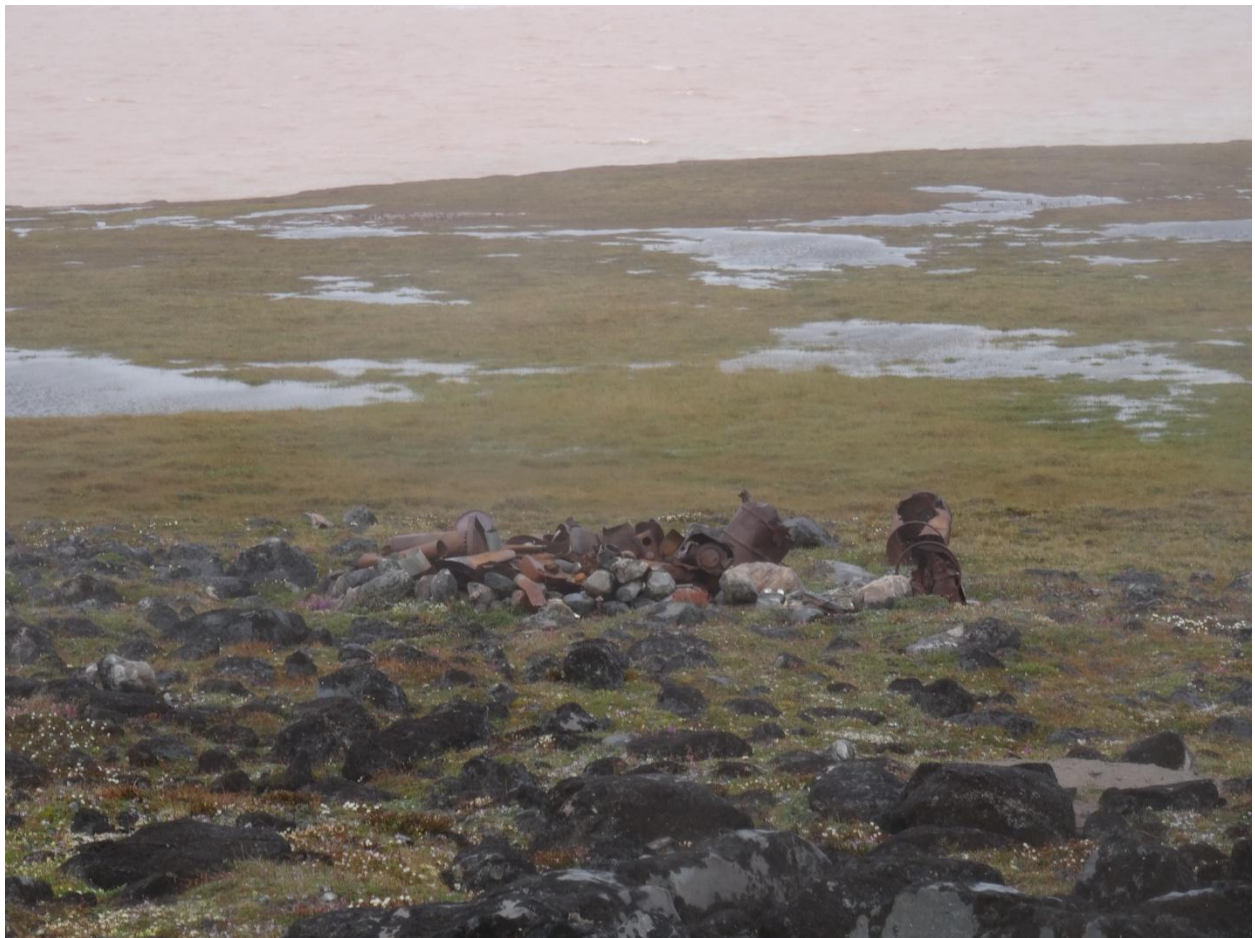
Figure 3. Old waste metal at Perry River cabin.