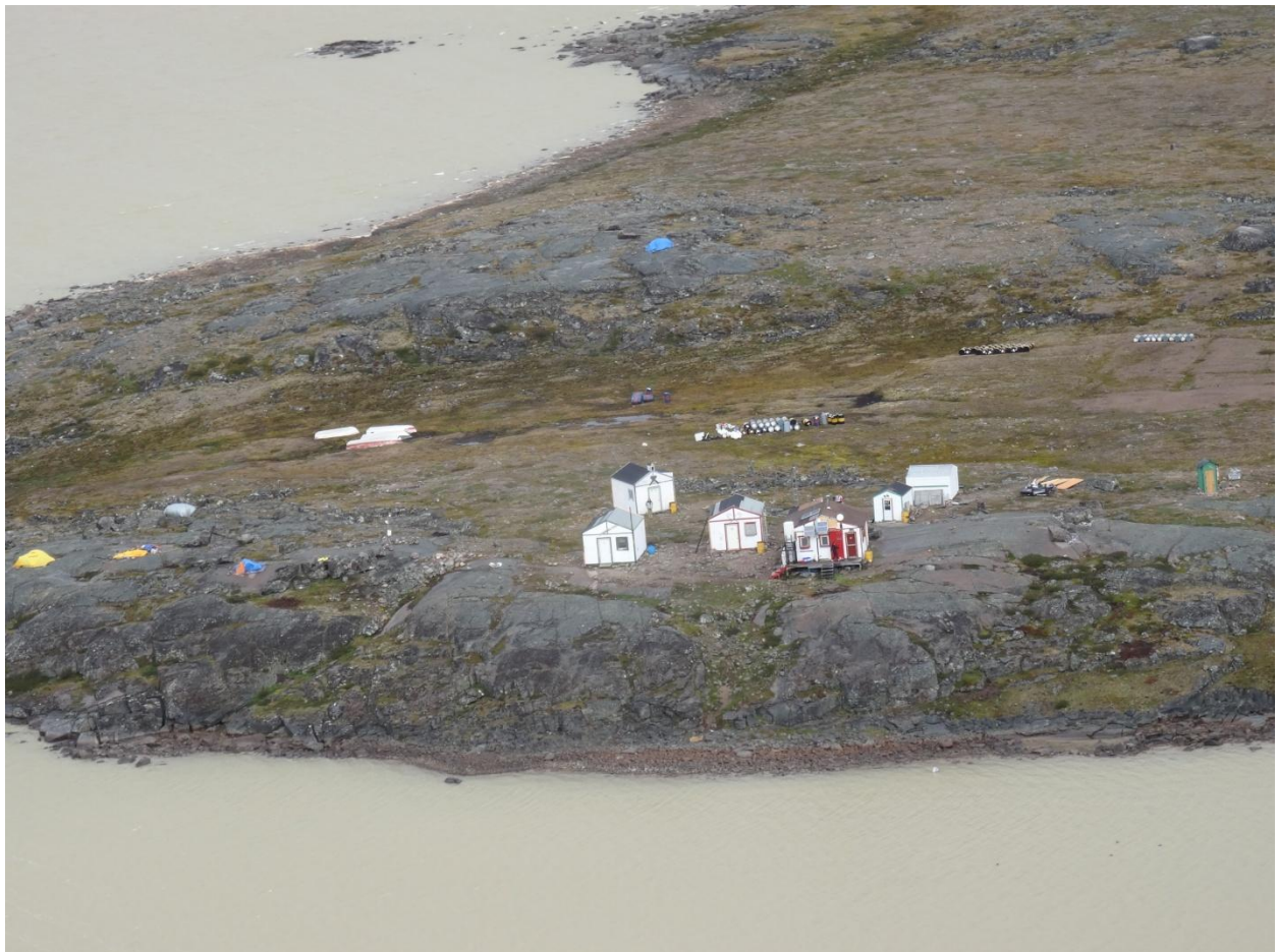
Figure 10. Karrak Lake camp and fuel cache.