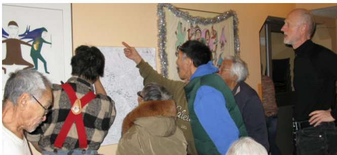
Working with map on wall, pointing out travel routes.