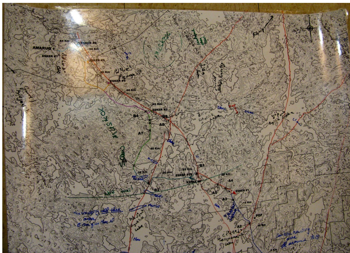
Image 6. Annotated northern portion of Figure 1 with place names, camps and points of interest as described by the elders