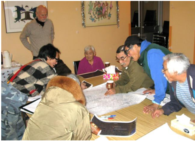
Stories of travel based on map.