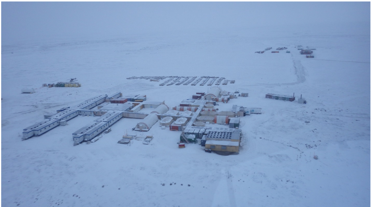
Amaruq camp, October 2016