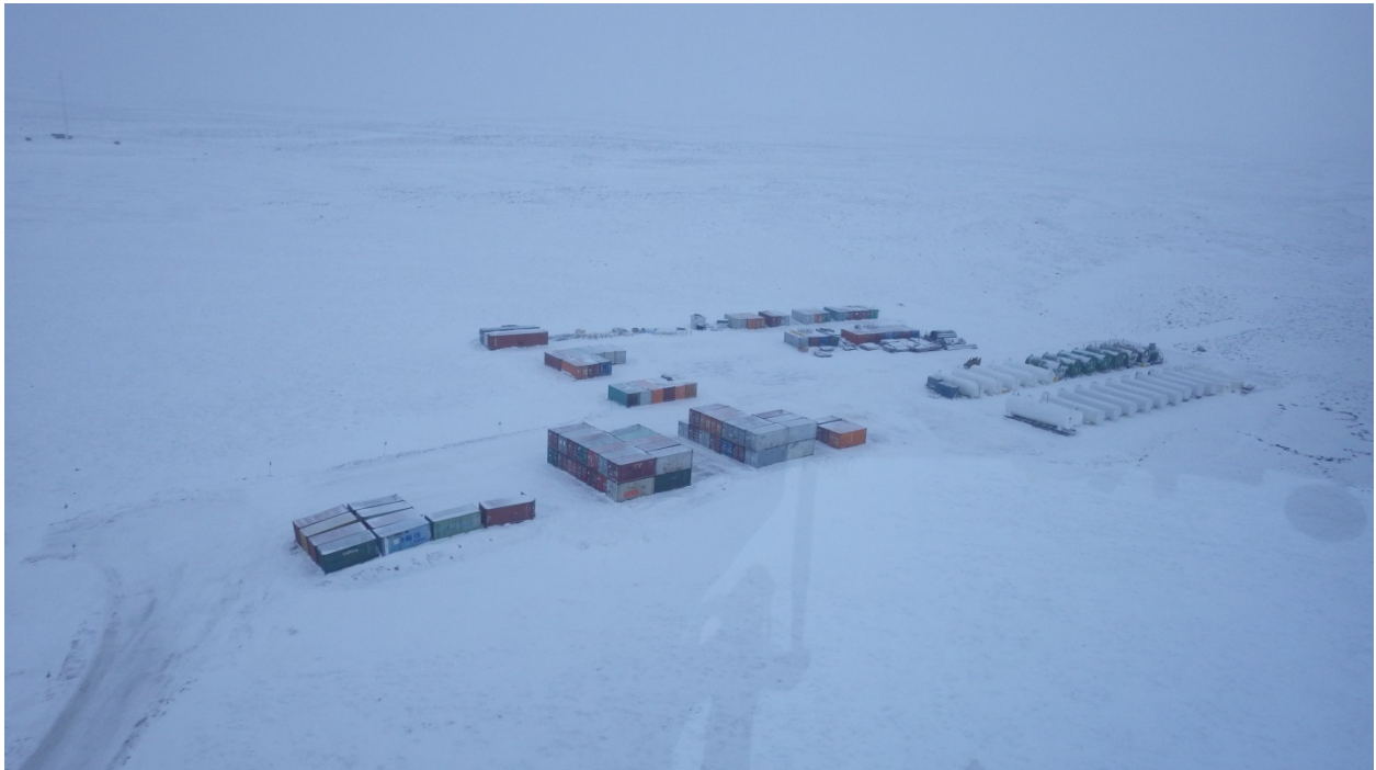
Amaruq fuel farm and sea cans storage, October 2016