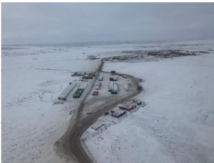
Amaruq fuel storage and camp site, November 2017