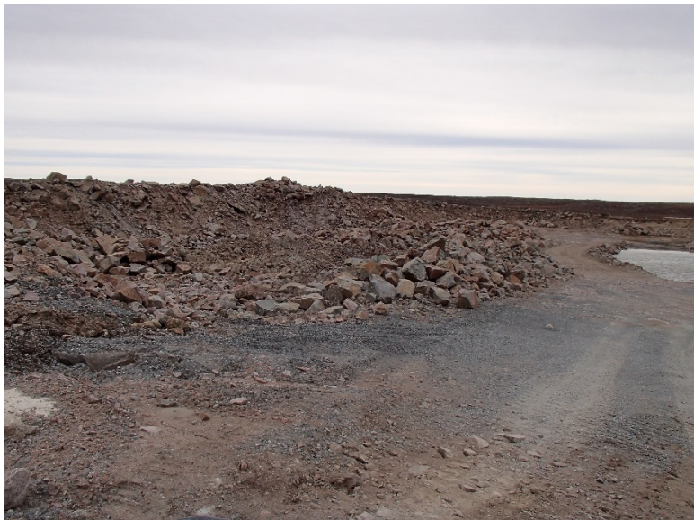
Photograph F2-3 Eskers and Quarries 2 – km 25+000