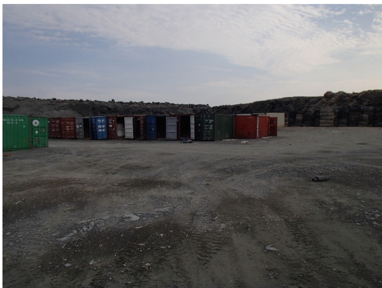
Photograph F1-48: Quarry 23 (Airstrip Quarry)

Description: Looking at the north wall. Presence of loose rocks along steep wall.