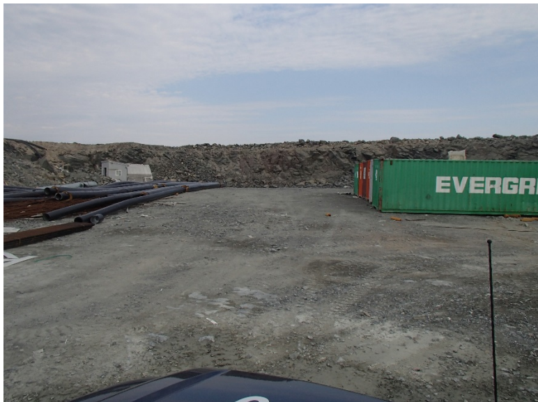
Photograph F1-47: Quarry 23 (Airstrip Quarry)