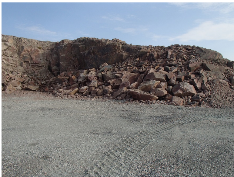
Photograph F1-38: Quarry 19 – km 84+300

Description: Looking at the north and west walls.