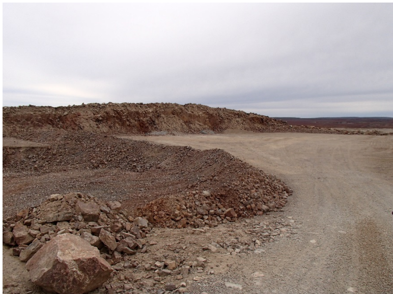
Photograph F2-1 Eskers and Quarries 1 – km 15+000