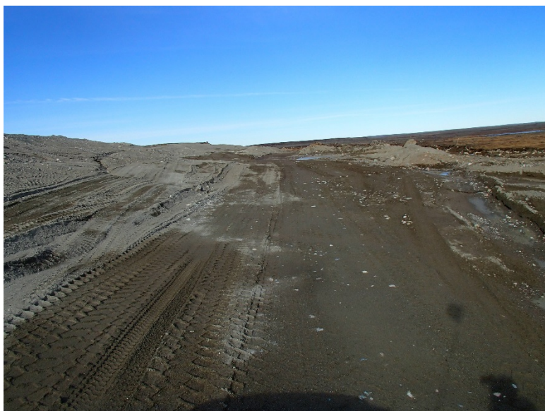
Photograph F2-8 Eskers and Quarries 4 – km 46+000

Description: View of the rock quarry at km 35. Unstable walls subject to rockfalls.