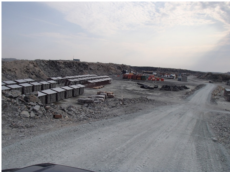
Photograph F1-45: Quarry 23 (Airstrip Quarry)