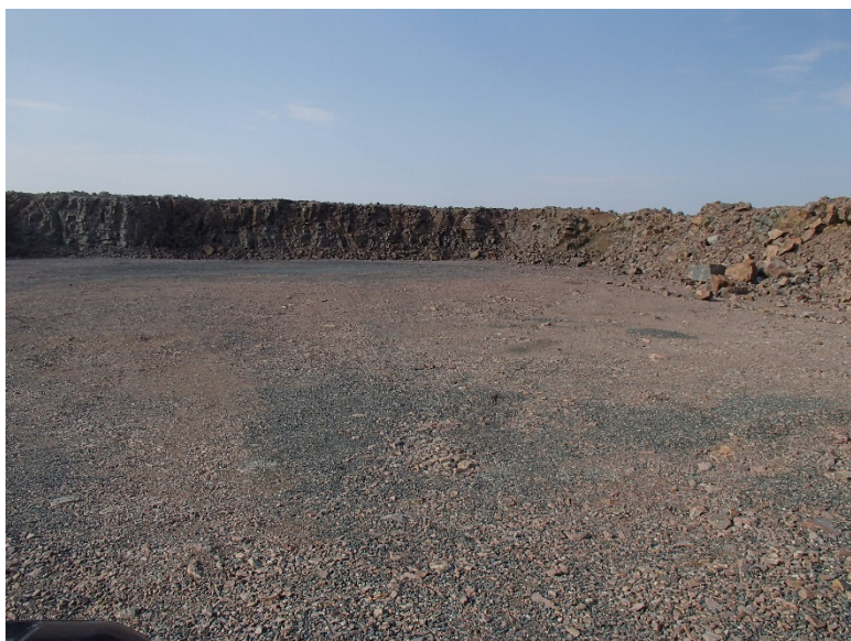
Photograph F1-42: Quarry 21 – km 93+400

Description: Looking at the south and east walls.