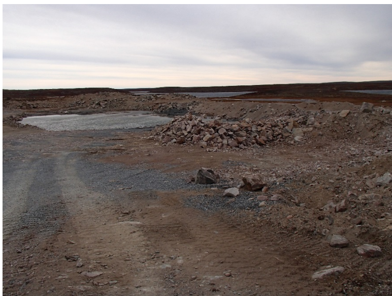
Photograph F2-4 Eskers and Quarries 2 – km 25+000

Description: View of esker #2. General good condition but some steep walls and loose rocks.