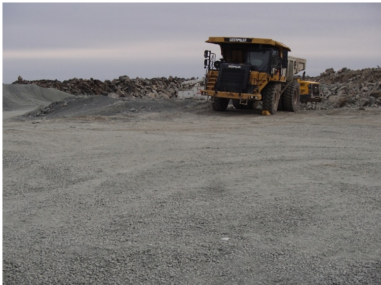
Photograph F2-7 Eskers and Quarries 3 – km 35+000