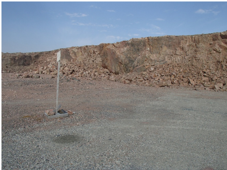
Photograph F1-37: Quarry 19 – km 84+300