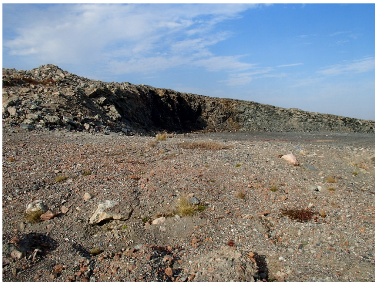
Photograph F1-35: Quarry 18 – km 80+200