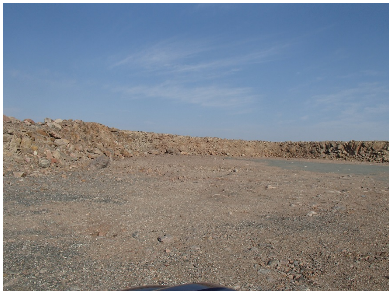
Photograph F1-39: Quarry 20 – km 89+550