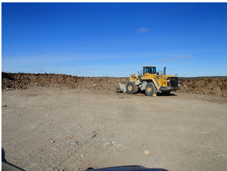
Photograph F2-14 Eskers and Quarries 6 – km 62+000

Description: View of the rock quarry at km 52. In good conditions with loose blocks on the north wall.