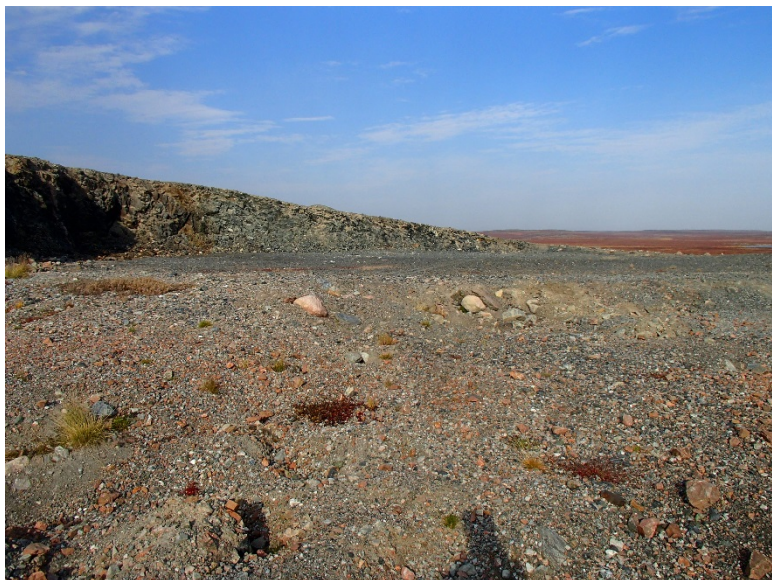
Photograph F1-36: Quarry 18 – km 80+200