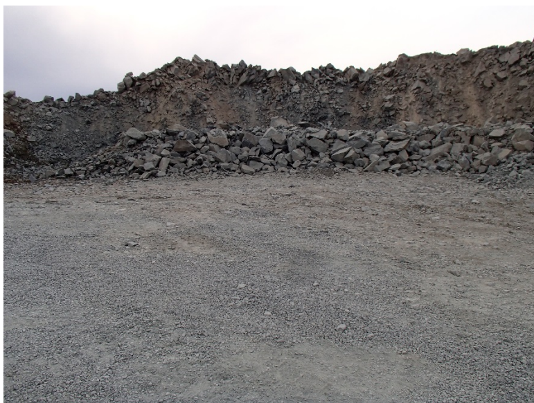
Photograph F2-6 Eskers and Quarries 3 – km 35+000

Description: View of the rock quarry at km 35. Unstable walls subject to rockfalls.