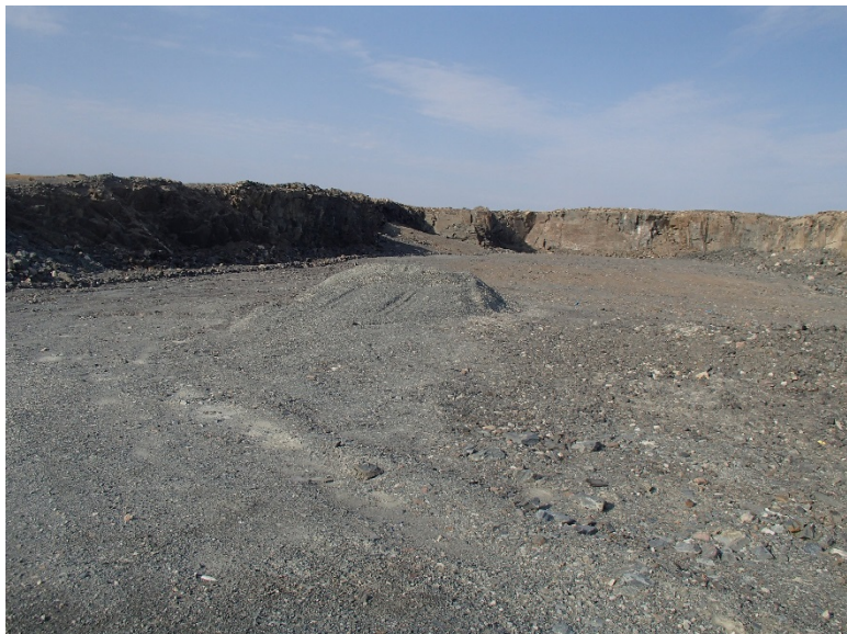
Photograph F1-43: Quarry 22 – km 99+200