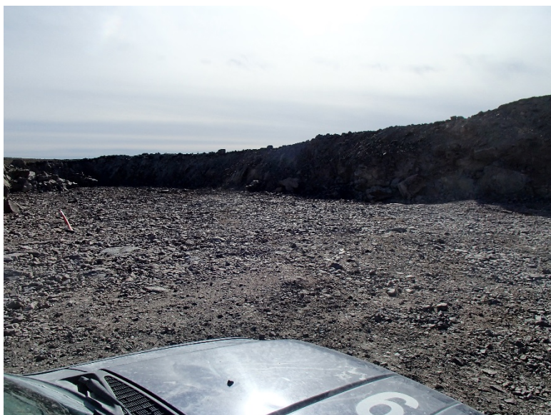
Photograph F2-12 Eskers and Quarries 5 – km 52+000

Description: View of esker #3. The 2-m high steep soil slopes are unstable.