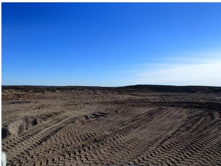
Photograph F2-16 Eskers and Quarries 6 – km 62+000

Description: View of esker #6C (north borrow pit). The 2-m high steep soil slopes are unstable.