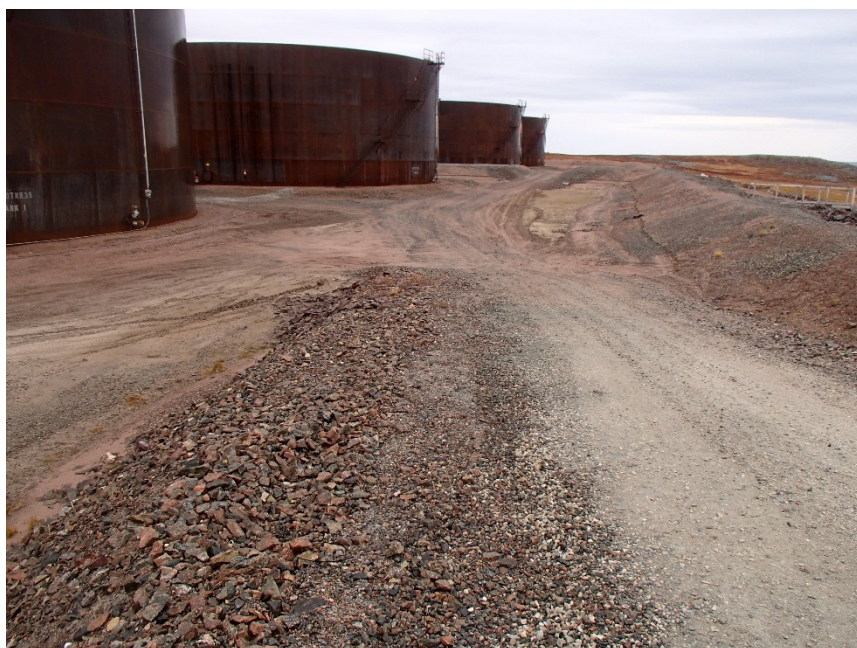
Photograph G1-1 Baker Lake Tank Farm