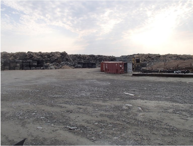
Photograph F1-49: Quarry 23 (Airstrip Quarry)