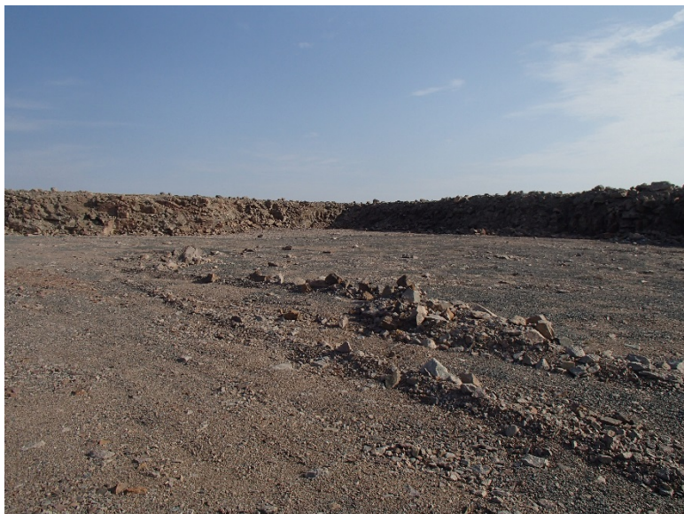
Photograph F1-40: Quarry 20 – km 89+550

Description: Looking at the north and west walls.