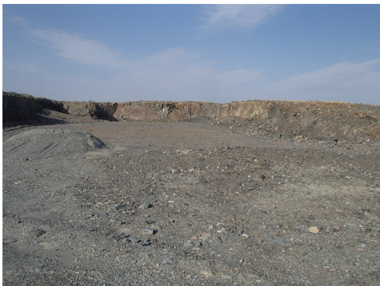
Photograph F1-44: Quarry 22 – km 99+200

Description: View of the south and west walls.