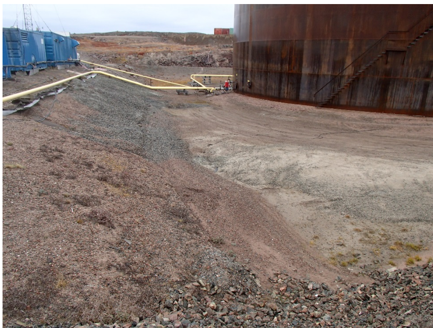
Photograph G1-2 Baker Lake Tank Farm

Description: From the south side of Tank 1, looking southeast at Tanks 1, 2, 3, and 4. Presence of water ponding.