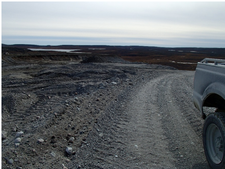
Photograph F2-11 Eskers and Quarries 4 – km 46+000