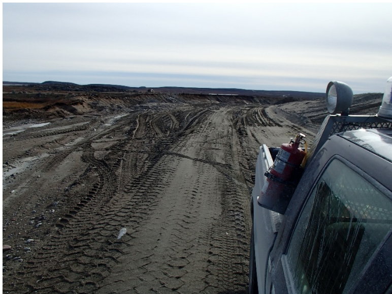
Photograph F2-9 Eskers and Quarries 4 – km 46+000