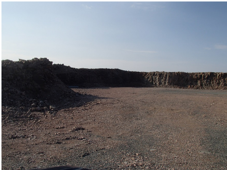
Photograph F1-41: Quarry 21 – km 93+400