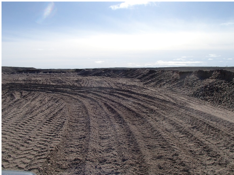
Photograph F2-17 Eskers and Quarries 6 – km 62+000