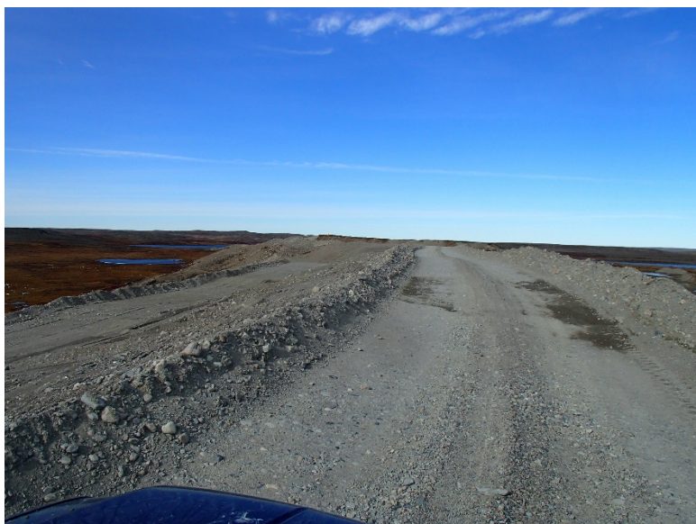
Photograph F2-10 Eskers and Quarries 4 – km 46+000

Description: View of esker #3. The 2-m high steep soil slopes are unstable.