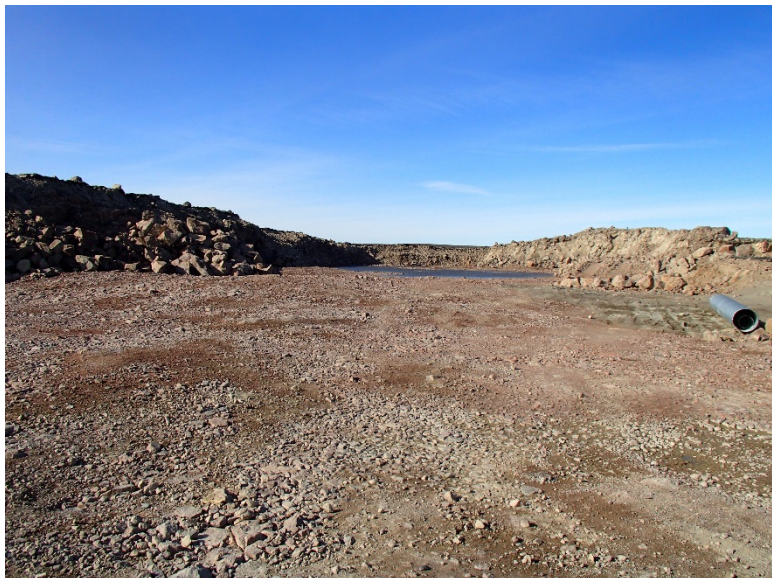
Photograph F2-13 Eskers and Quarries 5 – km 52+000