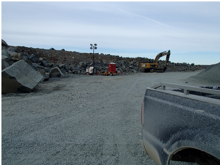
Photograph F2-5 Eskers and Quarries 3 – km 35+000