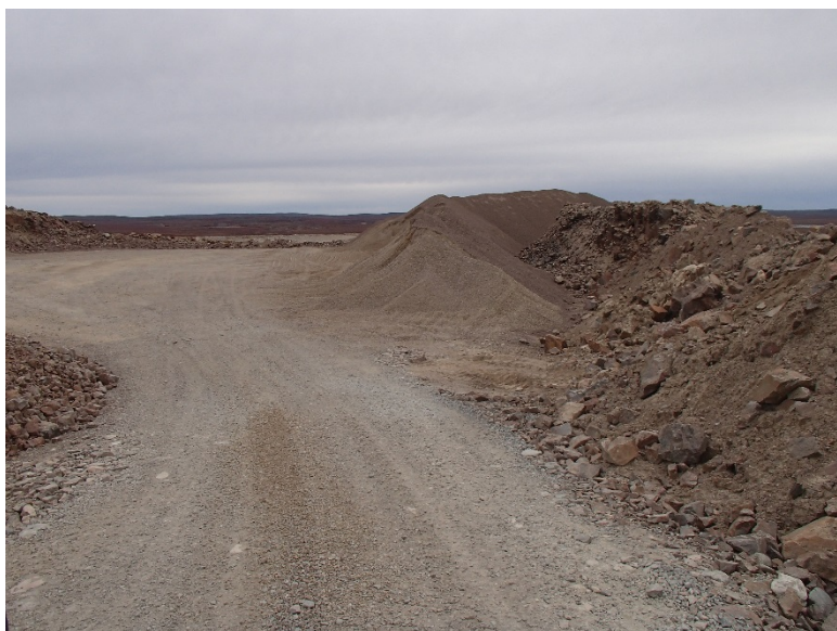
Photograph F2-2 Eskers and Quarries 1 – km 15+000

Description: View of esker #1. Loose rock is present on the steep wall.