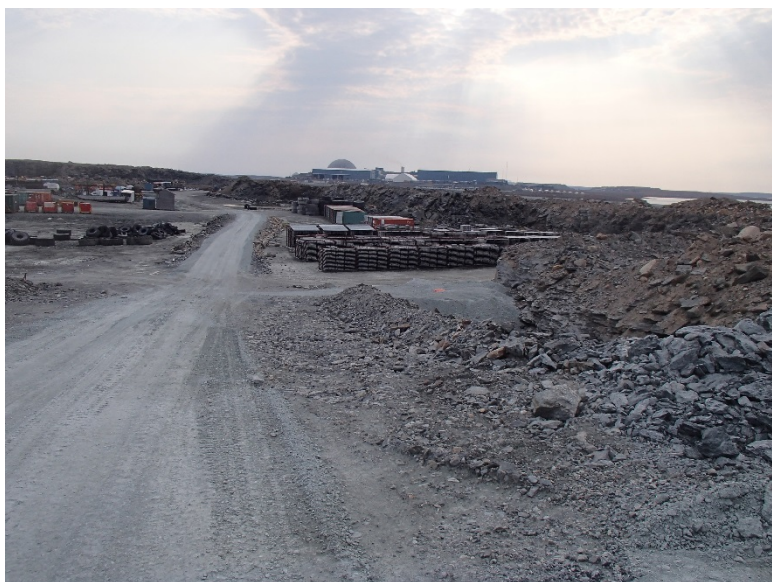
Photograph F1-46: Quarry 23 (Airstrip Quarry)