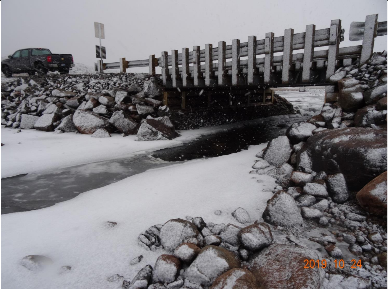
Description: Cuvlets blocked downstream side on Road to Nowhere bridge.