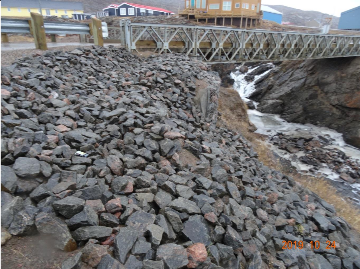
Description: Apex Bridge