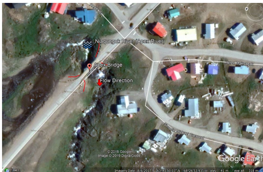
FIGURE 1 Location of Silt Fences

Silt fences will be installed on the sides of the bridge, as long as it is safe for workers to do so, to prevent silt from making its way towards Koojesse Inlet. The silt fences will be inspected and repaired, as required, prior to, and immediately following, large precipitation events. Silt will be cleared once it reaches one-third the height of the fence. The following figure shows the location where the silt fences will be installed (silt fences are represented by red lines).