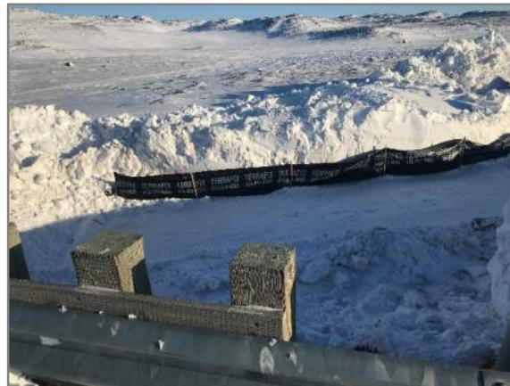
Photo 5: Silt fence installation across the Apex River channel on the south (downstream) side of the Road to Nowhere bridge.