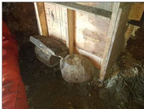
Photo 10: Minor grout seepage after pouring at the Road to Nowhere bridge. Area cleared of excess grout once hardened.