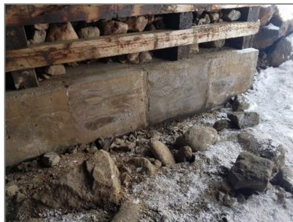
Photo 11: Completed concrete work under the west abutment of the Road to Nowhere bridge.