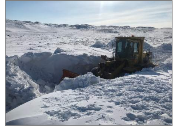
Photo 3: Looking south from the Road to Nowhere bridge at snow clearing activities to access the underside of the bridge.