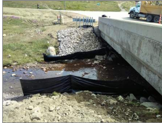
Photo 14: Looking North toward finished bank and guide rail repair at Astro Hill bridge. Silt fencing and erosion mitigation measures installed.