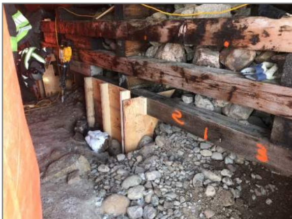
Photo 7: Concrete form installed and awaiting grout on the west abutment of the Road to Nowhere bridge.