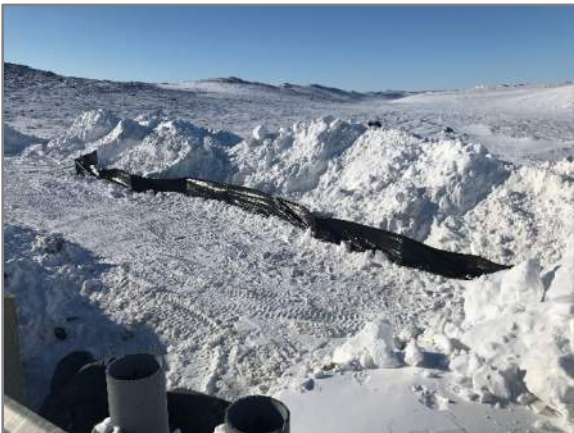
Photo 4: Silt fence installation across the Apex River channel on the north (upstream) side of the Road to Nowhere bridge.