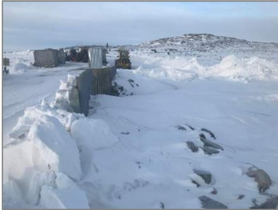
Photo 1: North face of the Road to Nowhere bridge. Heavy equipment and work camp on the west side of the bridge.