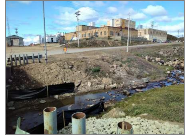
Photo 15: Looking south toward unfinished bank repair at Astro Hill bridge. Silt fence installed.