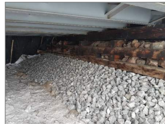
Photo 12: Riprap installed to protect Road to Nowhere bridge abutment concrete footings.