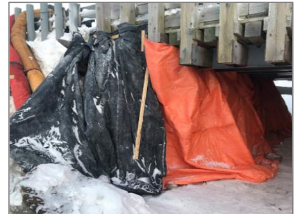
Photo 6: West abutment enclosure for aggregate removal and concrete work.