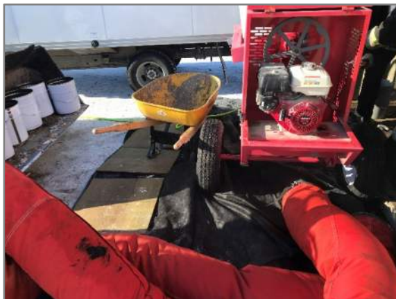
Photo 8: Secondary containment beneath concrete mixer on Road to Nowhere.