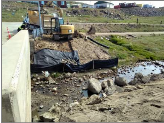
Photo 13: Bank and guide rail repair silt fencing and erosion mitigation measures at the Astro Hill bridge.