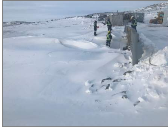
Photo 2: South face of the Road to Nowhere bridge looking west toward the work camp.