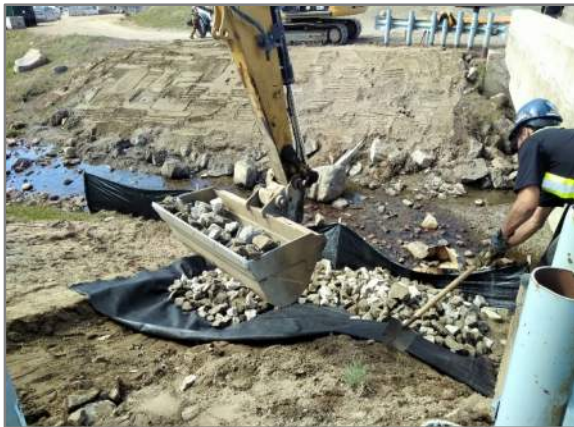
Photo 16: Bank repair in the foreground and graded bank in the background at the Astro Hill bridge.