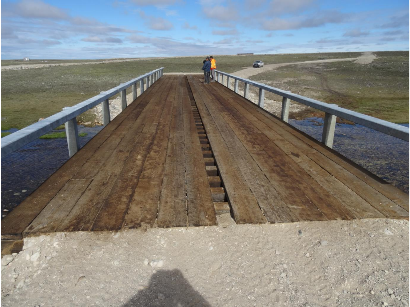
Description: Close-up view of top of Bridge looking towards town