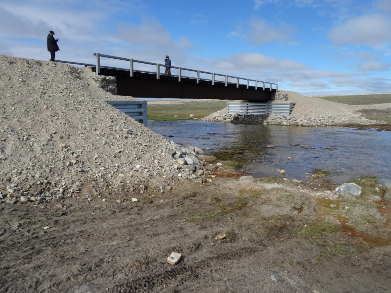
Description: Side View of Bridge showing Foundation