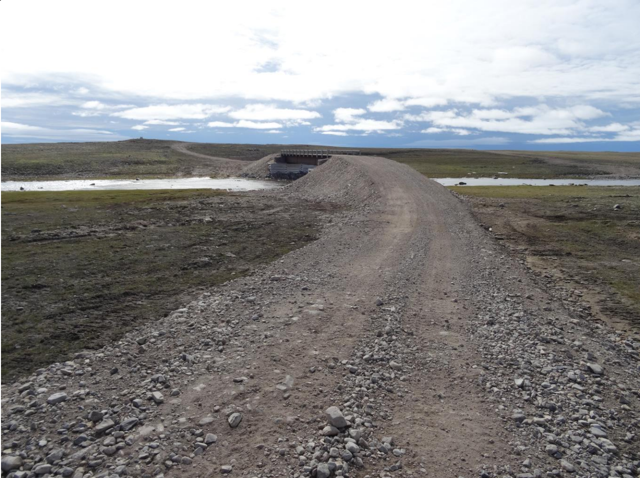
Description: View from Town Side of Bridge – Project is Complete – Road and Bridge are Actively in Use