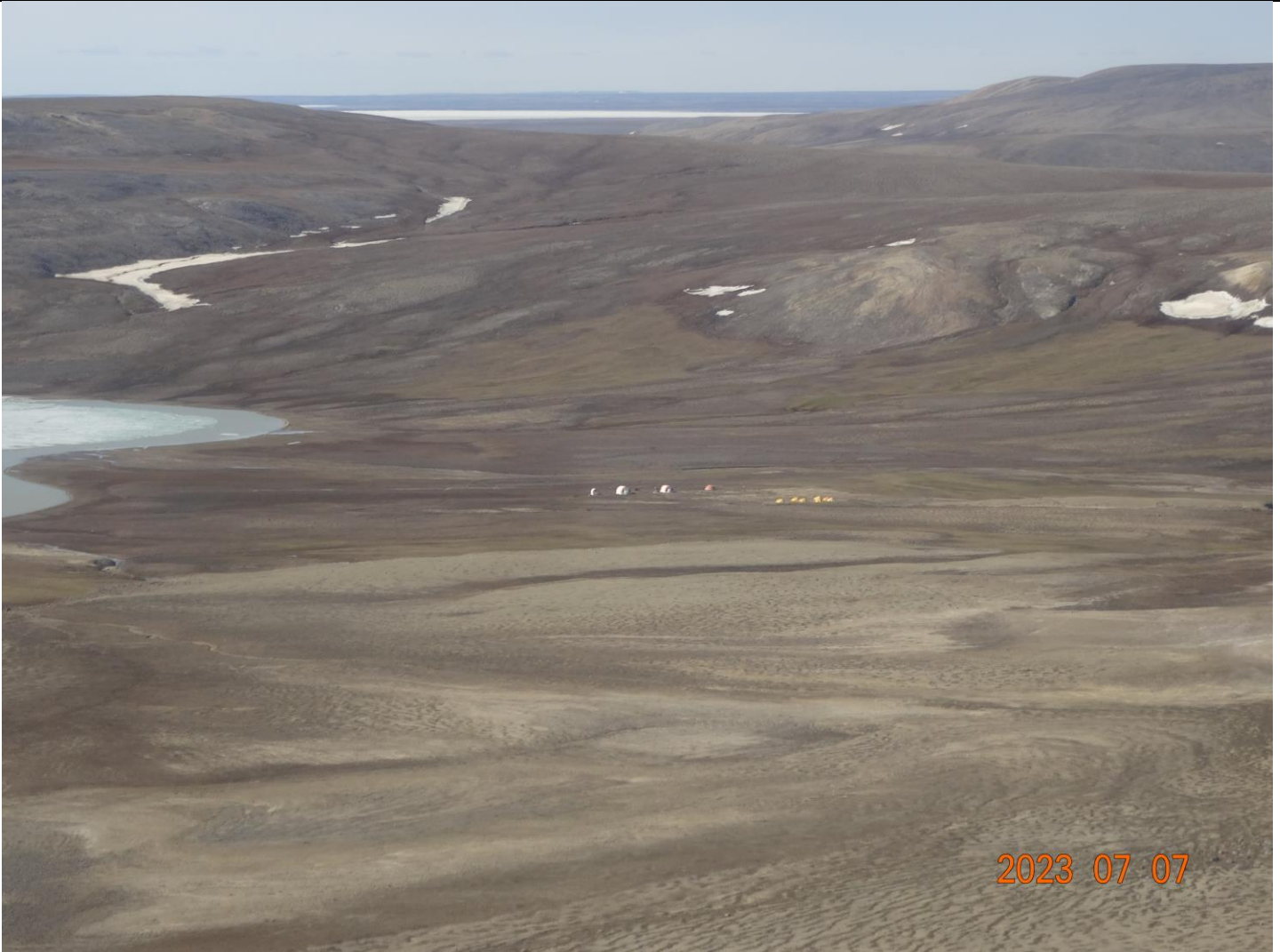
Description: Aerial Photo of the main camp at Cape Bounty Watershed Observatory.