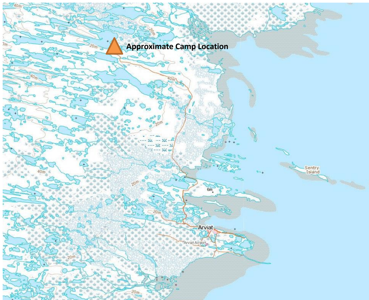
Figure 1. Location of the proposed camp in the Maguse River research area northwest of Arviat.