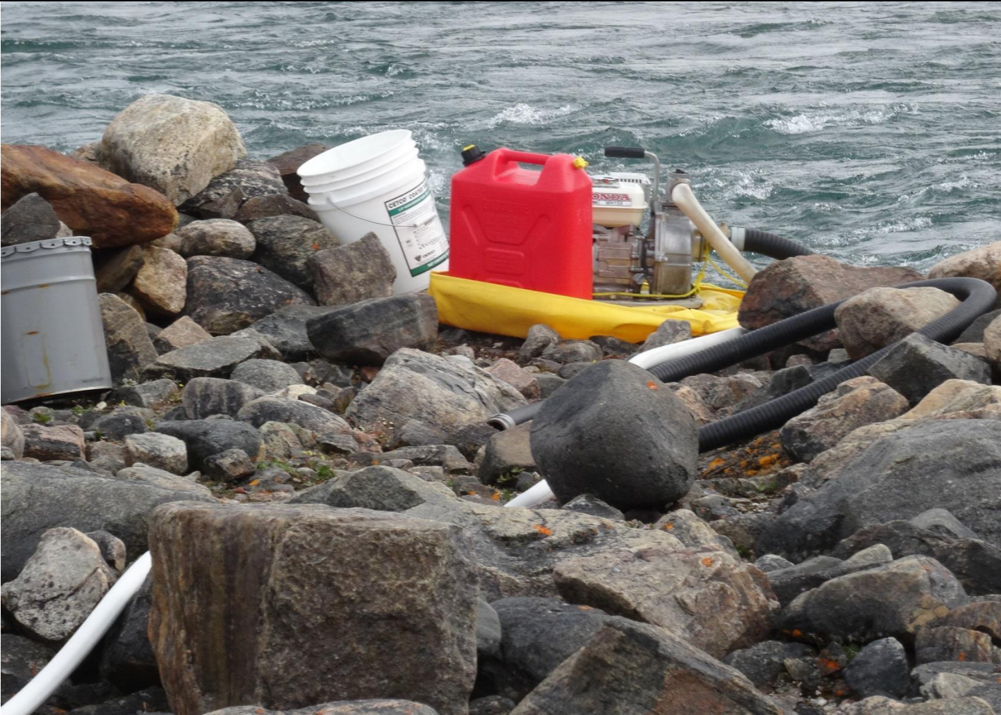
Description: Water Pump & Jerry Can in Secondary Containment down by the River