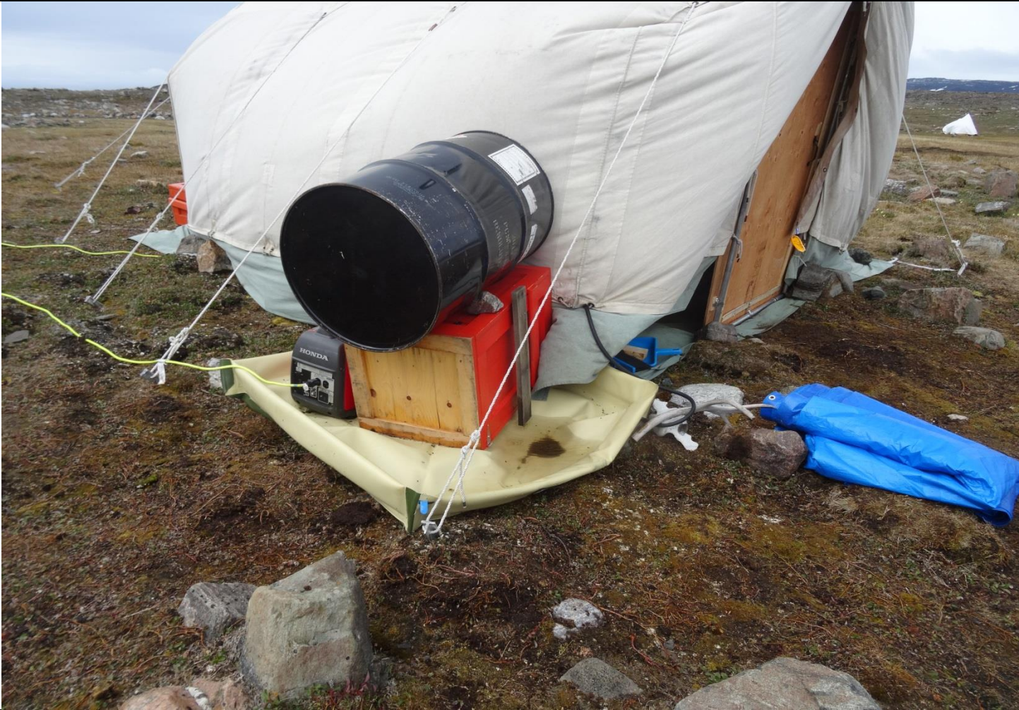
Description: Fuel Drum outside Tent

Photo Log # DSC03350 Location : Creswell Bay Camp