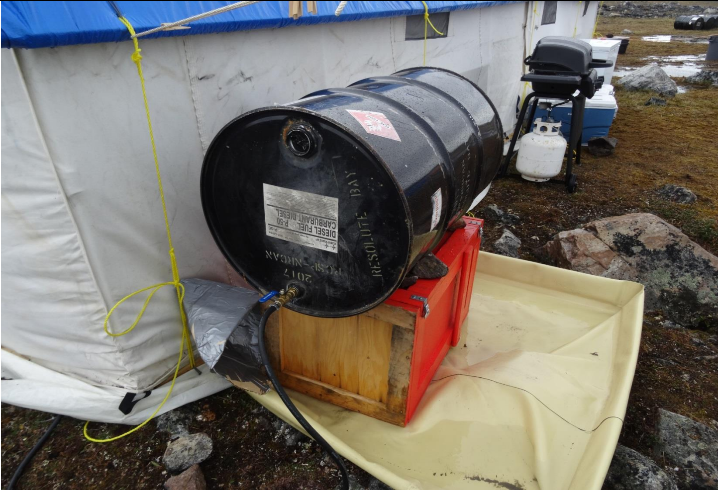
Description: Fuel Tank and Secondary Containment on Kitchen Tent

Photo Log # DSC03355 Location : Creswell Bay Camp