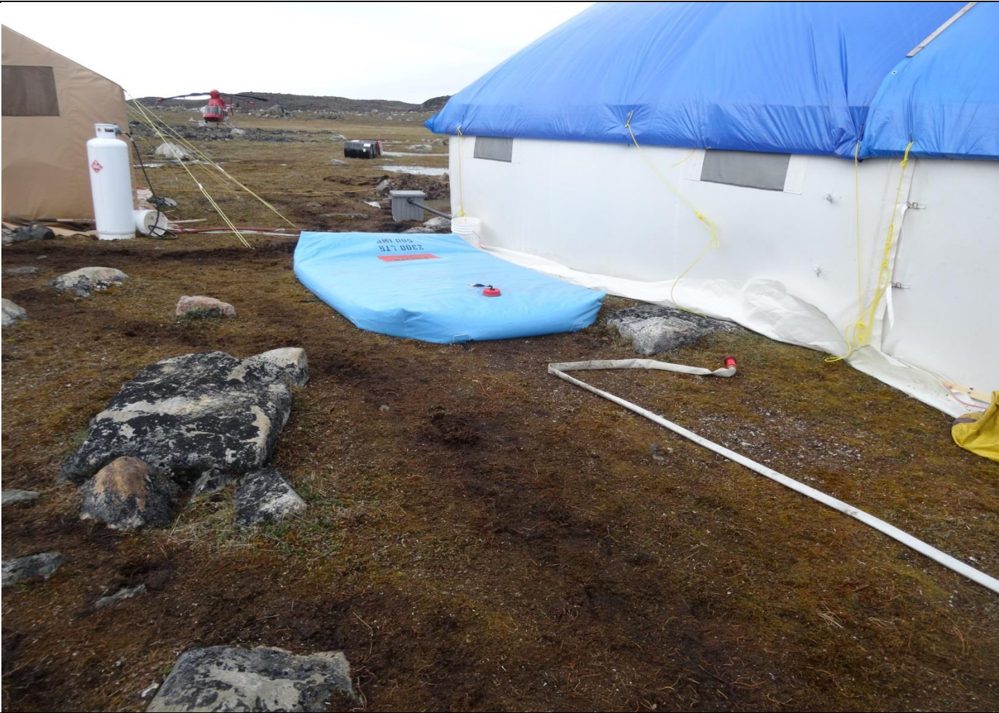
Description: Potable Water Storage Bladder outside Kitchen Tent