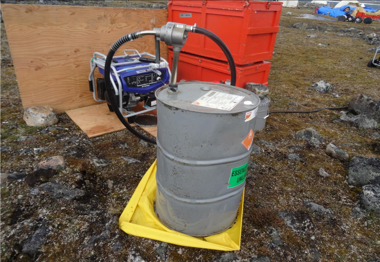
Description: Camp Generator and Fuel Drum in Secondary Containment