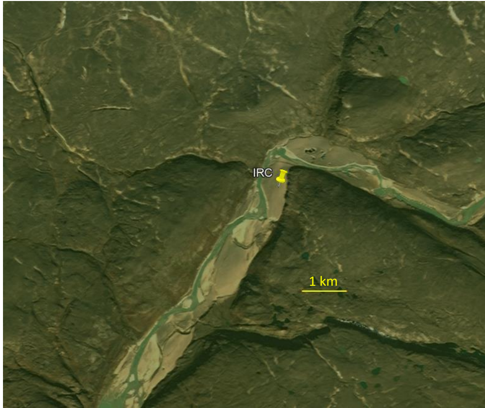
Figure 2: Landsat view of proposed camp along the Isortoq River (IRC – Isortoq River Camp).