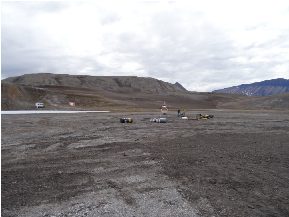
Figure 7 Strip at lower site