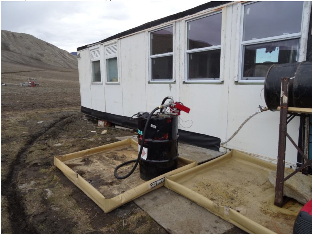
Figure 9 Upper site building. Secondary Containment and spill clean-up materials