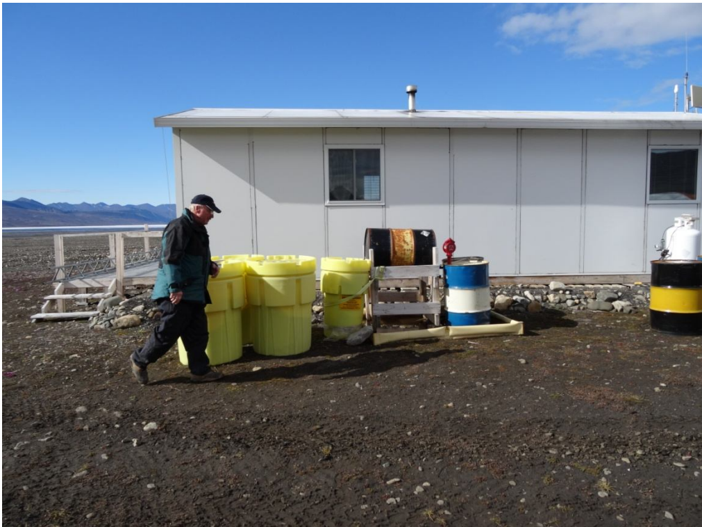
Figure 2 Secondary Containment and Clean up materials found on site