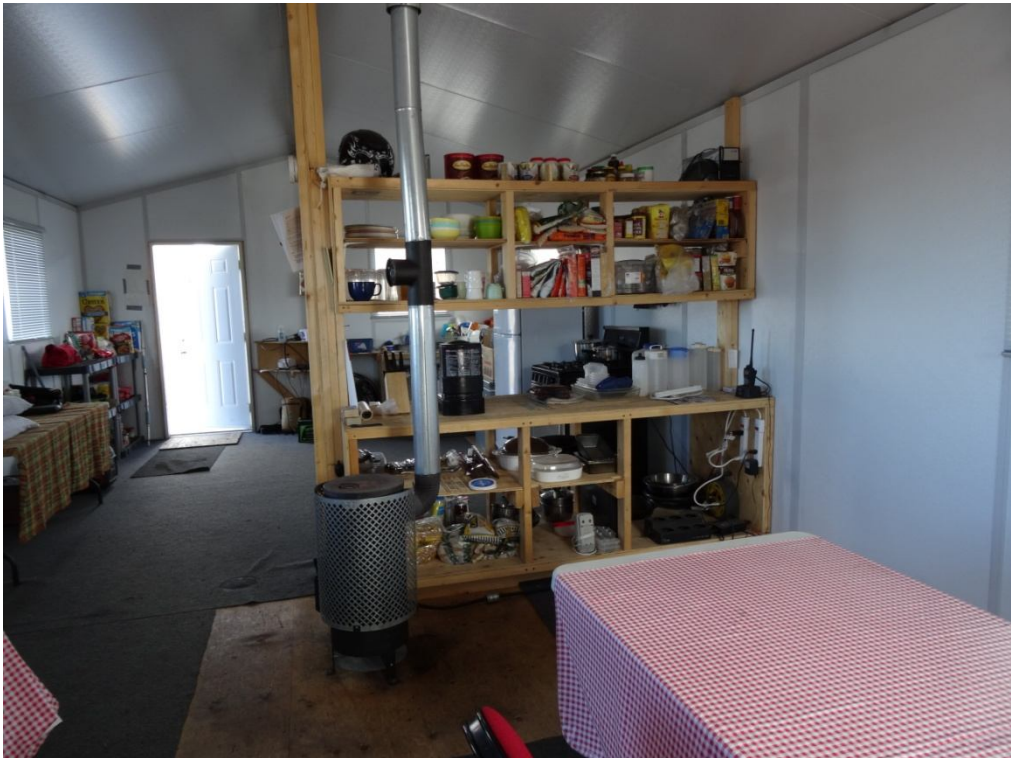
Figure 4Camp kitchen and repeater station for comms