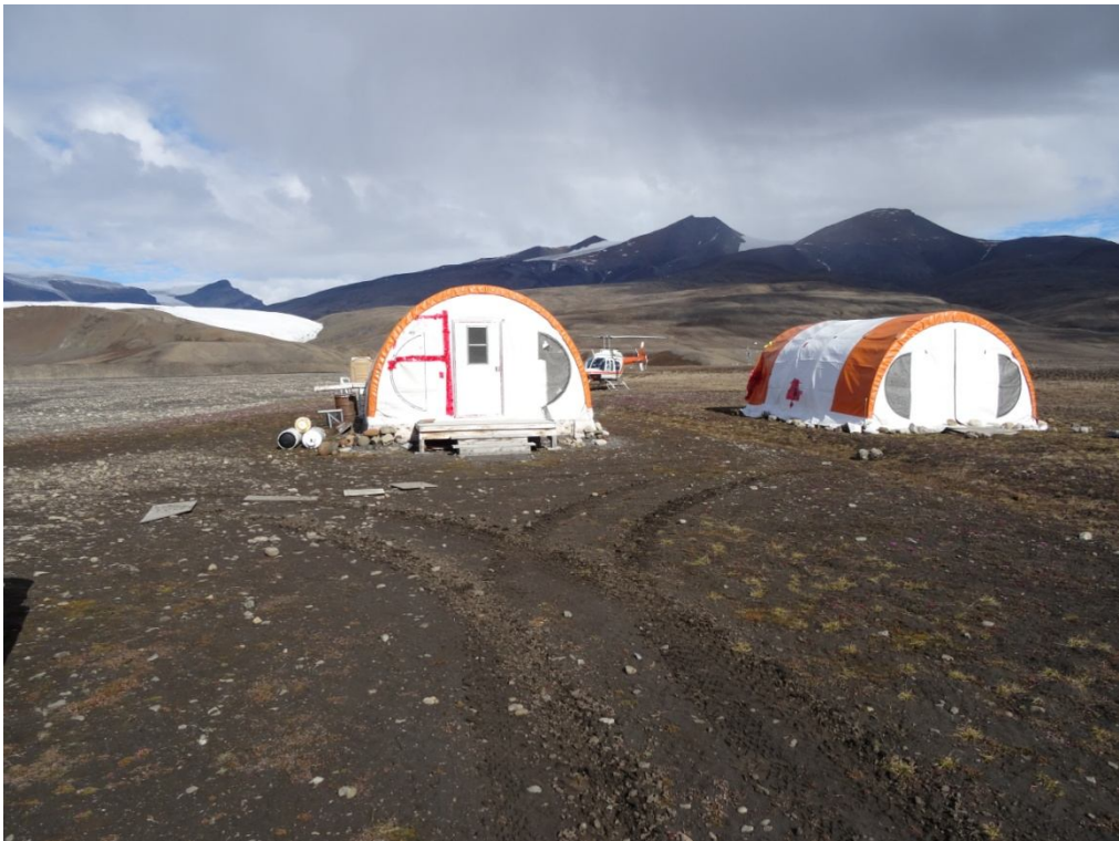
Figure 1Weather havens have signs of repeated repairs

Canadian Space Agency Camp – Not in Use – Maintained by 3BC-MGU1015...No authorizations are associated with this camp.