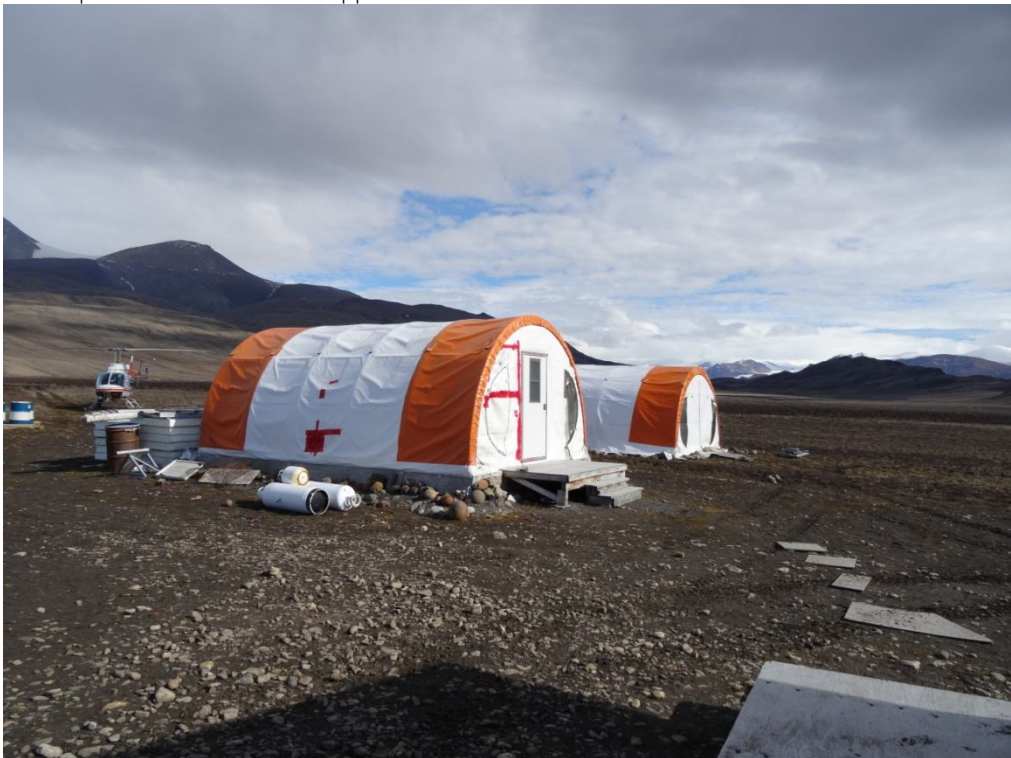
Figure 3 Camp is not used at this time