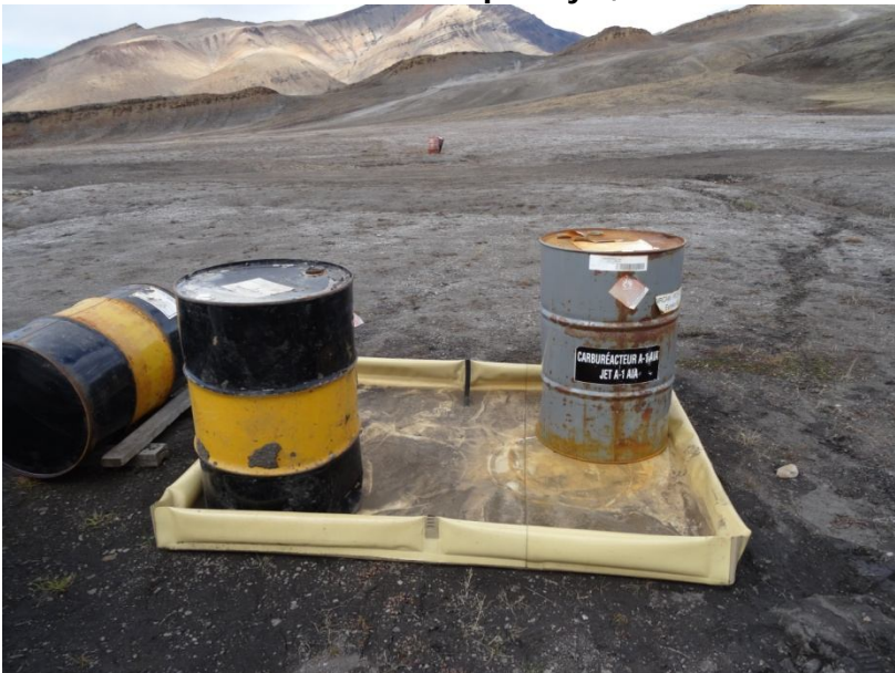
Figure 5 Secondary Contain ment for fuel transfer area at strip - lower site