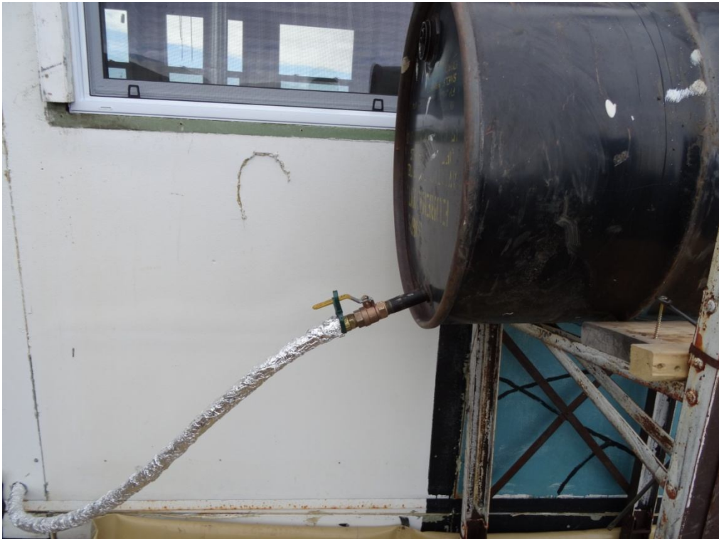
Figure 10 Upper site Fuel lines wrapped in Tin foil to stop animals from chewing on them.. Connectors should be wrapped in absorbent material