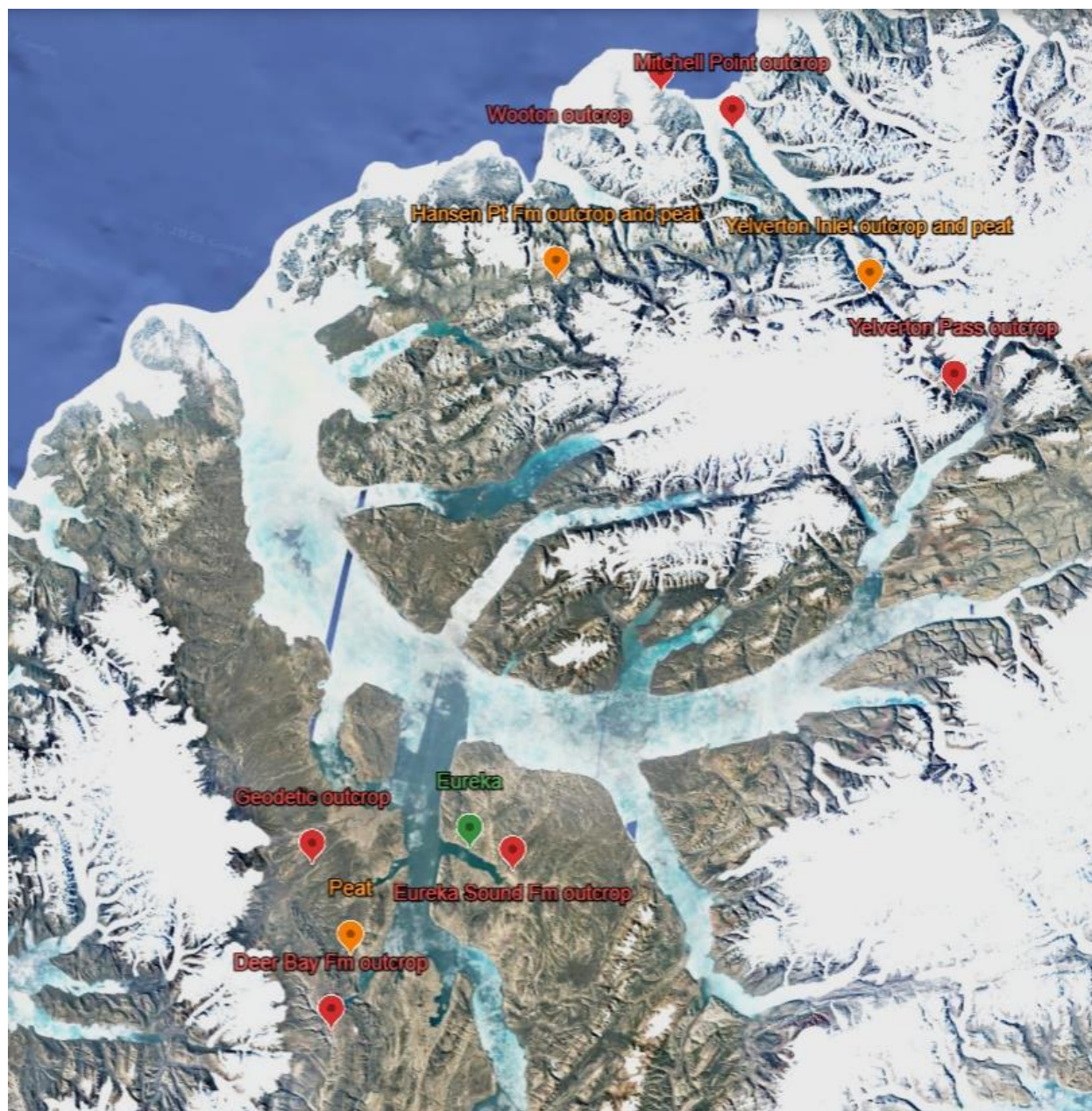
Figure 2. Proposed data and sampling locations are dependent on conditions allowing for helicopter access, and limited time in the field during the 2025 fieldwork.