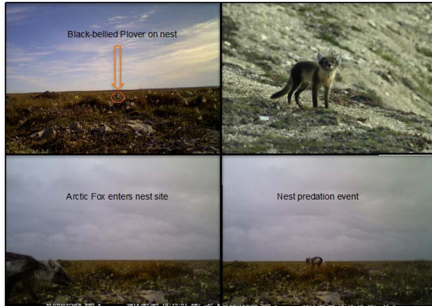
Figure 4. The arctic fox is the most important predator of shorebird nests at the East Bay and Coats Island sites. Our research will determine whether the foxes attracted to goose colonies have a negative effect on shorebirds' breeding success.