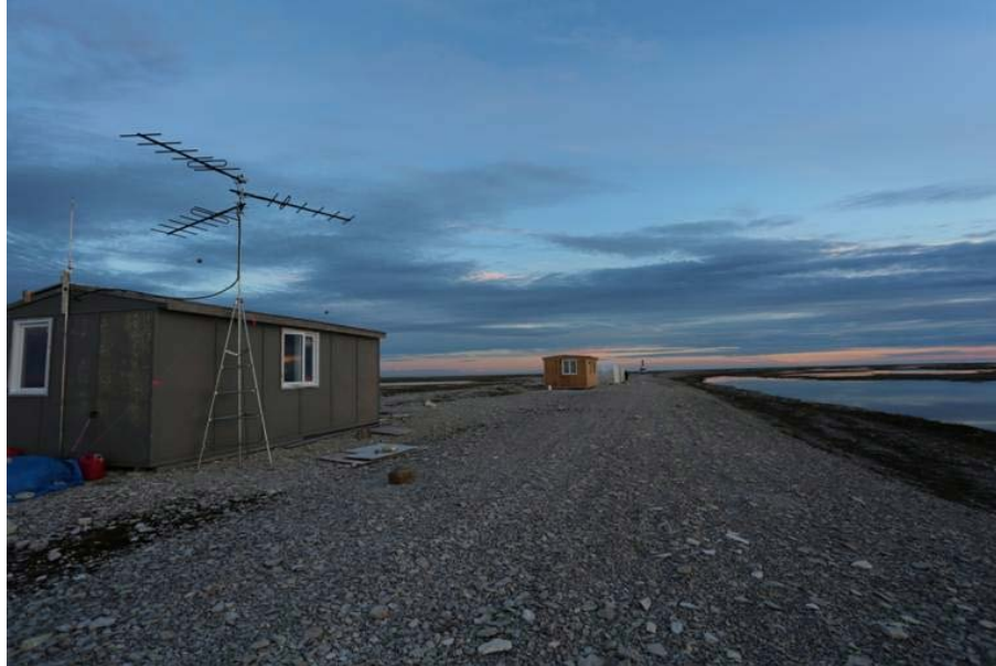
Figure 3. The VHF telemetry tower at East Bay. This tower monitors radio signals emitted by tiny tags deployed on shorebirds breeding in the area, in order to monitor their behaviour and timing of departure for migration.