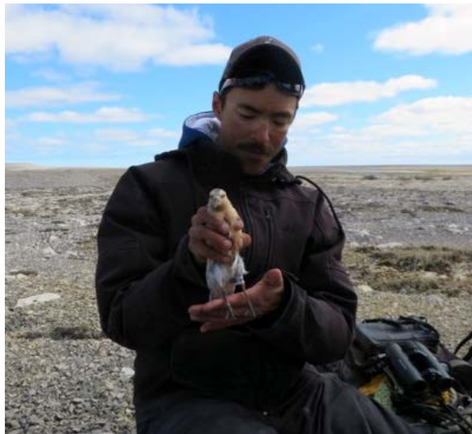
Figure 5. The rufa Red Knot is endangered in Canada and under consideration for listing in the United States. Southampton Island is within the core of its breeding range. Working with collaborators Larry Niles (Conserve Wildlife Foundation New Jersey) and Rick Lathrop (Rutger's University), we have produced a model describing preferred habitat across Southampton Island. Warmer colours (greens and yellows) indicate preferred habitat, while blue indicates unsuitable areas.